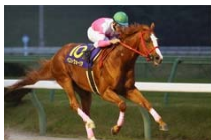
Best Warrior in the 2014 Mile Championship Nambu Hai

Incantation (JPN, H5, by Sinister Minister) disappointed to tenth in his last Champions Cup, despite being sent to post the fourth choice, but bounced back to form this season by finishing a 1/2-length second in the spring version of JRA's dirt G1, the February Stakes. He is currently sidelined after pulling up from his third grade-race victory in the Heian Stakes with a fracture of the first phalanx in his left hindlimb. Chrysolite (JPN, H5, by Gold Allure) , the 2013 Japan Dirt Derby (dirt, 2,000m) winner, had a runner-up effort in the JBC Classic last year and then entered the inaugural running of the Champions Cup, but flopped badly to 14th. He rebounded to prove his performance in June, missing by just 3/4 length to Hokko Tarumae in the Teio Sho.