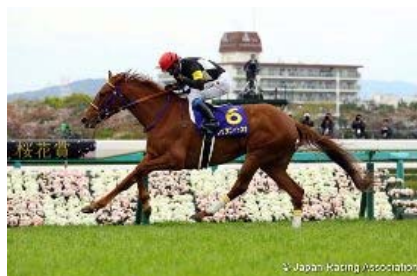
Let's Go Donki in the 2015 Oka Sho