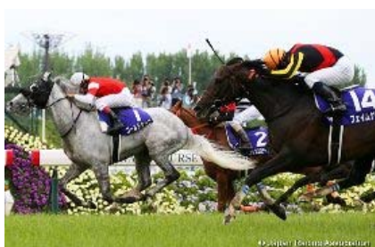
Gold Ship in the 2015 Tenno Sho (Spring)

Meanwhile, Gold Ship , who was not available for the Japan Cup last season, scored his third successive Hanshin Daishoten title in March. In the Tenno Sho (Spring), despite displaying his erratic behavior when being loaded into the gate and then trailing behind early, he commenced his attack with 1,000 meters to go and prevailed by a neck margin for the victory. Typical of the unpredictable son of Stay Gold , the heavy favorite gray was rank in the gate, missed his break in the Takarazuka Kinen and was