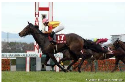
Queens Ring in the 2015 Fillies' Revue