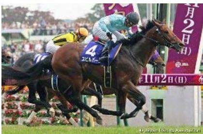
Spielberg in the 2014 Tenno Sho (Autumn)

The only horse among Japan Cup's top five finishers that has continued to train is third-place finisher Spielberg (JPN, H6, by Deep Impact ). Kicking off this season with a fourth-place finish in the Sankei Osaka Hai (G2, 2,000m), he traveled to Great Britain for the Prince of Wales's Stakes (G1, 2,000m) at Royal Ascot, where he turned in a lackluster sixth. But he has maintained his health and is already training to defend his title in the Tenno Sho (Autumn) (G1, 2,000m) and then head to the