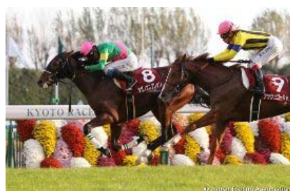
Tagano Espresso in the 2014 Daily Hai Nisai Stakes

The Rose Stakes (G2, 1,800m), held on September 20 as the major trial for the Shuka Sho (G1, 2,000m), the final leg of the three-year-old Fillies' Triple Crown, was won by Touching Speech (JPN, F3, by Deep Impact) , who had just stepped up in class after a winning an allowance race. She demonstrated a terrific turn of speed racing second from last early and zoomed to a 1-1/2-length