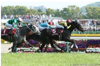
Sing with Joy in the 2015 Flora Stakes