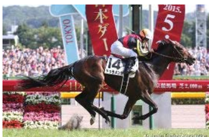
Duramente in the 2015 Tokyo Yushun

Deep Impact ), who had finished a 1-3/4-length second in the Tokyo Yushun after winning the Kyoto Shimbun Hai (G2, 2,200m) in May. Bright Emblem (JPN, C3, by Neo Universe) , a Satsuki Sho fourth-place finisher and a grade-race winner in the Sapporo Nisai Stakes (G3, 1,800m) as a two-year-old, was unable to live up to his billing, finishing a disappointing 10th.