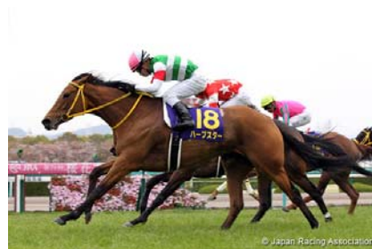
Harp Star in the 2014 Oka Sho