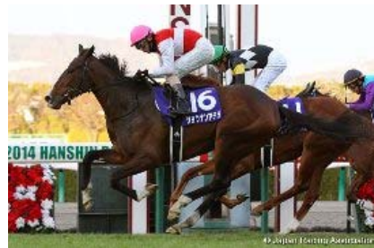
Shonan Adela in the 2014 Hanshin Juvenile Fillies

Queen's Milagro (JPN, F3, by Manhattan Cafe) and White Elegance (JPN, F3, by Kurofune) also earned berths in the Shuka Sho by finishing first and second, respectively, in another trial race, the Shion Stakes (2,000m), on September 12.