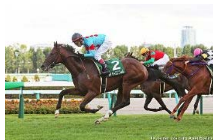
Bright Emblem in the 2014 Sapporo Nisai Stakes

Lia Fail (JPN, C3, by Zenno Rob Roy) made a successful switch from dirt to turf racing this season, winning his first two turf starts, including his first grade-race victory in the Kobe Shimbun Hai (G2, 2,400m) on September 27. Real Steel (JPN, C3, by Deep Impact) , runner-up by 1-1/2 lengths in the Satsuki Sho and fourth in the Tokyo Yushun, finished second. Tagano Espresso (JPN, C3, by Black Tide) , victor in the 2014 Daily Hai Nisai Stakes (G2, 1,600m), disappointed to eighth.