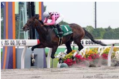
Incantation in the 2015 Heian Stakes

Copano Rickey (JPN, H5, by Gold Allure) also failed to live up to his billing as the race favorite in the last Champions Cup, where he broke poorly and finished a distant 12th. In his next start, the Tokyo Daishoten, he was no match for winner Hokko Tarumae but he bested the rest of the field. He kicked off his 2015 season with a win in the Tokai Stakes (G2, dirt, 1,800m) and proceeded to score a consecutive win in the February Stakes. Although he was found to have a mild fracture of the distal radius in his left foreleg, he is due to return to racing in time for the Nippon TV Hai (dirt, 1,800m) on October 7, prior to the JBC Classic in November. The outcome of this race against Hokko Tarumae will greatly influence expectations for the Champions Cup.