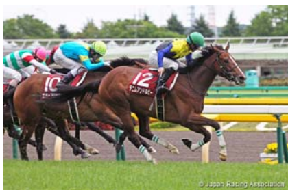
Denim and Ruby in the 2013 Flora Stakes

2,500m) in May—and have continued to make their presence felt in big events.