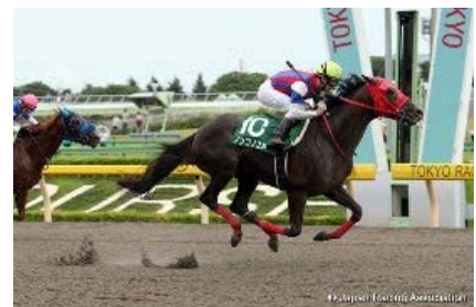
Nonkono Yume in the 2015 Unicorn Stakes

Nonkono Yume (JPN, C3, by Twining) is first in line among the up-and-coming three-year-olds with back-to-back grade-race victories in the Unicorn Stakes (G3, 1,600m) in June and his first G1 title in the Japan Dirt Derby.