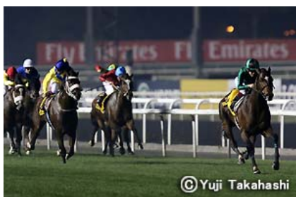
Just a Way (right) in the 2014 Dubai Duty Free

Harp Star (JPN, by Deep Impact ), who finished an impressive fifth in the Japan Cup, created high expectations for her four-year-old season, but like Epiphaneia she retired unexpectedly. In her first start this year, she was sent to post the heavy favorite in the Kyoto Kinen (G2, 2,200m) in February, but disappointed to fifth. She then flew to Dubai for the Dubai Sheema Classic (G1, 2,410m), joined by fellow four-year-old and 2014 Tokyo Yushun (Japanese Derby, G1, 2,400m) winner, One and Only (JPN, C4, by Heart's Cry ). After finishing eighth in a field of nine, however, she was diagnosed with injuries to the suspensory and sesamoidean ligaments in her right foreleg, prompting an early retirement and the start of a new career as a promising broodmare.