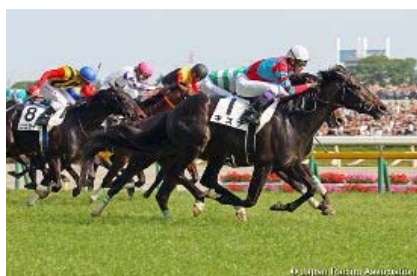
Kizuna in the 2013 Tokyo Yushun

The 2013 derby winner, Kizuna (JPN, H5, by Deep Impact) , returned from a long break after sustaining a fracture in his left foreleg following a fourth-place finish in the Tenno Sho (Spring) last year. He was third in his comeback start in the Kyoto Kinen in February and the runner-up in his next start, the Sankei Osaka Hai in April. But then he fell short in this year's Tenno Sho (Spring), prompting his connections to cancel a trip to Longchamp for the Prix de l'Arc de Triomphe. Unfortunately, in midst of training towards the Tenno Sho (Autumn), he injured a tendon in his right foreleg and was forced to retire, so he will have to entrust his Arc dream to his offspring.