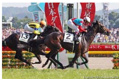
One and Only in the 2014 Tokyo Yushun

One and Only finished seventh in his first Japan Cup challenge and then 13th in the Arima Kinen. He kicked off his four-year-old campaign in the Dubai Sheema Classic and stalked the leaders early under Cristian Demuro, running alongside Dolniya (FR, F4, by Azamour ) and Flintshire (GB, H5, by Dansili ), who were fifth and second in the 2014 Prix de l'Arc de Triomphe (G1, 2,400m), respectively. While he was not quite able to keep up with the two,