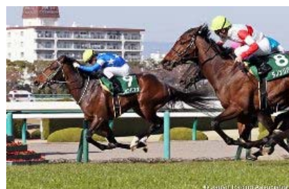
Musee Alien in the 2015 Mainichi Hai