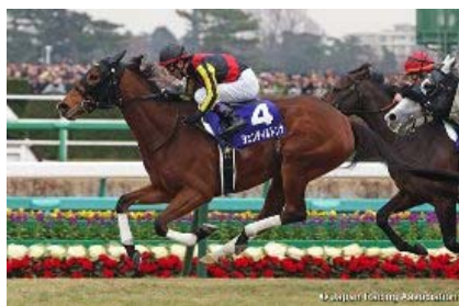
Gentildonna in the 2014 Arima Kinen