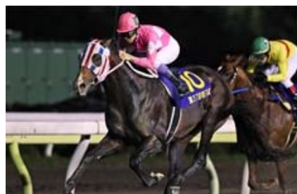
Wonder Acute in the 2014 Teio Sho

Wonder Acute (JPN, H9, by Charismatic) , fifth in the Champions Cup last year, is still going strongly at nine years of age. He landed his third G1 victory in the Kashiwa Kinen (dirt, 1,600m) in May and will return from his summer break for the Mile Championship Nambu Hai (dirt, 1,600m) on October 12. Others expected to run in the Nambu Hai include Grape Brandy (JPN, H7, by Manhattan Cafe) , who was ninth in the Champions Cup and won the 2013 February Stakes (G1, dirt, 1,600m), and Best Warrior (USA, H5, by Majestic Warrior) , who was 11th in the Champions Cup and won the Mile Championship Nambu Hai last year.