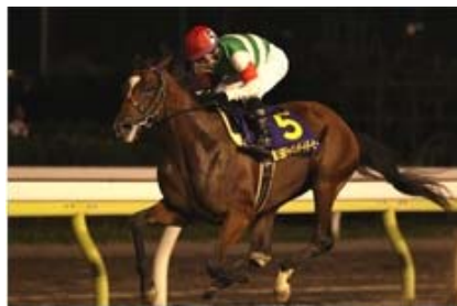
Chrysolite in the 2013 Japan Dirt Derby