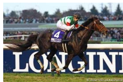
Epiphaneia in the 2014 Japan Cup

Epiphaneia (JPN, by Symboli Kris S ), who won the Japan Cup last year as a four-year-old, was in action for this year's race after concluding his 2014 campaign with a fifth-place finish in the Arima Kinen (G1, 2,500m). He kicked off his five-year-old season in the Dubai World Cup (G1, dirt, 2,000m) and was well beaten to last place in a field of nine on the dirt track at Meydan. Upon his return to Japan, while training for the Takarazuka Kinen (G1 2,200m), he injured a tendon in his left foreleg, forcing his connections to retire him from racing in late July.