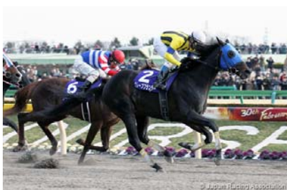
Grape Brandy in the 2013 February Stakes