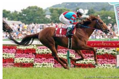
Hit the Target in the 2015 Meguro Kinen