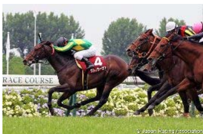
Satono Rasen in the 2015 Kyoto Shimbun Hai