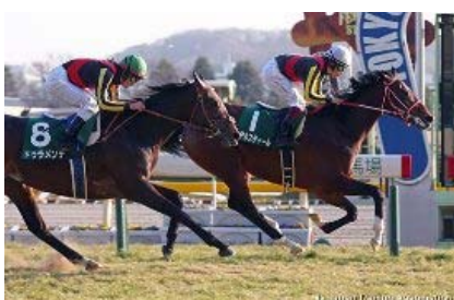
Real Steel in the 2015 Kyodo News Service Hai