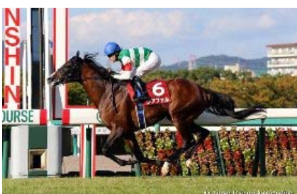
Lia Fail in the 2015 Kobe Shimbun Hai

Lia Fail (JPN, C3, by Zenno Rob Roy) made a successful switch from dirt to turf racing this season, winning his first two turf starts, including his first grade-race victory in the Kobe Shimbun Hai (G2, 2,400m) on September 27. Real Steel (JPN, C3, by Deep Impact) , runner-up by 1-1/2 lengths in the Satsuki Sho and fourth in the Tokyo Yushun, finished second. Tagano Espresso (JPN, C3, by Black Tide) , victor in the 2014 Daily Hai Nisai Stakes (G2, 1,600m), disappointed to eighth.