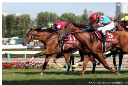
Decipher in the 2015 Sapporo Kinen