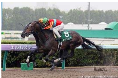
Roman Legend in the 2014 Elm Stakes