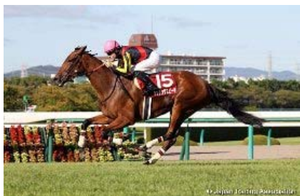
Touching Speech in the 2015 Rose Stakes

Queens Ring (JPN, F3, by Manhattan Cafe) , who won the Fillies' Revue (G2, 1,400m) in March and was fourth in the Oka Sho, followed in fifth. Sing with Joy (JPN, F3, by Manhattan Cafe) , winner of the Flora Stakes (G2, 2,000m) in April, faded to 14th. The 2014 Best Two-Year-Old Filly Shonan Adela (JPN, F3, by Deep Impact) , who was diagnosed with a fractured right foreleg in March prior to her much-expected three-year-old season, was due to come back in the fall for the Rose Stakes, but had to cancel due to another injury — a sprained left foreleg.