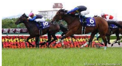
Lovely Day in the 2015 Takarazuka Kinen

Five-year-old Lovely Day has shown great improvement this season, landing his first grade-race title in the Nakayama Kimpai (G3, 2,000m) in January and then beating proven winners Kizuna and Harp Star for another title in the Kyoto Kinen. Although he was unsuccessful in handling extra distances of both the Hanshin Daishoten and the Tenno Sho (Spring), finishing sixth and eighth, respectively, he bounced back to win the Naruo