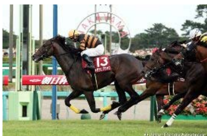
Kitasan Black in the 2015 St. Lite Kinen