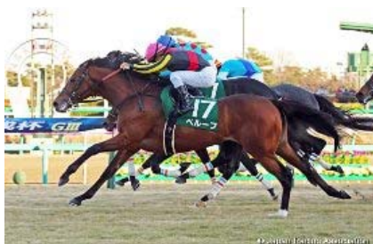
Beruf in the 2015 Keisei Hai