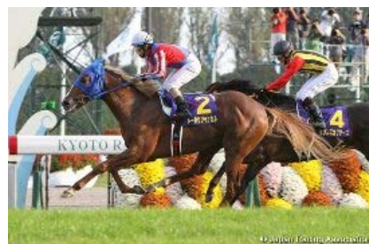
Toho Jackal in the 2014 Kikuka Sho

Toho Jackal (JPN, C4, by Special Week) captured his first G1 and classic title in the 2014 Kikuka Sho in record time, just 149 days after just making a late-career debut in May of his three-year-old season, but he was sidelined for eight months with a hoof problem thereafter. He performed well in his comeback start and four-year-old debut, finishing fourth in the Takarazuka Kinen, but he disliked the soft turf in the Sapporo Kinen in August, finishing eighth. He will run in the Tenno Sho (Autumn) and then head directly to the Japan Cup.