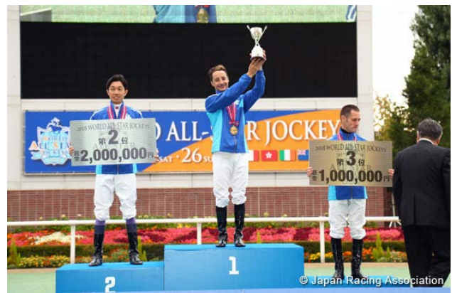
2018 World All-Star Jockeys (closing ceremony)