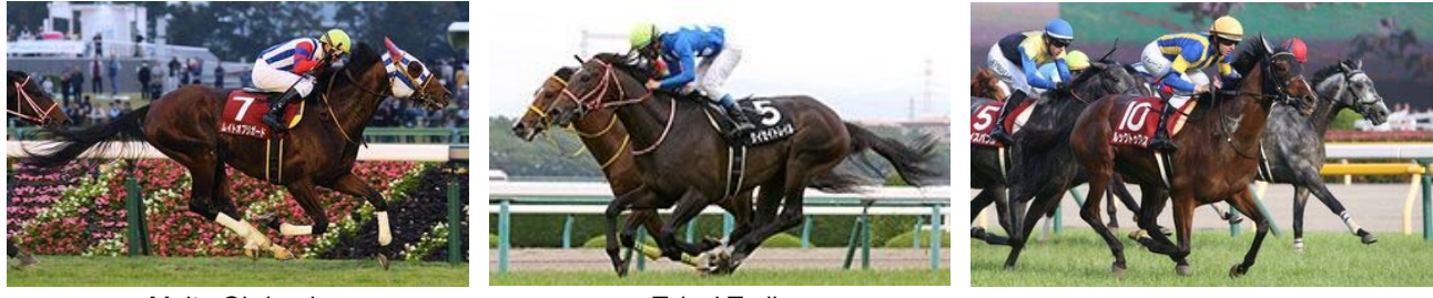
Muito Obrigado in the 2019 Copa Republica Argentina

Muito Obrigado (JPN, H5, by Rulership) is coming off a 1-1/4-length victory in the Copa Republica Argentina (G2, 2,500m) on Nov. 3. The son of Rulership, who landed his first grade-race title with notable speed from traveling in third position early, has four wins and a second out of six starts over distances between 2,400 and 2,500 meters at Tokyo Racecourse. His next target is to become the third horse to come off the same win and claim the Japan Cup after Screen Hero (JPN, by Grass Wonder) in 2008 and Cheval Grand . Taisei Trail (JPN, C4, by Heart's Cry) and Look Twice (JPN, H6, by Stay Gold) , who scored a record-breaking victory in the Meguro Kinen (G2, 2,500m) in May, will come off their respective second and fourth place finishes in the Copa Republica Argentina.