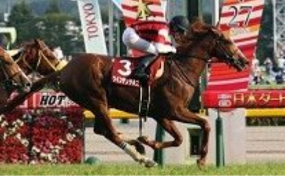
Win Tenderness in the 2018 Meguro Kinen