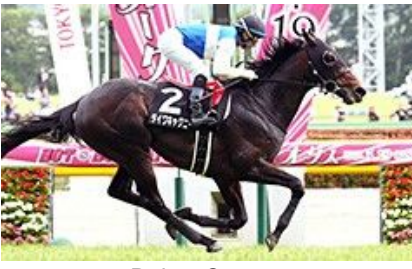
Daiwa Cagney in the 2019 May Stakes