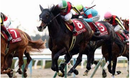
Danburite in the 2019 Kyoto Kinen

Muito Obrigado (JPN, H5, by Rulership) is coming off a 1-1/4-length victory in the Copa Republica Argentina (G2, 2,500m) on Nov. 3. The son of Rulership, who landed his first grade-race title with notable speed from traveling in third position early, has four wins and a second out of six starts over distances between 2,400 and 2,500 meters at Tokyo Racecourse. His next target is to become the third horse to come off the same win and claim the Japan Cup after Screen Hero (JPN, by Grass Wonder) in 2008 and Cheval Grand . Taisei Trail (JPN, C4, by Heart's Cry) and Look Twice (JPN, H6, by Stay Gold) , who scored a record-breaking victory in the Meguro Kinen (G2, 2,500m) in May, will come off their respective second and fourth place finishes in the Copa Republica Argentina.