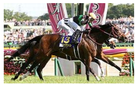
Loves Only You in the 2019 Yushun Himba