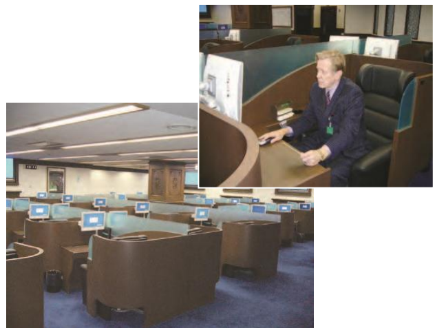
Excel floor (fixed capacity system with entry in order of arrival that day and admission charged)

JRA has 45 “WINS” off-course betting facilities nationwide and the 10 JRA racecourses which do not hold races also function as off-course betting facilities. Several of these have membership regulations, with restrictions on the number of people permitted in, offering a luxurious, salon-style environment in which to enjoy horse racing.