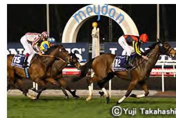
Gentildonna at 2014 Dubai Sheema Classic

The Japan Racing Association will present its 2014 Horse of the Year title to the mare Gentildonna , who collected her second such title in three years by earning 231 out of 285 votes for another year of outstanding achievements, including wins in the Dubai Sheema Classic and the Arima Kinen. The annual JRA Awards, which will be handed out in a ceremony at Tokyo on Monday, January 26, recognize horses, trainers, jockeys, other individuals and organizations for accomplished performances or achievements in the thoroughbred racing season.