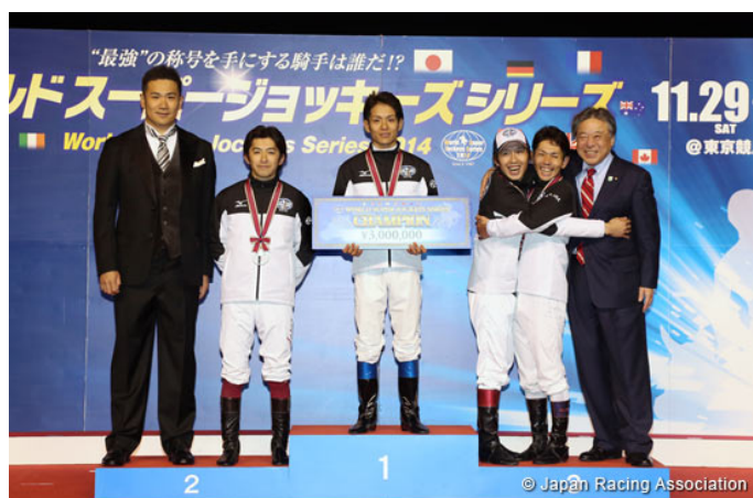
2014 World Super Jockeys Series (closing ceremony)

The first two of the four-race series will be conducted on August 29th (Sat), while the third and fourth will be held the following day (Sun).