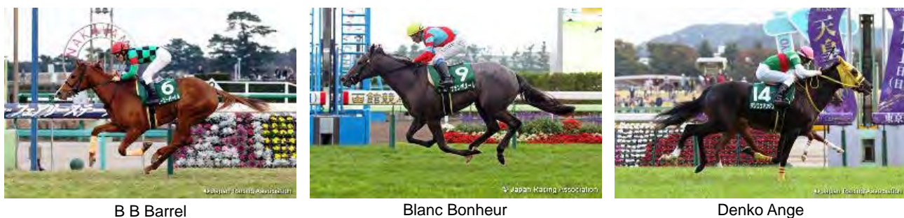
B B Barrel in the 2016 Fairy Stakes

the first three, with only Denko Ange finishing as high as fifth. Red Avancer was eighth while Win Fabulous and Blanc Bonheur disappointed to 10th and 14th in a field of 16. Sinhalite (JPN, F3, by Deep Impact) , who came into the race undefeated in two starts since her debut in October last year, claimed her first grade-race victory while renewing the race record previously set by Vodka (JPN, by Tanino Gimlet) by 0.9 second. Jeweler (JPN F3, by Victoire Pisa) , who was coming off a runner-up effort against male runners in the Shinzan Kinen, was a mere nose behind in second.