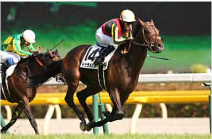
Duramente in the 2015 Tokyo Yushun

Three Japanese horses are contesting for the Dubai Sheema Classic (G1, 2,410m). Duramente (JPN, C4, by King Kamehameha) , the 2015 Best Three-Year-Old Colt as winner of two Triple Crown titles—the Satsuki Sho (Japanese 2000 Guineas, G1, 2,000m) and the Tokyo Yushun (Japanese Derby, G1, 2,400m)—was forced to sit out the rest of last season with