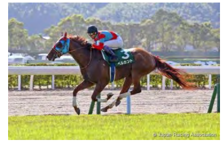
Bel Canto in the 2015 Kitakyushu Kinen

Meanwhile, 2015 Tenno Sho (Spring) (G1, 3,200m) fifth-place finisher Neo Black Dia (JPN, H8, by Zenno Rob Roy) will take part in the Dubai Gold Cup (G2, 3,200m) and 2015 Summer Sprint Series champion Bel Canto (JPN, M5, by Sakura Bakushin O) in the Al Quoz Sprint (G1, 1,000m).