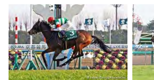
Rouge Buck in the 2015 Kisaragi Sho

Also appearing are Rouge Buck (JPN, F4, by Manhattan Cafe) , who was runner-up to Mikki Queen in the Yushun Himba last year, and multiple grade-race winner Sing with Joy (JPN, F4, by Manhattan Cafe) , who are coming off their respective second and 15th place starts in the Nakayama Himba Stakes (G3, 1,800m) on March 13. Sundarbans (JPN, M5, by Heart's Cry) took that title. 2015 Shuka Sho runner-up Queens Ring (JPN, F4, by Manhattan Cafe) will be following her Kyoto Himba Stakes victory.