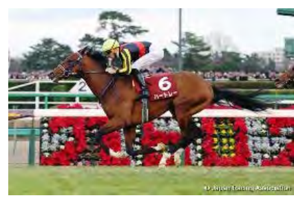
Hartley in the 2015 Hopeful Stakes