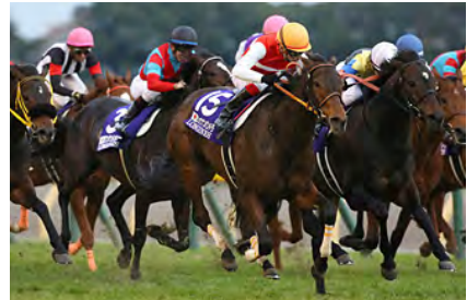
Shonan Pandora in the 2015 Japan Cup