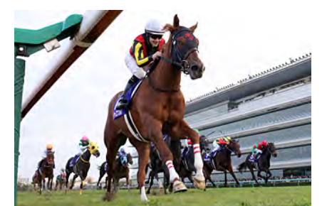
Major Emblem in the 2015 Hanshin Juvenile Fillies

Expectations for the first of the Fillies' Classics, the Oka Sho, center around 2015 Best Two-Year-Old Filly Major Emblem ( JPN, F3, by Daiwa Major ) who, after claiming the Hanshin Juvenile Fillies (G1, 1,600m) last season, forged an unsurmountable five-length lead in a seemingly effortless victory in the Queen Cup (G3, 1,600m) on February 13. B B Barrel ( JPN, F3, by Pyro ), who had come off a victory in the Fairy Stakes (G3, 1,600m) on January 11, finished ninth.