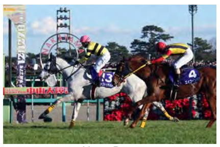
Up to Date in the 2015 Nakayama Daishogai

Best Steeplechase Horse of 2015 Up to Date (JPN, H6, by Kurofune) , winner of the Nakayama Grand Jump (J-G1, 4,250m) and the Nakayama Daishogai (J-G1, 4,100m), kicked off this season with a second-place finish in the Hanshin Spring Jump (J-G2, 3,900m) on March 12. He looked to be in good form for another strong performance in the coming J-G1 event.