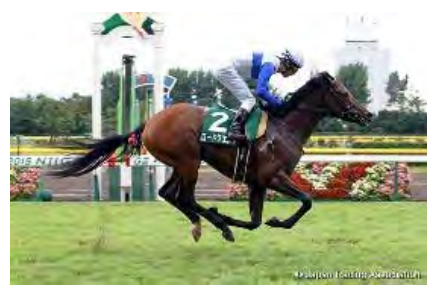
Lord Quest in the 2015 Niigata Nisai Stakes

2015 Niigata Nisai Stakes (G3, 1,600m) winner Lord Quest (JPN, C3, by Matsurida Gogh) and 2015 Kyoto Nisai Stakes (G3, 2,000m) winner Dreadnoughtus (JPN, C3, by Harbinger) will start in the Spring Stakes (G2, 1,800m) on March 20. Other possible Satsuki Sho starters will run in either the Wakaba Stakes 2,000m) on March 19 or the Mainichi Hai (G3, 1,800m) on March 26. Logi Cry (JPN, C3, by Heart's Cry), already a winner this year in the Shinzan Kinen (G3, 1,600m) on January 10, was initially scheduled for the Spring Stakes but has been sidelined with a blind splint and is hoped to recover in time for either the NHK Mile Cup on May 8 or the Tokyo Yushun on May 29.