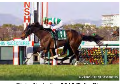
Sinhalite in the 2016 Tulip Sho

F3, by Stay Gold) and third-place finisher Blanc Bonheur (JPN, F3, by Deep Impact), who won the Hakodate Nisai Stakes (G3, 1,200m) in July 2015. The race also featured Denko Ange (JPN, F3, by Meisho Samson), a grade-race winner of the Artemis Stakes (G3, 1,600m) last year, and Red Avancer (JPN, F3, by Deep Impact), who was coming off a victory in the Elfin Stakes (1,600m) on February 6. However, none of them finished within