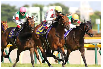
Mikki Queen in the 2015 Yushun Himba

The JRA's 2015 Best Three-Year-Old Filly, Mikki Queen (JPN, F4, by Deep Impact) , who claimed two of three fillies' Triple Crown races—the Yushun Himba and the Shuka Sho (G1, 2,000m)—is aiming for either the Yasuda Kinen on June 5 or the Takarazuka Kinen following her run in the Victoria Mile. After which, she will head for the Queen Elizabeth II Cup in the fall.