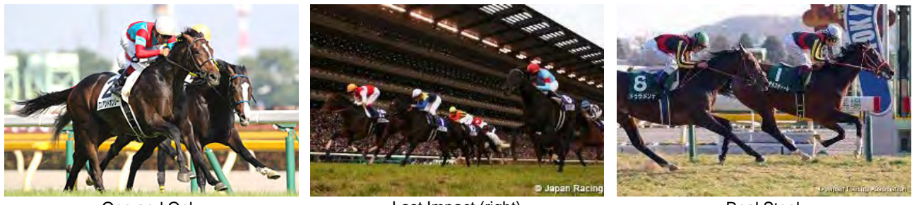
One and Only in the 2014 Tokyo Yushun

Real Steel (JPN, C4, by Deep Impact) , a prominent turf runner who was second, fourth and second in his Triple Crown starts as a three-year-old and then impressive again in his four-year-old debut with a third-place finish in the Nakayama Kinen, will be taking on the Dubai Turf (G1, 1,800m).