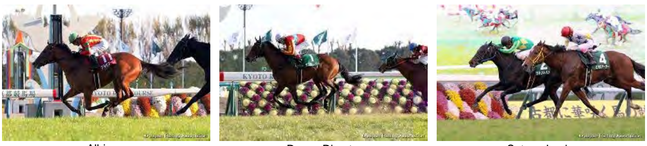
Albiano in the 2015 Swan Stakes