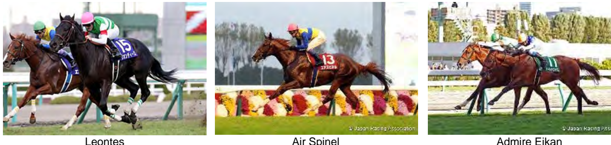
in the 2015 Asahi Hai Futurity Stakes

of the 12-horse field. However, he gradually made ground along the backstretch and showed a terrific turn of speed to launch a rally against Leontes , who took command coming into the homestretch with Air Spinel also close behind. Ultimately, Makahiki had the most in the tank among the three colts, as Air Spinel weakened after the furlong pole and Leontes finally gave way in the last strides for a neck second, although both were strong in defeat as the first runs of their three-year-old seasons. 2015 Sapporo Nisai Stakes (G3, 1,800m) winner Admire Eikan (JPN, C3, by Heart's Cry) showed improved form since his ninth-place finish in February but was beaten by almost eight lengths to fifth place.