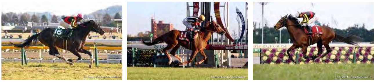
Fame Game in the 2015 Diamond Stakes

Heart's Cry ), along with Tanta Alegria (JPN, C4, by Zenno Rob Roy ), who finished fourth in the 2015 Kikuka Sho, and Reve Mistral (JPN, C4, by King Kamehameha ), winner of the Nikkei Shinshun Hai (G2, 2,400m) on January 17.