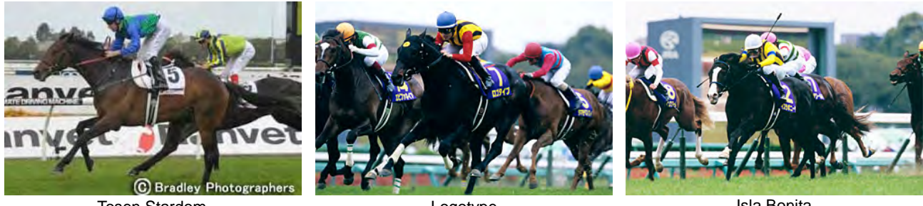
Tosen Stardom in the 2015 Ranvet Stakes

Meanwhile, 2013 Satsuki Sho winner and 2012 Best Two-Year Old Colt Logo Type (JPN, H6, by Lohengrin) and 2014 Satsuki Sho winner and Best Three-Year-Old Colt Isla Bonita (JPN, H5, by Fuji Kiseki), both planned to take part in The Championships, had their trips to Australia cancelled after having disappointed to seventh and ninth, respectively, in the Nakayama Kinen. Instead, Logo Type will head for the Lord Derby Challenge Trophy (G3, 1,600m) and Isla Bonita to the Sankei Osaka Hai (G2, 2,000m) on April 3. Tosen Reve (JPN, H8, by Deep Impact), a three-quarter brother to Buena Vista (JPN, by Special Week) , also was withdrawn after finishing ninth in the Kyoto Kinen.