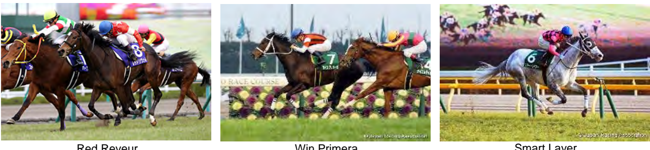
Red Reveur in the 2013 Hanshin Juvenile Fillies

Stay Gold), Win Primera (JPN, M6, by Stay Gold) and Smart Layer (JPN, M6, by Deep Impact). Win Primera won against male rivals in the Kyoto Kimpai (G3, 1,600m) on January 5 prior to finishing third in the Kyoto Himba Stakes (G3, 1,400m) on February 20, while Smart Layer beat out her male opponents in the Tokyo Shimbun Hai (G3, 1,600m) on February 7.