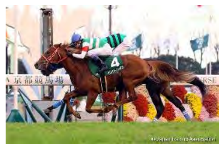
Dreadnoughtus in the 2015 Kyoto Nisai Stakes