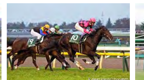
Smart Odin in the 2015 Tokyo Sports Hai Nisai Stakes