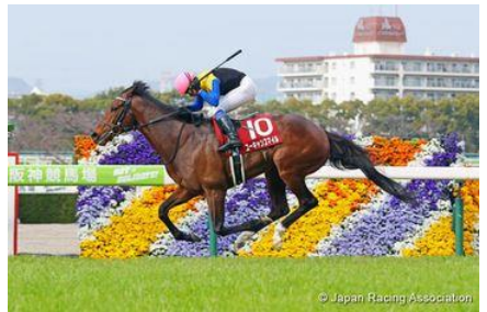
You Can Smile in the 2020 Hanshin Daishoten