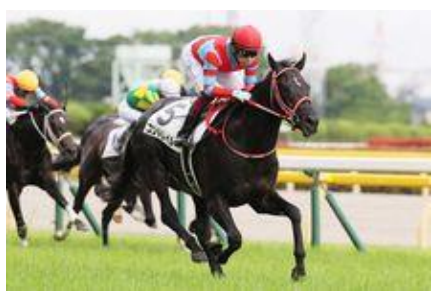
Contrail in the 2020 Tokyo Yushun