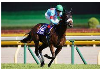
Almond Eye in the 2020 Victoria Mile