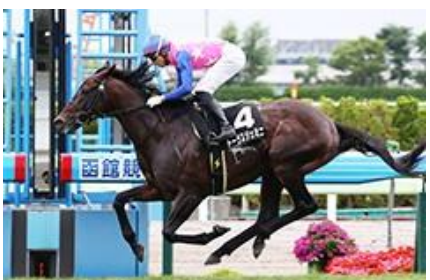
Taurus Gemini in the 2020 Tomoe Sho