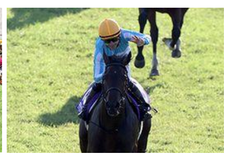
Daring Tact in the 2020 Oka Sho