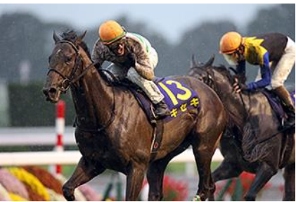
Kiseki in the 2017 Kikuka Sho