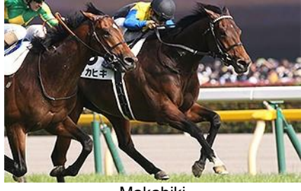
Makahiki in the 2016 Tokyo Yushun

Yoshio (JPN, H7, by Johannesburg), who will be making his first start on turf since racing just once, finishing eighth, in his two-year-old debut. He has a record of 6-4-11 out of 67 starts on dirt and is coming off a sixth-place finish in his previous start, the Mercury Cup (dirt, 2,000m) on July 21.