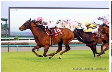
Mikki Swallow in the 2020 Nikkei Sho