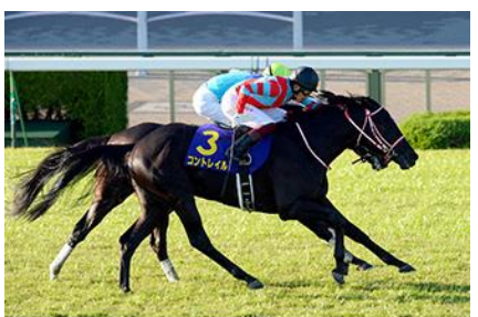
Contrail in the 2020 Kikuka Sho