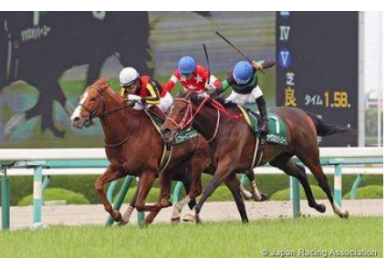
Perform a Promise (left) in the 2020 Naruo Kinen