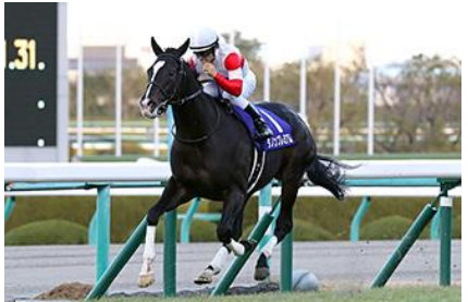
Danon Premium in the 2017 Asahi Hai Futurity Stakes