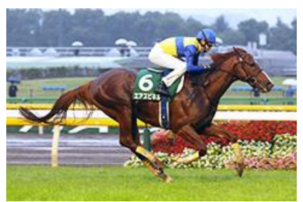
Air Spinel in the 2017 Fuji Stakes