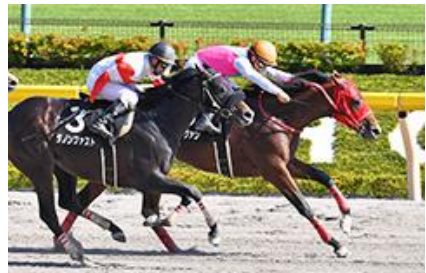
Dieu du Vin in the 2020 Seiryu Stakes