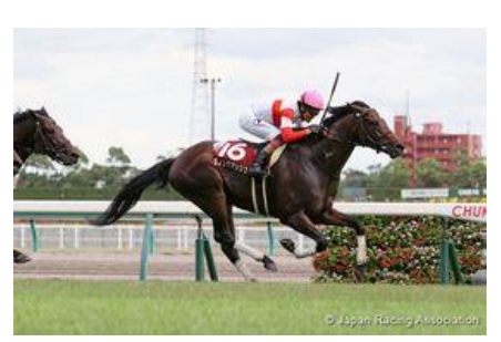
Danon Smash in the 2020 Centaur Stakes