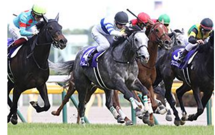
Normcore in the 2019 Victoria Mile

Admire Mars (JPN, C4, by Daiwa Major) aims to return for a repeat victory in the Hong Kong Mile (G1, 1,600m). In the Mile Championship (G1, 1,600m), he assumed command 200 meters out but eventually was out-finished to third by winner Gran Alegria (JPN, F4, by Deep Impact) and defending champion Indy Champ (JPN, H5, by Stay Gold), back a 3/4 length and a neck respectively.