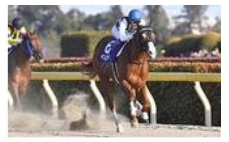
Inti in the 2019 February Stakes

The Musashino Stakes (G3, dirt, 1,600m) on November 14 was won by third favorite Sunrise Nova ( JPN, H6, by Gold Allure ), a stablemate of Chrysoberyl . The 2019 Mile Championship Nambu Hai victor, whose best score at the JRA-G1 level is a third in the February Stakes this year, will be making his second Champions Cup challenge after finishing sixth in 2018. Time Flyer (JPN, H5, by Heart's Cry) , who won on turf in the 2017 Hopeful Stakes (G1, 2,000m), entered the Musashino Stakes as the race favorite but finished fifth. Second favorite Mozu Ascot (USA, H6, by Frankel) , who won this year's February Stakes victor, disappointed to seventh.