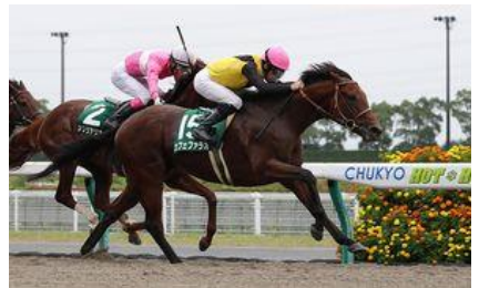
Cafe Pharoah in the 2020 Sirius Stakes

Cafe Pharoah (USA, C3, by American Pharoah) will face Chrysoberyl for the first time as a potential threat in this year's Champions Cup, having won four out of five starts, including the Unicorn Stakes (G3, dirt, 1,600m) and his latest start, the Sirius Stakes (G3, dirt, 1,900m). His only defeat came in the Japan Dirt Derby (dirt, 2,000m), where he struggled over a deep sand surface at NAR's Oi Racecourse.