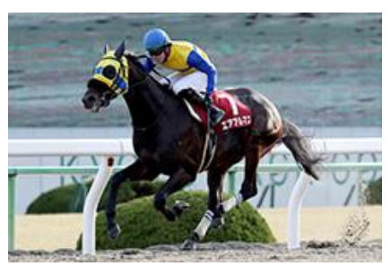
Air Almas in the 2020 Tokai Stakes