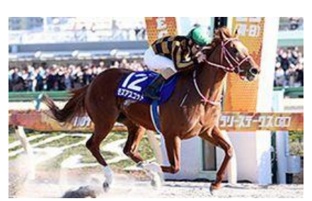
Mozu Ascot in the 2020 February Stakes

Cafe Pharoah (USA, C3, by American Pharoah) will face Chrysoberyl for the first time as a potential threat in this year's Champions Cup, having won four out of five starts, including the Unicorn Stakes (G3, dirt, 1,600m) and his latest start, the Sirius Stakes (G3, dirt, 1,900m). His only defeat came in the Japan Dirt Derby (dirt, 2,000m), where he struggled over a deep sand surface at NAR's Oi Racecourse.