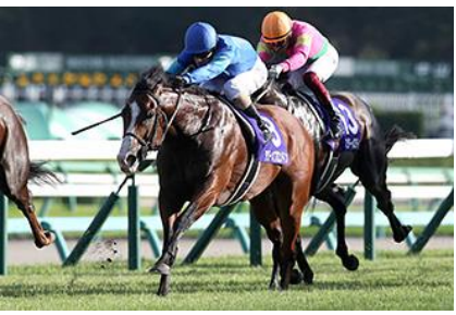
Tower of London in the 2019 Sprinters Stakes