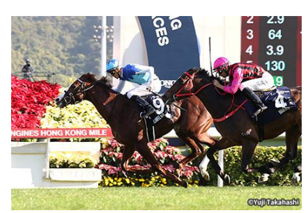
Admire Mars in the 2019 Hong Kong Mile

Tower of London (JPN, H5, by Raven's Pass), winner of the Sprinters Stakes (G1, 1,200m) last year, will contest the Hong Kong Sprint (G1, 1,200m), his first start in seven months. The son of Raven's Pass was unable to live up to expectations as race favorite in both the Takamatsunomiya Kinen (G1, 1,200m) and the Keio Hai Spring Cup (G2, 1,400m), finishing 12th and eighth respectively, both on soft going, and then was sidelined with a hoof problem that prevented him from starting in this year's Sprinters Stakes. Danon Smash (JPN, H5, by Lord Kanaloa) will make his second challenge in the Hong Kong Sprint after finishing eighth last year. In his last start, the Sprinters Stakes on October 4, he was unable to match winner Gran Alegria but bested the rest of the field for second.