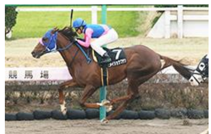
Meisho Wazashi in the 2020 Sobu Stakes