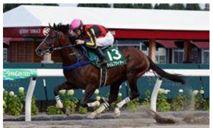
Time Flyer in the 2020 Elm Stakes