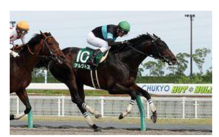
Arctos in the 2019 Procyon Stakes

Arctos (JPN, H5, by Admire Aura) scored his first title at the highest level in the Mile Championship Nambu Hai (dirt, 1,600m) on October 12. The son of Admire Aura (JPN, by Agnes Tachyon) has proved useful between 1,400 and 1,600 meters, but now he must negotiate the longer Champions Cup (1,800m), a distance at which he has finished no better than fifth in three starts. Gold Dream (JPN, H7, by Gold Allure) this year finished sixth behind Arctos in the Nambu Hai and has not exceeded this third place finish in the Heian Stakes (G3, dirt, 1,900m) in May, but the 2017 Best Dirt Horse is not to be underestimated in the upcoming dirt G1. In 2017, after coming off three dull efforts, the son of Gold Allure was a lightly regarded eighth favorite in the Champions Cup but he pinned the race favorite with a memorable close for the title. He gave another impressive performance in last year's Champions Cup, missing by just a neck to Chrysoberyl despite carrying two more kilos. Inti (JPN, H6, by Came Home), who lost a shoe and finished ninth in the Nambu Hai, was third in last year's Champions Cup but has not marked a win since the 2019 February Stakes (G1, 1,600m). Success in this year's Champions Cup will likely depend on Inti gaining the front and controlling the pace, his preferred style.