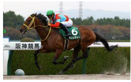
Clincher in the 2020 Miyako Stakes

Also facing Chrysoberyl for the first time will be Clincher (JPN, H6, by Deep Sky) , who shifted to dirt this year and has registered 1-4-1 and a fourth out of seven starts. The runner-up in the 2017 Kikuka Sho (Japanese St. Leger, G1, 3,000m) and a G2 winner in the 2018 Kyoto Kinen (G2, 2,200m) on turf, he won his first dirt grade title in the Miyako Stakes (G3, dirt, 1,800m) on November 8. The son of Deep Sky (JPN, by Agnes Tachyon)