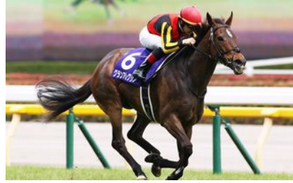
Gran Alegria in the 2021 Victoria Mile