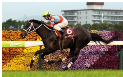
Deep Bond in the 2021 Hanshin Daishoten