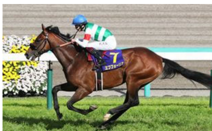
Efforia in the 2021 Satsuki Sho