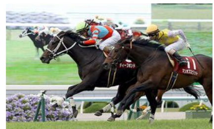
Deep Bond in the 2020 Kyoto Shimbun Hai