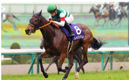
Lei Papale in the 2021 Osaka Hai

Lei Papale (JPN, F4, by Deep Impact) , after claiming her first three career starts, missed her chance to run in the last leg of the fillies' Triple Crown, the Shuka Sho (G1, 2,000m), due to an unlucky pick in a lottery. But then she marked back-to-back wins, including her first graded victory in the Challenge Cup (G3, 2,000m) last December. Her first G1 attempt produced a remarkable four-length victory in the Osaka Hai, where she was