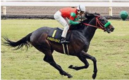
Meiner Virtus in the 2021 Fukushima Mimpo Hai

Meiner Virtus (JPN, H5, by Screen Hero) impressively overcame soft going to land an emphatic 11-length victory in the Fukushima Mimpo Hai (Listed, 2,000m). Three months later, the five-year-old made his first grade-race appearance in the Hakodate Kinen (G3, 2,000m) but lacked the needed kick in the stretch and was eighth.