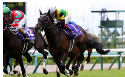
World Premier in the 2021 Tenno Sho (Spring)