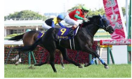
Uberleben in the 2021 Yushun Himba