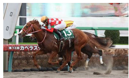
Justin in the 2020 Capella Stakes

Grenadier Guards (JPN, C3, by Frankel) , champion of last year's Asahi Hai Futurity Stakes (G1, 1,600m), will join Loves Only You in making a Breeders' Cup bid this autumn. The Frankel colt marked a runner-up effort in the Falcon Stakes (G3, 1,400m) at the beginning of this season and followed up with a 2-1/2-length third in the NHK Mile Cup (G1, 1,600m) in May. He is scheduled to run in the Keisei Hai Autumn Handicap (G3, 1,600m) on September 12 before heading to California for the Breeders' Cup Mile (G1, 1,600m) on November 6.