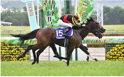
Schnell Meister in the 2021 NHK Mile Cup