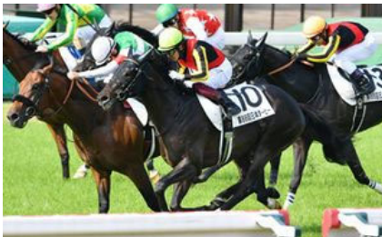
Shahryar in the 2021 Tokyo Yushun