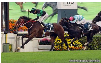
Loves Only You in the 2021 Queen Elizabeth II Cup

Loves Only You is scheduled to run in the Sapporo Kinen (G2, 2,000m) on August 22 prior to the Breeders' Cup Filly & Mare Turf (G1, 2,200m) on November 6 and then take a shot at the Hong Kong Cup (G1, 2,000m) on December 12. Her stablemate Justin (JPN, H5, by Orfevre) will accompany her for a possible bid in the Breeders' Cup Sprint (G1, dirt, 1,200m) and the Hong Kong Sprint (G1, 1,200m) as well.