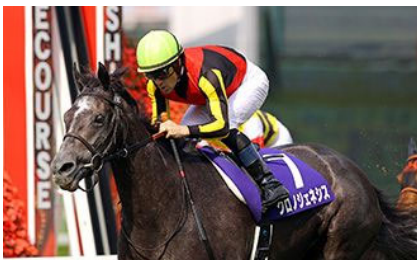
Chrono Genesis in the 2021 Takarazuka Kinen