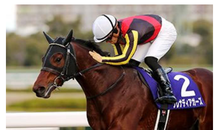
Grenadier Guards in the 2020 Asahi Hai Futurity Stakes

Grenadier Guards (JPN, C3, by Frankel) , champion of last year's Asahi Hai Futurity Stakes (G1, 1,600m), will join Loves Only You in making a Breeders' Cup bid this autumn. The Frankel colt marked a runner-up effort in the Falcon Stakes (G3, 1,400m) at the beginning of this season and followed up with a 2-1/2-length third in the NHK Mile Cup (G1, 1,600m) in May. He is scheduled to run in the Keisei Hai Autumn Handicap (G3, 1,600m) on September 12 before heading to California for the Breeders' Cup Mile (G1, 1,600m) on November 6.