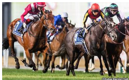
Chrono Genesis in the 2021 Dubai Sheema Classic