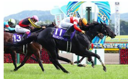
Danon Kingly in the 2021 Yasuda Kinen

Finally, the JRA has officially announced that it will newly establish an international race on the same weekend of the Japan Cup. In addition to the Capital Stakes (Listed, 1,600m) held the day before the Japan Cup, four allowance races (2-wins Class and 3-wins Class) for foreign-trained horses will be scheduled as undercard races. Two foreign contenders per race will be given berths, aiming to entice Japan Cup foreign invitees to bring their stablemates along.