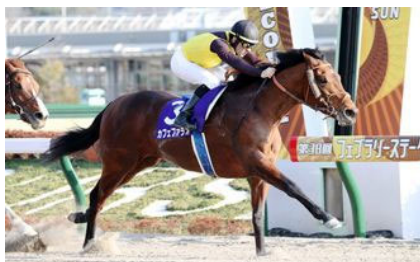
Cafe Pharoah in the 2021 February Stakes

likely run in the Shuka Sho (G1, 2,000m), the fillies' Triple Crown final leg in October