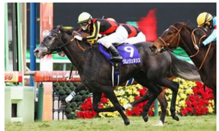
Chrono Genesis in the 2020 Arima Kinen

Stella Veloce (JPN, C3, by Bago) displayed the fastest stretch drive to land a good runner-up effort in last year's Asahi Hai Futurity Stakes (G1, 1,600m), which followed his first graded win in the Saudi Arabia Royal Cup (G3, 1,600m) a couple of months earlier. Sent off sixth and ninth favorite in the Satsuki Sho (Japanese 2000 Guineas, G1, 2,000m) and the Tokyo Yushun (Japanese Derby, G1, 2,400m), respectively, the Bago colt showed good turns of foot and closed well to finish third in both. Instead of heading for France, the colt will kick off his fall campaign in the Kobe Shimbun Hai (G2, 2,200m) on September 26 and then possibly the Kikuka Sho (Japanese St. Leger, G1, 3,000m) if he performs well.