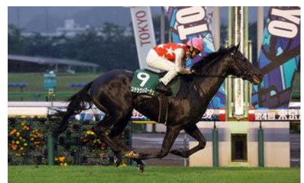
Stella Veloce in the 2020 Saudi Arabia Royal Cup

Stella Veloce (JPN, C3, by Bago) displayed the fastest stretch drive to land a good runner-up effort in last year's Asahi Hai Futurity Stakes (G1, 1,600m), which followed his first graded win in the Saudi Arabia Royal Cup (G3, 1,600m) a couple of months earlier. Sent off sixth and ninth favorite in the Satsuki Sho (Japanese 2000 Guineas, G1, 2,000m) and the Tokyo Yushun (Japanese Derby, G1, 2,400m), respectively, the Bago colt showed good turns of foot and closed well to finish third in both. Instead of heading for France, the colt will kick off his fall campaign in the Kobe Shimbun Hai (G2, 2,200m) on September 26 and then possibly the Kikuka Sho (Japanese St. Leger, G1, 3,000m) if he performs well.