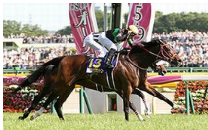
Loves Only You in the 2019 Yushun Himba