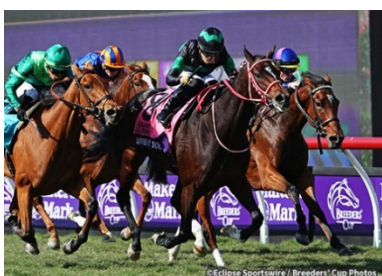
Loves Only You in the 2021 Breeders' Cup Filly and Mare Turf