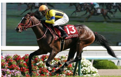
Stay Foolish in the 2018 Kyoto Shimbun Hai