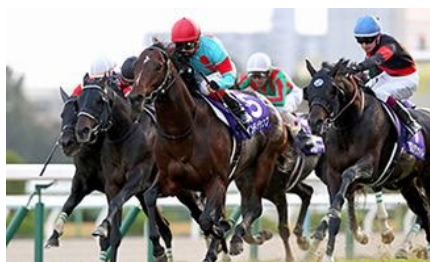
Indy Champ in the 2019 Mile Championship