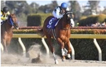
Inti in the 2019 February Stakes

This year's Champions Cup field will also include Sunrise Hope (JPN, C4, by Majestic Warrior) and Westerlund (JPN, H9, by Neo Universe) , the top two finishers in the Sirius Stakes (G3, dirt, 1,900m) on October 2; Inti (JPN, H7, by Came Home) , victor in the 2019 February Stakes who is coming off a fourth in the Mile Championship Nambu Hai (dirt, 1,600m); Sunrise Nova (JPN, H7, by Gold Allure) , runner-up in the JBC Sprint (dirt, 1,400m) on November 3; and Cafe Pharoah (USA, C4, by American Pharoah) , who won this year's February Stakes and is coming off a ninth in the Hakodate Kinen (G3, 2,000m), his first test on turf.