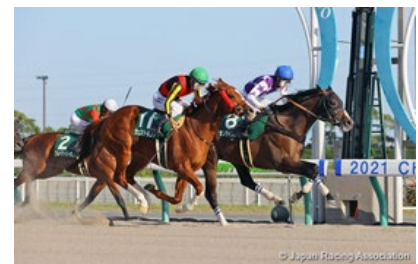
Sunrise Hope (right) in the 2021 Sirius Stakes