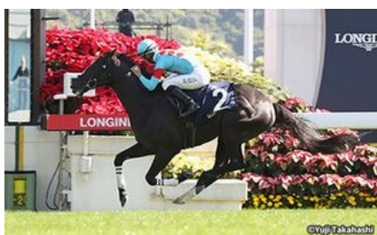
Glory Vase in the 2019 Hong Kong Vase