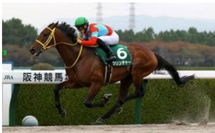
Clincher in the 2020 Miyako Stakes