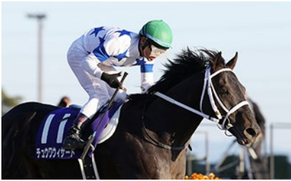
Chuwa Wizard in the 2020 Champions Cup