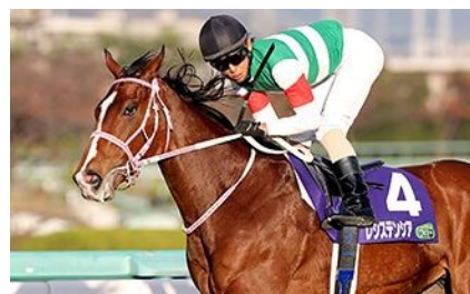
Resistencia in the 2019 Hanshin Juvenile Fillies

In the Hong Kong Vase (G1, 1,200m), two hoping to repeat a win by Glory Vase in 2019 include: