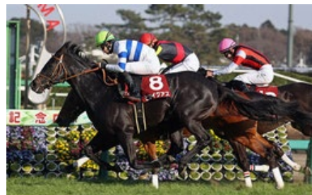
Hishi Iguazu in the 2021 Nakayama Kinen

Four horses are scheduled to race in the Hong Kong Mile (G1, 1,600m):