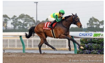
Auvergne in the 2021 Tokai Stakes

Air Spinel (JPN, H8, by King Kamehameha) , runner-up in this year's February Stakes (G1, dirt, 1,600m), finished second in the Musashino Stakes (G3, 1,600m), a Champions Cup step race held on November 13. Winner Soliste Thunder (JPN, H6, by Toby's Corner) kicked into gear in the straight while Air Spinel , who struggled to find room, eventually burst clear and gave chase to finish second by 1-1/4 lengths.