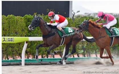
Suave Aramis in the 2021 Elm Stakes