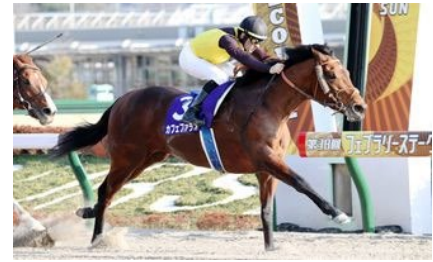
Cafe Pharoah in the 2021 February Stakes