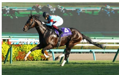
Pixie Knight in the 2021 Sprinters Stakes