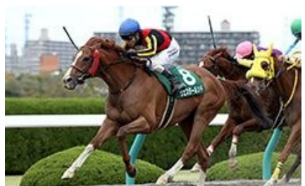
Westerlund in the 2020 Antares Stakes