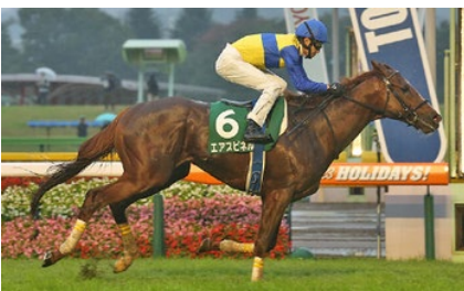
Air Spinel in the 2017 Fuji Stakes

Air Spinel (JPN, H8, by King Kamehameha) , runner-up in this year's February Stakes (G1, dirt, 1,600m), finished second in the Musashino Stakes (G3, 1,600m), a Champions Cup step race held on November 13. Winner Soliste Thunder (JPN, H6, by Toby's Corner) kicked into gear in the straight while Air Spinel , who struggled to find room, eventually burst clear and gave chase to finish second by 1-1/4 lengths.