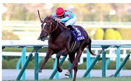
Salios in the 2019 Asahi Hai Futurity Stakes