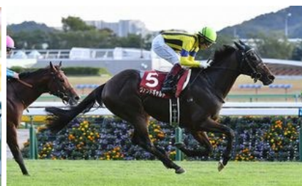
Vin de Garde in the 2020 Fuji Stakes