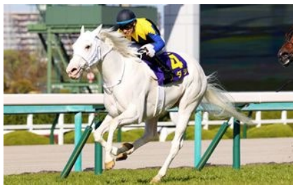
Sodashi in the 2021 Oka Sho

All of the above notwithstanding, the focus of the 2021 Champions Cup, JRA's largest dirt event this autumn, will be Sodashi (JPN, F3, by Kurofune) . After winning the Hanshin Juvenile Fillies (1,600m) in 2020, the filly went on to score a five-win streak culminating in a course-record triumph in the Oka Sho (Japanese 1000 Guineas, G1, 1,600m) to become JRA's first all-white horse to claim a G1 title. After an eighth-place finish in the