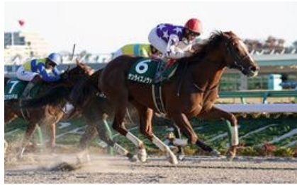
Sunrise Nova in the 2020 Musashino Stakes