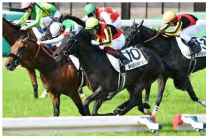
Shahryar in the 2021 Tokyo Yushun

up effort in last year's Dubai Turf. Panthalassa (JPN, H5, by Lord Kanaloa) claimed his second graded title in the Nakayama Kinen (G2, 1,800m) on February 27, which followed a triumph in the Fukushima Kinen (G3, 2,000m) last fall. The speedy son of Lord Kanaloa has made all in four of his five career victories and is expected to play a key role in the coming Dubai Turf.