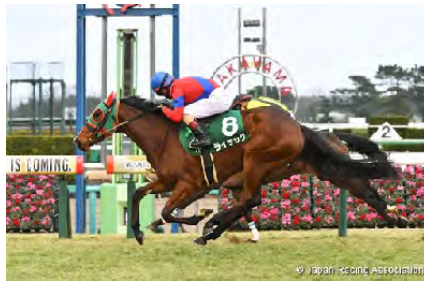
Lilac in the 2022 Fairy Stakes