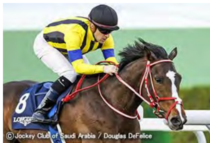
Stay Foolish in the 2022 Red Sea Turf Handicap