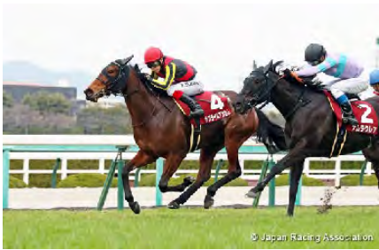
Sublime Anthem in the 2022 Fillies' Revue