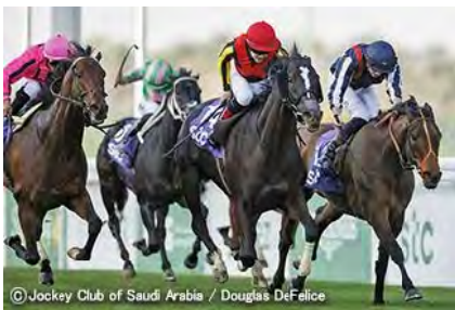
Songline in the 2022 1351 Turf Sprint

Stay Foolish (JPN, H7, by Stay Gold) came off a fifth-place finish in the Hong Kong Vase last December for another stint abroad in the Red Sea Turf Handicap (G3, 3,000m). The son of Stay Gold dominated from start to finish to win by an impressive 4-1/4 lengths, landing his first win in over three years since the 2018 Kyoto Shimbun Hai (G2, 2,200m). Dancing Prince (JPN, H6, by Pas de Trois) , who came off a G3 win in the Capella Stakes (G3, dirt, 1,200m) last December, won easily from wire-to-wire by 5-3/4-lengths to mark Japan's fourth victory in the Riyadh Dirt Sprint (G3, dirt, 1,200m). Chain of Love (JPN, M5, by Heart's Cry) , who switched from turf to dirt last December and quickly scored a win and a third before her Saudi challenge, finished third while Copano Kicking (USA, G7, by Spring At Last) , who was aiming for a repeat win in this race, disappointed to fourth. All four winners were ridden by Christophe Lemaire.