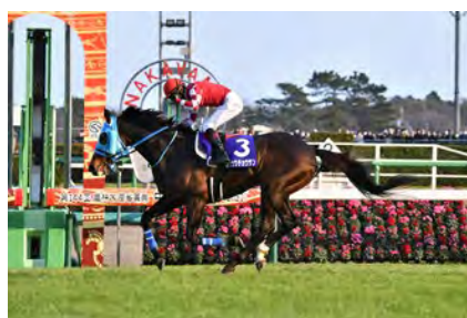
Oju Chosan in the 2021 Nakayama Daishogai

Undoubtedly, the highlight of steeplechase racing this spring will be the Nakayama Grand Jump (J-G1, 4,250m) on April 19, where renowned Oju Chosan (JPN, H11, by Stay Gold) , a four-time Best Steeplechase Horse, will attempt to claim his sixth title. The 2021 Nakayama Daishogai (J-G1, 4,100m) champion commenced this season with a third in the Hanshin Spring Jump (J-G2, 3,900m)