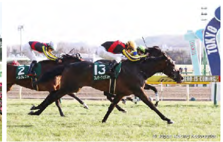
Presage Lift in the 2022 Queen Cup

Meanwhile, 2021 Asahi Hai Futurity Stakes (G1, 1,600m) winner and Best Two-Year-Old Colt Do Deuce (JPN, C3, by Heart's Cry) commenced his three-year-old season with a second in the Yayoi Sho Deep Impact Kinen (G2, 2,000m) on March 6, the main trial race towards the Satsuki Sho. The winner, Ask Victor More (JPN, C3, by Deep Impact) , also earned his ticket to the Satsuki Sho, as did third-place finisher Born This Way (JPN, C3, by Heart's Cry) . Kyoto Nisai Stakes (G3, 2,000m) winner Justin Rock (JPN, C3, by Leontes) was fourth, and Kisaragi Sho (G3, 2,000m) winner Matenro Leo (JPN, C3, by Heart's Cry) and Hopeful Stakes (G1, 2,000m) third-place finisher Lagulf (JPN, C3, by Maurice) finished a disappointing 10th and 11th, respectively.