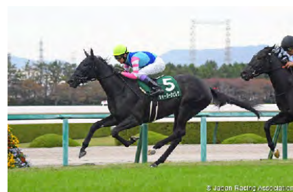
Water Navillera in the 2021 Fantasy Stakes

The first leg of the fillies' Triple Crown will also feature runners who performed well in two additional trials on March 13: winner Cross Majesty (JPN, F3, by Dee Majesty) and runner-up Raspberry Mousse (JPN, F3, by Rulership) in the Anemone Stakes (Listed, 1,600m), and Sublime Anthem (JPN, F3, by Lord Kanaloa) , Namura Clair (JPN, F3, by Mikki Isle) and Anegohada (JPN, F3, by Kizuna) , the top three finishers in that order in the Fillies' Revue (G2, 1,400m).