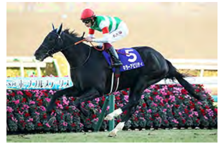
Killer Ability in the 2021 Hopeful Stakes

The first leg of the Triple Crown field also is likely to include Killer Ability (JPN, C3, by Deep Impact) , Equinox (JPN, C3, by Kitanasan Black) and Onyankopon (JPN, C3, by Eishin Flash) , who came off respective wins in the year-end Hopeful Stakes, last November's Tokyo Sports Hai Nisai Stakes (G2, 1,800m), and this January's Keisei Hai (G3, 2,000m). Two more Satsuki Sho possibilities are Danon Beluga (JPN, C3, by Heart's Cry) and Geoglyph (JPN, C3, by Drefong) , who were first and second, respectively, in the Kyodo News Hai (G3, 1,800m) in February.