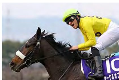
Circle of Life in the 2021 Hanshin Juvenile Fillies

Circle of Life (JPN, F3, by Epiphaneia) , winner of the 2021 Hanshin Juvenile Fillies (G1, 1,600m) and last year's Best Two-Year-Old Filly, kicked off her three-year-old season with a third in the Tulip Sho (G2, 1,600m) on March 5, the main trial race towards the Oka Sho. Also earning tickets to the Oka Sho were winner Namur (JPN, F3, by Harbinger) , who landed her first graded victory and previously was fourth in the Hanshin Juvenile Fillies, and runner-up Pin High (JPN, F3, by Mikki Isle) . In fifth was Water Navillera (JPN, F3, by Silver State) , who was third in the Hanshin Juvenile Fillies. The Hanshin Juvenile Fillies runner-up, Lovely Your Eyes (JPN, F3, by Logotype) , will head directly to the Oka Sho.