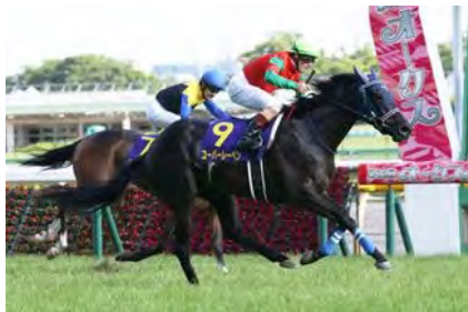
Uberleben in the 2021 Yushun Himba