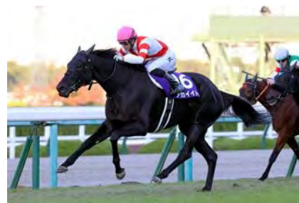
Akai Ito in the 2021 Queen Elizabeth II Cup

This year's Osaka Hai lineup will also include King of Koji (JPN, H6, by Lord Kanaloa ), African Gold (JPN, G7, by Stay Gold ) and Arrivo (JPN, C4, by Duramente ), respective victors of the