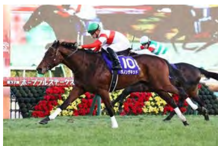
Danon the Kid in the 2020 Hopeful Stakes

Danon the Kid (JPN, C4, by Just a Way ), the 2020 Best Two-Year-Old Colt, turned in a promising 1-1/4-length third in last autumn's Mile Championship, but then he finished seventh after a poor break in his kick-off start of the season, the Nakayama Kinen. The son of Just a Way was expected to make a bid in the Dubai Turf and then run in the Osaka Hai afterwards but it was announced that the colt will start in the Milers Cup (G2, 1,600m) on April 24 instead.