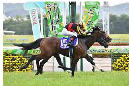
Schnell Meister in the 2021 NHK Mile Cup