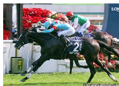
Glory Vase in the 2021 Hong Kong Vase

Twelve Japanese horses made their first overseas endeavors this year in the Saudi Cup meeting at King Abdulaziz Racetrack on February 26. Last year's Japan Cup (G1, 2,400m) runner-up Authority (JPN, H5, by Orfevre) won his fourth grade-race title with a wire-to-wire 1-1/4-length victory in the Neom Turf Cup (G3, 2,100m). Songline (JPN, F4, by Kizuna) , who claimed her first grade-race title in the 2021 Fuji Stakes (G2, 1,600m), won the 1351