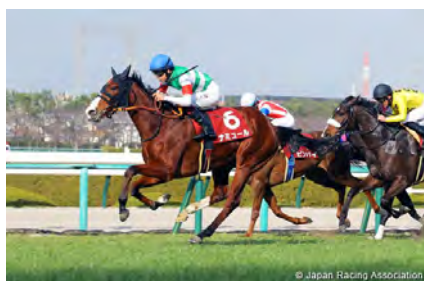
Namur in the 2022 Tulip Sho