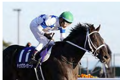
Chuwa Wizard in the 2020 Champions Cup

Those traveling from Saudi Arabia for the Dubai World Cup Day will be joined by 16 other runners from Japan. Chuwa Wizard (JPN, H7, by King Kamehameha) will return for another challenge in the Dubai World Cup (G1, dirt, 2,000m) after finishing second last year. The son of King Kamehameha was well beaten to third, 6-3/4 lengths behind winner T O Keyne , in the Champions Cup in December, but he regained his form and started this season with an overwhelming 4-length victory in the Kawasaki Kinen (dirt, 2,100m) on February 2 before departing for Dubai.