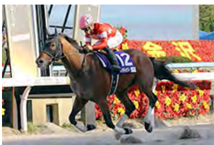
Red le Zele in the 2021 JBC Sprint

The Dubai Golden Shaheen will feature Red le Zele (JPN, H6, by Lord Kanaloa) , second last year, along with Chain of Love . The son of Lord Kanaloa scored a victory in the JBC Sprint (dirt, 1,400m) last November and went to post as race favorite in the February Stakes (G1, dirt, 1,600m), but the track condition and race development favored the front runners, so he was unable to threaten from racing mid-field and finished sixth.