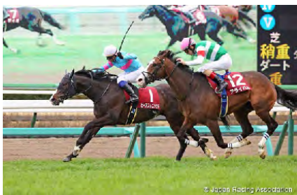
Be Astonished in the 2022 Spring Stakes

Those who earned Satsuki Sho berths in other trial races included Desierto (JPN, C3, by Drefong) and Verona City (JPN, C3, by Epiphaneia) , who were first and second, respectively, in the Wakaba Stakes (Listed, 2,000m) on March 19, and Be Astonished (JPN, C3, by American Patriot) , Arrival (JPN, C3, by Harbinger) and Satono Helios (JPN, C3, by Epiphaneia) , the top three finishers in that order in the Spring Stakes (G2, 1,800m) on March 20. Arrival , however, is likely to pass up this first leg of the classics as his connections have always given the colt sufficient time between the races to recover his legs.