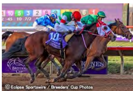
Marche Lorraine in the 2021 Breeders' Cup Distaff