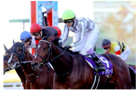
Do Deuce in the 2021 Asahi Hai Futurity Stakes

Meanwhile, 2021 Asahi Hai Futurity Stakes (G1, 1,600m) winner and Best Two-Year-Old Colt Do Deuce (JPN, C3, by Heart's Cry) commenced his three-year-old season with a second in the Yayoi Sho Deep Impact Kinen (G2, 2,000m) on March 6, the main trial race towards the Satsuki Sho. The winner, Ask Victor More (JPN, C3, by Deep Impact) , also earned his ticket to the Satsuki Sho, as did third-place finisher Born This Way (JPN, C3, by Heart's Cry) . Kyoto Nisai Stakes (G3, 2,000m) winner Justin Rock (JPN, C3, by Leontes) was fourth, and Kisaragi Sho (G3, 2,000m) winner Matenro Leo (JPN, C3, by Heart's Cry) and Hopeful Stakes (G1, 2,000m) third-place finisher Lagulf (JPN, C3, by Maurice) finished a disappointing 10th and 11th, respectively.