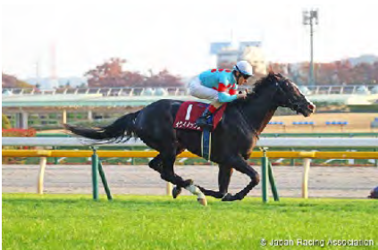
Equinox in the 2021 Tokyo Sports Hai Nisai Stakes