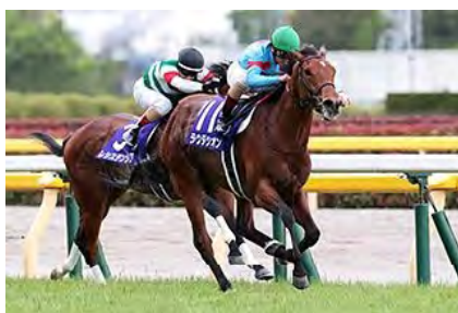
Lauda Sion in the 2020 NHK Mile Cup

Other races held that day included the Saudi Derby (G3, dirt, 1,600m). Attempting to give Japan its third consecutive title were both Sekifu (JPN, C3, by Henny Hughes) , the Hyogo Junior Grand Prix (dirt, 1,400m) winner, and Consigliere (JPN, C3, by Drefong) , who was coming off two wins in as many starts on dirt, but they finished second and third, respectively. Separately, in the Saudi Cup (G1, dirt, 1,800m), Marche Lorraine finished the final start of her career in sixth while T O Keynes (JPN, H5, by Sinister Minister) , winner of the 2021 Champions Cup (G1, dirt, 1,800m) and last year's Best Dirt Horse, finished eighth.