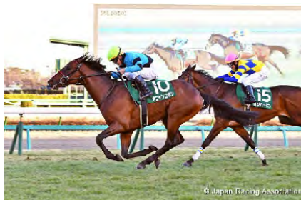
Onyankopon in the 2022 Keisei Hai