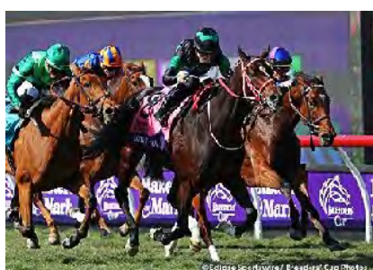
Loves Only You in the 2021 Breeders' Cup Filly & Mare Turf

While the five overseas G1 triumphs by Japanese horses in 2021 fell short of the eight-win mark achieved in 2019, history-making achievements were recorded nonetheless. Loves Only You (JPN, M6, by Deep Impact; retired) became the first Japanese horse to win three G1 titles abroad in the same year: the Queen Elizabeth II Cup (2,000m), the Hong Kong Cup (2,000m) and the Breeders' Cup Filly & Mare Turf (2,200m), the last of which was also the first Breeders' Cup title ever won by a Japanese horse. What's more, Marche Lorraine (JPN, M6, by Orfevre) followed with a second title for Japan just two hours later, taking home the Breeders' Cup Distaff (dirt, 1,800m) as the first Japanese horse to win a G1 dirt race in the United States. Besides these notable feats, Glory Vase (JPN, H7, by Deep Impact) contributed with his second Hong Kong Vase (2,400m) victory after 2019, rounding out Japan's five G1 victories for the year.