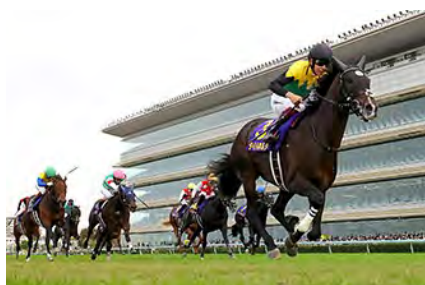
Titleholder in the 2021 Kikuka Sho

T O Royal (JPN, C4, by Leontes) , who claimed his fourth consecutive win in the G3 Diamond Stakes in mid-February, will also appear in this year's Tenno Sho (Spring) after making his first G1 bid in the Osaka Hai. The starters in the Nikkei Sho (G2, 2,500m) on March 26 may include possible Tenno Sho (Spring) candidates such as 2021 Kikuka Sho champion Titleholder (JPN, C4, by Duramente) , and 2021 Stayers Stakes (G2 3,600m) victor