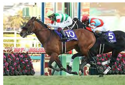
Efforia in the 2021 Arima Kinen

With leading horses such as Contrail and Chrono Genesis (JPN, M6, by Bago) having retired from racing as of the end of the previous season, 2021 Horse of the Year Efforia (JPN, C4, by Epiphaneia ) will be the focus of this year's middle-distance spring campaign for four-year-olds and up. The colt displayed a powerful three-length win in the first leg of the Triple Crown, the Satsuki Sho (Japanese 2000 Guineas, G1, 2,000m). Although beaten by a nose in the following Tokyo Yushun, he turned in a marvelous autumn campaign by prevailing over older rivals in both the Tenno Sho (Autumn) (G1, 2,000m) and the year-end Arima Kinen (G1, 2,500m). He will spend his spring campaign in Japan, starting off with the Osaka Hai (G1, 2,000m) on April 3 before he is likely committed to the Takarazuka Kinen (G1, 2,200m) on June 26.