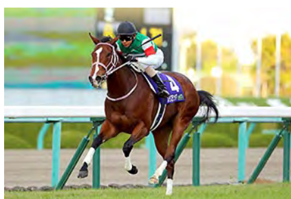
Resistencia in the 2019 Hanshin Juvenile Fillies