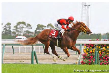
Jack d'Or in the 2022 Kinko Sho