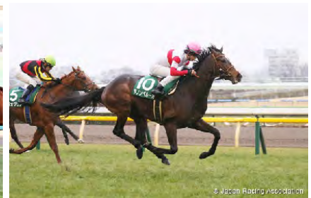
Danon Beluga in the 2022 Kyodo News Hai

The NHK Mile Cup on May 8 will include runners from two trial races—the New Zealand Trophy (G2, 1,600m) on April 9 and the Arlington Cup (G3, 1,600m) a week later—as well as Oka Sho and Satsuki Sho runners who prefer the mile distance instead of stepping up to the 2,400-meter Yushun Himba and Tokyo Yushun.