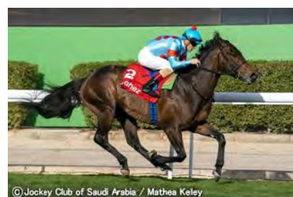
Authority in the 2022 Neom Turf Cup

Twelve Japanese horses made their first overseas endeavors this year in the Saudi Cup meeting at King Abdulaziz Racetrack on February 26. Last year's Japan Cup (G1, 2,400m) runner-up Authority (JPN, H5, by Orfevre) won his fourth grade-race title with a wire-to-wire 1-1/4-length victory in the Neom Turf Cup (G3, 2,100m). Songline (JPN, F4, by Kizuna) , who claimed her first grade-race title in the 2021 Fuji Stakes (G2, 1,600m), won the 1351