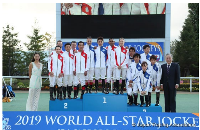
2019 World All-Star Jockeys (closing ceremony)