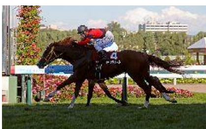
Jack d'Or, winner of 2022 Sapporo Kinen

Other prominent runners who are pointed towards the Tenno Sho (Autumn) and/or the Japan Cup include three runners from the Sapporo Kinen: winner Jack d'Or (JPN, C4, by Maurice) , who claimed his second graded title in the race and hopes to register his first G1 win in the Tenno Sho (Autumn); runner-up Panthalassa , who passed up the Arc to aim for a second G1 title in the Tenno Sho (Autumn) following his Dubai Turf (1,800m) victory this spring; and sixth-place finisher and two-time Hong Kong Vase (G1,