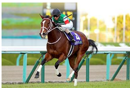
Resistencia, winner of 2019 Hanshin Juvenile Fillies