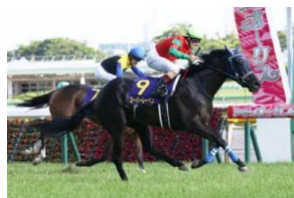
Uberleben, winner of 2021 Yushun Himba

2021 Japan Cup finishers such as Sanrei Pocket (JPN, H7, by Jungle Pocket) (4th) and Uberleben (JPN, F4, by Gold Ship) (6th) have struggled to maintain their form. Sanrei Pocket has made five grade-race starts so far this year and a third has been his best outcome. 2021 Yushun Himba (Japanese Oaks, G1, 2,400m) winner Uberleben showed a good fifth-place effort in the Dubai Sheema Classic but still has not regained her strength; she never was a factor in her first start back on home soil, the Sapporo Kinen (G2, 2,000m) on August 21, finishing 11th. She will head for another Japan Cup endeavor this year following a bid in the Tenno Sho (Autumn) on October 30.