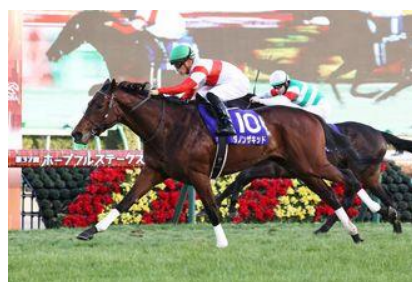
Danon the Kid, winner of 2020 Hopeful Stakes

Meanwhile, this year's Yasuda Kinen champion Songline (JPN, F4, by Kizuna) , who finished fifth in her first start at 1,200 meters in the Centaur Stakes this fall, will head to the Breeders' Cup Mile (G1, 1,600m) on November 5, her second overseas endeavor after winning the 1351 Turf Sprint (G3) in Saudi Arabia. 2020 Asahi Hai Futurity Stakes victor Grenadier Guards (JPN, C4, by Frankel) , although unsuccessful in the Royal Ascot's Platinum Jubilee Stakes (G1, 1,200m) this spring, finishing a disappointing 19th, will go overseas for the Hong Kong Mile (G1, 1,600m) on December