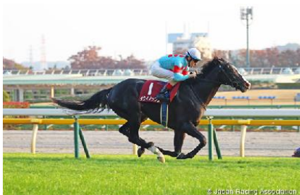
Equinox, winner of 2021 Tokyo Sports Hai Nisai Stakes

The other trial race, the Rose Stakes (G2, 2,000m) on September 18, saw race favorite Art House (JPN, F3, by Screen Hero) capture her first graded victory, with Saliera (JPN, F3, by Deep Impact) half a length behind in second and Eglantyne (JPN, F3, by Kizuna) another neck behind in third.