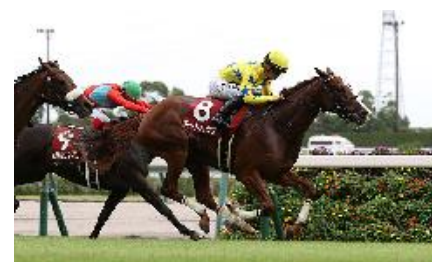
Art House, winner of 2022 Rose Stakes