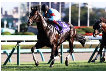
Pixie Knight, winner of 2021 Sprinters Stakes

The opening G1 event of the 2022 JRA fall season, the Sprinters Stakes (1,200m), will be held on October 2 without defending champion Pixie Knight (JPN, C4, by Maurice) , who is still recovering from a fractured knee in his left foreleg, which he sustained in a tragic accident involving four horses in last year's Hong Kong Sprint (G1, 1,200m). He is hoped to resume racing next year. Resistencia (JPN, M5, by Daiwa Major) , runner-up in the Sprinters Stakes last year, will also miss the race this year due to a fractured first phalanx in her left foreleg, discovered after her 11th-place finish in June in the Yasuda Kinen (G1, 1,600m) and taking her out of racing until November at the earliest.