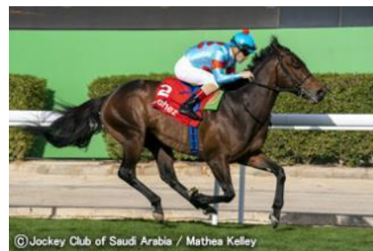
Authority, winner of 2022 Neom Turf Cup

Authority , runner-up in last year's Japan Cup, completed a stint in the Middle East earlier this year. He held off all competition in claiming Saudi Arabia's Neom Turf Cup (G3, 2,100m) in February and then nabbed a third in the Dubai Sheema Classic (G1, 2,410m) the next month. The son of Orfevre was supposed to make his first run on Japanese turf this season in the Takarazuka Kinen but was scratched at the last minute, diagnosed with a fracture in his right foreleg later on.