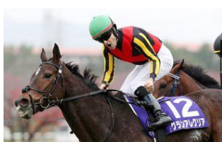
Gran Alegria, winner of 2021 Mile Championship