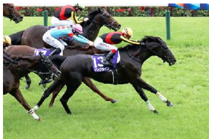
Songline, winner of 2022 Yasuda Kinen