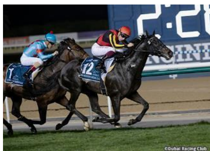
Shahryar, winner of 2022 Dubai Sheema Classic