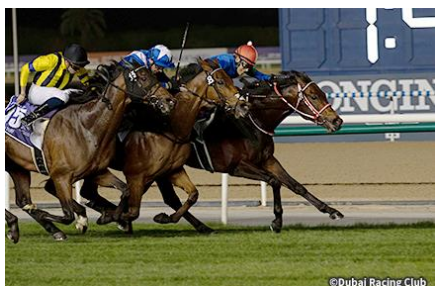
Panthalassa (right), winner of 2022 Dubai Turf

2,400m) victor Glory Vase (JPN, H7, by Deep Impact) , who will likely target either the Japan Cup or the Hong Kong Vase on December 11. This year's Osaka Hai victor Potager (JPN, H5, by Deep Impact) will proceed to the Tenno Sho (Autumn) after his first autumn start, the Mainichi Okan (G2, 1,800m) on October 9.