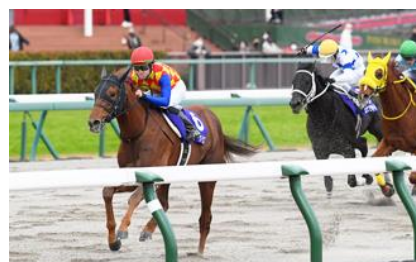
T O Keynes, winner of 2021 Champions Cup

2021 Best Dirt Horse and Champions Cup victor T O Keynes (JPN, H5, by Sinister Minister) began his 2022 campaign abroad in the Saudi Cup (G1, dirt, 1,800m) in February but was defeated to eighth. The son of Sinister Minister bounced back upon returning to Japan to win the Heian Stakes (G3, dirt, 1,900m, May) but was unable to defend his Teio Sho (dirt, 2,000m, June 29) title, finishing fourth. He is expected to make his comeback in either the JBC Classic (dirt, 2,000m) on November 3 or the Champions Cup on December 4.