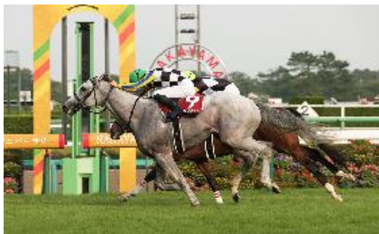
Gaia Force, winner of 2022 St. Lite Kinen

This year's Kikuka Sho field will also include Feengrotten (JPN, C3, by Black Tide) , who won the Radio Nikkei Sho (G3, 1,800m) in July and then finished third in his first attempt against older foes, the Niigata Kinen (G3, 2,000m), on September 4.