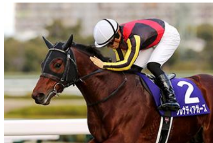
Grenadier Guards, winner of 2020 Asahi Hai Futurity Stakes

2021 Best Dirt Horse and Champions Cup victor T O Keynes (JPN, H5, by Sinister Minister) began his 2022 campaign abroad in the Saudi Cup (G1, dirt, 1,800m) in February but was defeated to eighth. The son of Sinister Minister bounced back upon returning to Japan to win the Heian Stakes (G3, dirt, 1,900m, May) but was unable to defend his Teio Sho (dirt, 2,000m, June 29) title, finishing fourth. He is expected to make his comeback in either the JBC Classic (dirt, 2,000m) on November 3 or the Champions Cup on December 4.