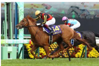
Geoglyph, winner of 2022 Satsuki Sho