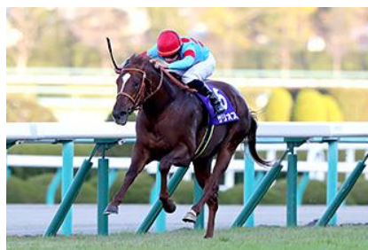
Salios, winner of 2019 Asahi Hai Futurity Stakes