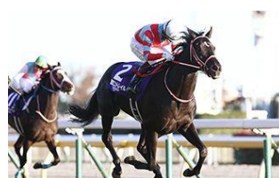
Contrail, winner of 2021 Japan Cup