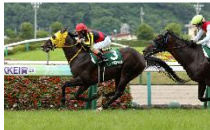
Feengrotten, winner of 2022 Radio Nikkei Sho