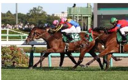
Stunning Rose, winner of 2022 Shion Stakes

Two trial races were held towards the Shuka Sho. One, the Shion Stakes (G3, 2,000m) on September 10, was claimed by Yushun Himba runner-up Stunning Rose (JPN, F3, by King Kamehameha) , who captured her second graded victory following the Flower Cup (G3, 1,800m) in March. Runner-up Sound Vivace (JPN, F3, by Duramente) and Fairy Stakes (G3, 1,600m) victor Lilac (JPN, F3, by Orfevre) , who finished third, also earned berths in the Shuka Sho. 2021 Best Two-Year-Old Filly Circle of Life (JPN, F3, by Epiphaneia) , who finished fourth, was diagnosed with a tendon injury in her right foreleg after the race and is expected to be sidelined for more than nine months.