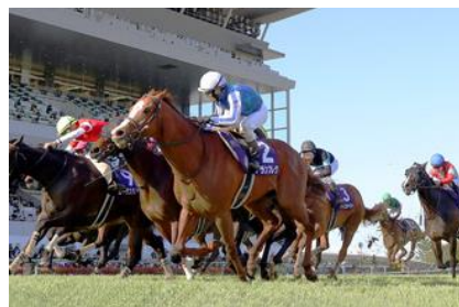
Naran Huleg, winner of 2022 Takamatsunomiya Kinen

The fall sprint G1 is now focused on last year's NHK Mile Cup (1,600m) winner Schnell Meister (GER, C4, by Kingman) and this year's Takamatsunomiya Kinen (1,200m) champion Naran Huleg (JPN, H6, by Gold Allure) . Inaugural G1 title hopefuls will include Namura Clair (JPN, F3, by Mikki Isle) and Meikei Yell (JPN, F4, by Mikki Isle) , respective winners of the Hakodate Sprint Stakes (G3, 1,200m, June 12) and the Centaur Stakes (G2, 1,200m, September 11). Also in the field will be T M Spada (JPN, F3, by Red Spada) and Vento Voce (JPN, H5, by Turtle Bowl) , respective winners of the CBC Sho (G3, 1,200m, July 3) and the Keeneland Cup (G3, 1,200m, August 28).