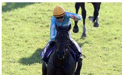
Daring Tact, winner of 2020 Shuka Sho

This year's Queen Elizabeth II Cup for three-year-old-and-up fillies/mares on November 13 will feature defending champion Akai Ito (JPN, M5, by Kizuna) , even though the Kizuna mare was winless in three starts in spring, including third in the G2 Kinko Sho (2,000m, March 13). She will follow the same schedule as last year, kicking off her fall campaign with the Fuchu Himba Stakes (G2, 1,800m) on October 15 before aiming for a