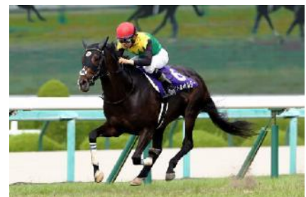
Titleholder, winner of 2022 Takarazuka Kinen

In the meantime, another four-year-old colt stole the spotlight. Titleholder (JPN, C4, by Duramente) scored a second in the Satsuki Sho (Japanese 2000 Guineas, G1, 2,000m), a sixth in the Tokyo Yushun last season, and then a dramatic gate-to-wire victory in the Kikuka Sho (Japanese St. Leger, G1, 3,000m) to capture his first G1 title by an incredible five-length margin.