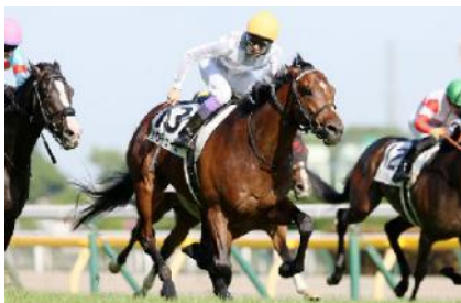
Do Deuce, winner of 2022 Tokyo Yushun

sweep. In November, she may appear in the Japan Cup, where fillies/mares have turned in solid performances to better their male opponents in recent years.