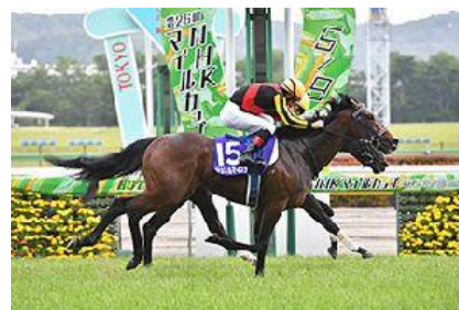
Schnell Meister, winner of 2021 NHK Mile Cup

The fall sprint G1 is now focused on last year's NHK Mile Cup (1,600m) winner Schnell Meister (GER, C4, by Kingman) and this year's Takamatsunomiya Kinen (1,200m) champion Naran Huleg (JPN, H6, by Gold Allure) . Inaugural G1 title hopefuls will include Namura Clair (JPN, F3, by Mikki Isle) and Meikei Yell (JPN, F4, by Mikki Isle) , respective winners of the Hakodate Sprint Stakes (G3, 1,200m, June 12) and the Centaur Stakes (G2, 1,200m, September 11). Also in the field will be T M Spada (JPN, F3, by Red Spada) and Vento Voce (JPN, H5, by Turtle Bowl) , respective winners of the CBC Sho (G3, 1,200m, July 3) and the Keeneland Cup (G3, 1,200m, August 28).