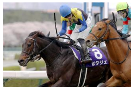
Potager, winner of 2022 Osaka Hai

Another candidate for the Japan Cup is T O Royal (JPN, C4, by Leontes) , whose first G1 test came in the Tenno Sho (Spring), where he finished third eight lengths behind Titleholder . The four-year-old colt had come off a Diamond Stakes (G3, 3,400m) victory in February, the last of a four-race winning streak. After looking strong before tiring at the last furlong and finishing fifth in the Sankei Sho All Comers (G2, 2,200m) on September 25, his main targets are now the Japan Cup and then the Arima Kinen on December 25.