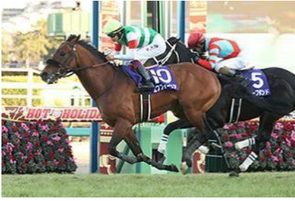
Efforia, winner of 2021 Arima Kinen

Key middle-distance runners, including those who did not run in the 2021 Japan Cup, have shifted in a major way this season. Efforia , after claiming the Tenno Sho (Autumn) and the Arima Kinen (The Grand Prix, G1, 2,500m) to be named 2021 Horse of the Year, struggled to live up to his reputation this past spring. Although heavily favored in the Osaka Hai, the colt's trademark burst of speed was nowhere to be seen and was beaten to ninth.