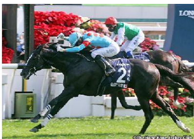
Glory Vase, winner of 2021 Hong Kong Vase