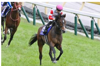
Danon Scorpion, winner of 2022 NHK Mile Cup

11 after commencing his fall campaign in the Swan Stakes (G2, 1,400m) on October 29.