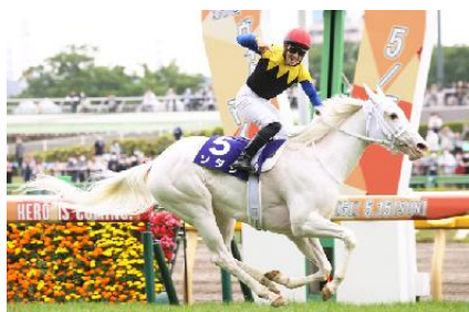
Sodashi, winner of 2022 Victoria Mile

The Mile Championship on November 20 will feature Sodashi (JPN, F4, by Kurofune) , the pure white filly who marked her third G1 title this spring in the Victoria Mile but was unable to defend her title most recently in the Sapporo Kinen, where she finished fifth. Sodashi will concentrate on racing over a mile and make the Fuchu Himba Stakes as her step race. Other Mile Championship hopefuls include 2019 Asahi Hai Futurity Stakes champion Salios (JPN, H5, by Heart's Cry) and 2020 Best Two-Year-Old Colt Danon the Kid (JPN, C4, by Just a Way) , both of whom first will head to the Mainichi Okan, while this year's NHK Mile Cup victor Danon Scorpion (JPN, C3, by Lord Kanaloa) has opted for the Fuji Stakes (G2, 1,600m) on October 22. Schnell Meister , who will start in the Sprinters Stakes, is also expected to join in the Mile Championship field.