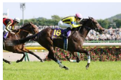
Stars on Earth, winner of 2022 Yushun Himba