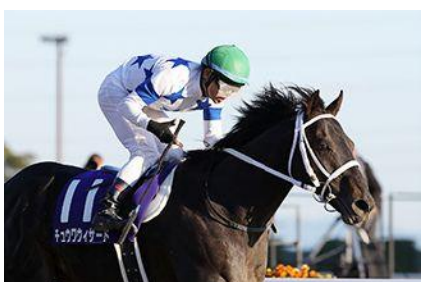
Chuwa Wizard, winner of 2020 Champions Cup

2020 Champions Cup champion Chuwa Wizard (JPN, H7, by King Kamehameha) was runner-up last year, but lost soundly by six lengths to winner T O Keynes . The son of King Kamehameha remains in good form at seven, winning the Kawasaki Kinen (dirt, 2,100m), finishing third in his second Dubai World Cup (G1, dirt, 2,000m) challenge and just missing by a neck in second in his latest start, the Teio Sho. Chuwa Wizard is expected to start in the JBC Classic prior to the Champions Cup.