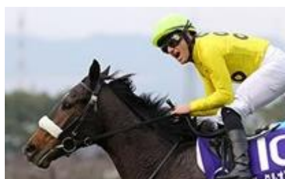
Circle of Life, winner of 2021 Hanshin Juvenile Fillies