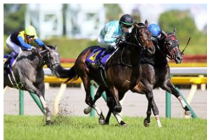
Daring Tact, winner of 2020 Yushun Himba