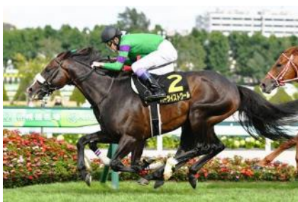
Heart's Histoire, winner of 2022 Sapporo Nikkei Open