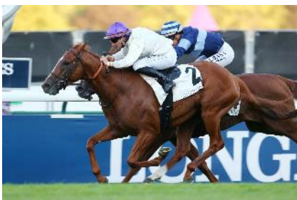
Onesto, winner of 2022 Grand Prix de Paris

Onesto (IRE, C3, by Frankel) won the Grand Prix de Paris (G1, 2,400m) in July but struggled on heavy turf in the Arc, finishing 10th. Another three-year-old colt, Simca Mille (IRE, C3, by Tamayuz) , who came off a group-race victory in the Prix du Lys (G3, 2,400m), missed by a neck in second to Onesto in the Grand Prix de Paris, and then added another victory in the Prix Niel (G2, 2,400m) before coming to Japan. Representing Germany will be Tunnes (GER, C3, by Guilian) , who was second in his two-year-old debut and now has a 5-race winning streak, including two G3 events and his first G1 victory in his latest start, the Grosser Preis von Bayern (G1, 2,400m).