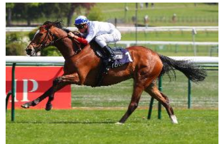
Grand Glory, winner of 2022 Prix Allez France

Three runners will come from France. Grand Glory (GB, M6, by Olympic Glory) , fifth in her first Japan Cup last year, kicked off this season with two wins, including in the Prix Allez France (G3, 2,000m), and was 4 1/4 lengths behind Alpinista (GB, M5, by Frankel) in fifth in her last start, the Prix de l'Arc de Triomphe.