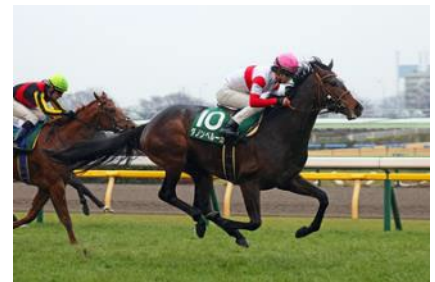
Danon Beluga, winner of 2022 Kyodo News Hai

Danon Beluga (JPN, C3, by Heart's Cry) , third in the Tenno Sho (Autumn), won the Kyodo News Hai (G3, 1,800m) in February before finishing fourth in both the Satsuki Sho (Japanese 2000 Guineas, G1, 2,000m) and the Tokyo Yushun (Japanese Derby, G1, 2,400m). In the Tenno Sho (Autumn), he closed in with the second fastest finishing speed to cross the wire 2-1/2 lengths in front of 2021 derby winner and 2022 Dubai Sheema Classic victor Shahryar . Although invited to run in the Hong Kong Cup, the three-year-old is expected to face older G1 foes in the Japan Cup.