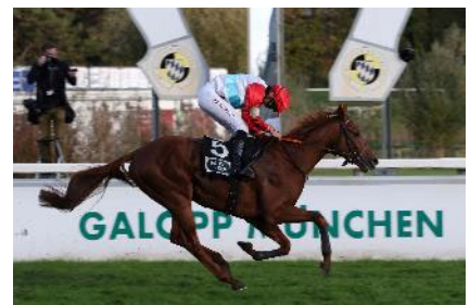
Tunnes, winner of 2022 Grosser Preis von Bayern