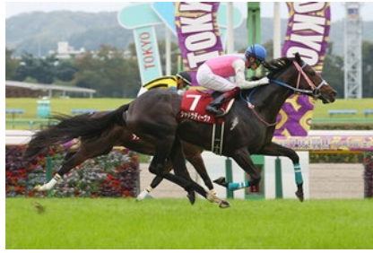
Shadow Diva, winner of 2021 Fuchu Himba Stakes