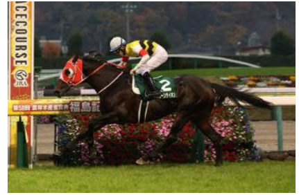
Unicorn Lion, winner of 2022 Fukushima Kinen