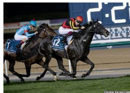
Shahryar, winner of 2022 Dubai Sheema Classic

Connections of Shahryar (JPN, C4, by Deep Impact ), who was fifth in the Tenno Sho, have announced their intention to enter the Deep Impact colt. Third behind Contrail (JPN, by Deep Impact) and Authority (JPN, by Orfevre) in last year's 1.5-mile Japan Cup, Shahryar kicked off the 2022 season with an overseas success in the Dubai Sheema Classic (G1, 2,410m), where the four-year-old made an early bid from a forward position and held off a furious chase by Yibir (GB, by Dubawi) by a neck.