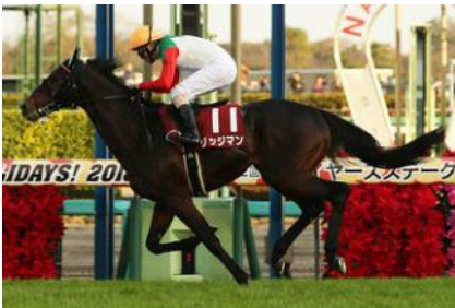
Ridge Man, winner of 2018 Stayers Stakes