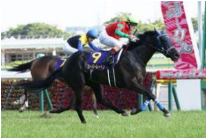
Uberleben, winner of 2021 Yushun Himba

Uberleben (JPN, F4, by Gold Ship) , eighth in the Tenno Sho (Autumn), is also slated to run in the Japan Cup. The winner of the 2021 Yushun Himba (Japanese Oaks, G1, 2,400m) ran in the Cup last year and finished sixth. The Gold Ship filly also entered the Dubai Sheema Classic and was fifth by 1-1/4 lengths to Shahryar . In her comeback start in August, the Sapporo Kinen (G2, 2,000m), weighing 36 kg more than when she won the Oaks, she was heavily beaten to 11th. However, she looked much more fit in her last start, the Tenno Sho (Autumn), and should benefit from the Japan Cup's extended distance.