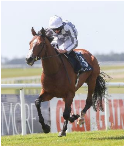
Broome, winner of 2021 Mooresbridge Stakes

This year's Japan Cup has attracted more foreign participants than in previous years, thanks to the winners' prize money being raised to 400 million yen and a new quarantine stable located conveniently within Tokyo Racecourse. From Ireland, Broome (IRE, H6, by Australia) will make his second Japan Cup challenge. The 2021 winner of the Grand Prix de Saint-Cloud (G1, 2,400m) added another group-race title to his resume this year with a victory in the Hardwicke Stakes (G2, 2,400m) in June. Another Irish raider, Magical Lagoon (IRE, F3, by Galileo), this year's winner of the Irish Oaks (G1, 2,400m), made an early entry into Japan to start in the Queen Elizabeth II Cup (G1, 2,200m) at Hanshin Racecourse on November 13. The Galileo filly struggled on a wet track after chasing the pace in second and then faded to last, based on which her connections decided to withdraw from the Japan Cup.