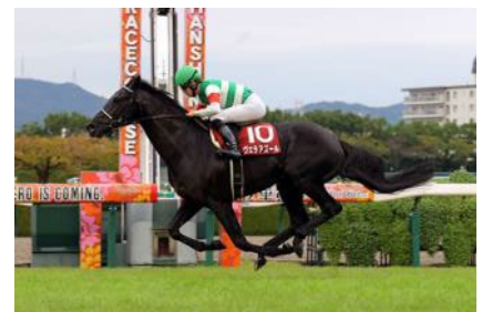
Vela Azul, winner of 2022 Kyoto Daishoten

The two top finishers of the Kyoto Daishoten (G2, 2,400m) on October 10 are also expected to be in the lineup. The winner, Vela Azul (JPN, H5, by Eishin Flash) , switched to turf in March—after 16 career starts on dirt since his three-year-old debut in 2020—and proved an immediate success with a come-from-behind victory in the Awaji Stakes (2 Wins Class, 2,600m). Two third-place finishes followed before another victory in the June Stakes (3 Wins Class) at Tokyo Racecourse, the Stakes being the