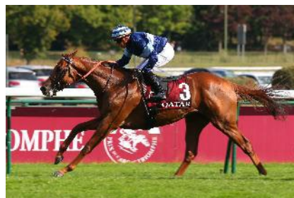
Simca Mille, winner of 2022 Prix Niel