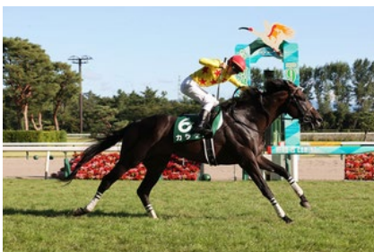
Karate, winner of 2022 Niigata Kinen

Tenno Sho (Autumn) six-place finisher Karate (JPN, H6, by To the Glory) raced mainly at middle distances until the spring of his four-year-old season, during which time he scored just one win. But since stepping down to a mile, the son of To the Glory has registered five wins, including a graded title in the 2021 Tokyo Shimbun Hai (G3). After finishing 16th in the Yasuda Kinen (G1, 1,600m) in June, he returned to middle distances and scored his second graded victory in the Niigata Kinen (G3, 2,000m), and then