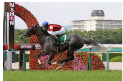
Win Mighty, winner of 2022 Mermaid Stakes