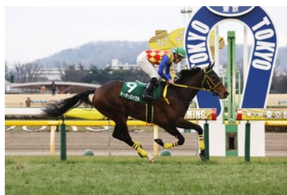
T O Royal, winner of 2022 Diamond Stakes