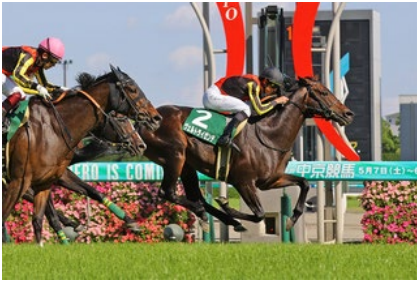
Weltreisende, winner of 2022 Naruo Kinen