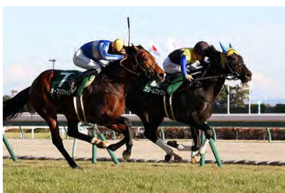
Hrimfaxi, winner of 2023 Kisaragi Sho