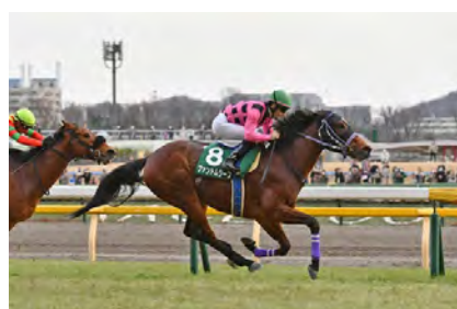
Phantom Thief, winner of 2023 Kyodo News Hai

The NHK Mile Cup will include runners from two trial races—the New Zealand Trophy (G2, 1,600m) on April 8, in which Dolce More will make his seasonal debut, and the Arlington Cup (G3, 1,600m) a week later—as well as Oka Sho and Satsuki Sho runners who prefer running a mile instead of stepping up to the 2,400-meter Yushun Himba or Tokyo Yushun. Tamamo Black Tie (JPN, C3, by Declaration of War) , who won the Falcon Stakes (G3, 1,400m) on March 18, will also head to the NHK Mile Cup.