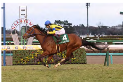
Sol Oriens, winner of 2023 Keisei Hai

( JPN, C3, by Harbinger ), respective winners of the Keisei Hai (G3, 2,000m) in January, the Kisaragi Sho (G3, 2,000m) in February and the Kyodo News Hai (G3, 1,800m) also in February.