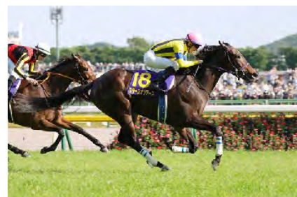
Stars on Earth, winner of 2022 Yushun Himba

The Osaka Hai will also include some of the Nakayama Kinen runners—winner Hishi Iguazu (JPN, H7, by Heart's Cry) who came off an eight-month break to capture his third graded victory, and runner-up Lagulf (JPN, C4, by Maurice) . Fifth in the Nakayama Kinen was Shuka Sho victor Stunning Rose (JPN, F4, by King Kamehameha) , who will pass up the Osaka Hai due to a minor health issue and head to the Victoria Mile (G1, 1,600m) on May 14. Prognosis (JPN, H5, by Deep Impact) , who captured his first graded title in the Kinko Sho (G2, 2,000m) on March 12, will also withdraw from the Osaka Hai and possibly head to Hong Kong's Queen Elizabeth II Cup (G1, 2,000m) on April 30. Last year's Osaka Hai champion Potager (JPN, H6, by Deep Impact) , who finished sixth in the Kinko Sho, is scheduled to run in the race again this year.