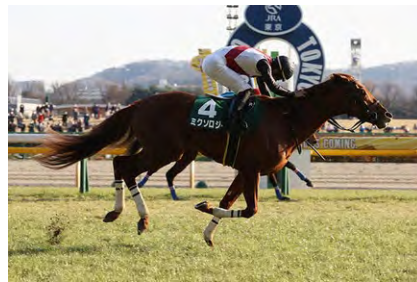
Mixology, winner of 2023 Diamond Stakes