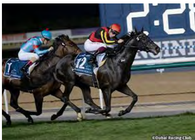
Shahryar, winner of 2022 Dubai Sheema Classic