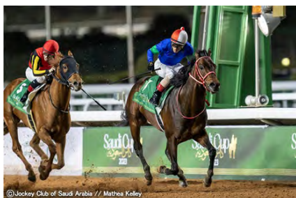
Panthalassa, winner of 2023 Saudi Cup

Another victory for Japan was earned by Silver Sonic (JPN, H7, by Orfevre) in the Red Sea Turf Handicap (G3, 3,000m). Last year's Stayers Stakes (G2, 3,600m) winner burst clear from a forward position in third to win by a comfortable 2-1/2 lengths. In seventh was fellow Japanese runner Echt (JPN, H6, by Rulership) , who won the 2022 Tanabata Sho (G3, 2,000m). Silver Sonic will not go to Dubai and will instead return to Japan to aim for his first G1 title in the Tenno Sho (Spring) (G1, 3,200m) on April 30.