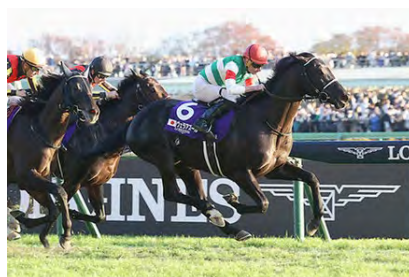
Vela Azul, winner of 2022 Japan Cup

Aiming for a consecutive Dubai Sheema Classic (G1, 2,410m) title is 2021 Tokyo Yushun (Japanese Derby, G1, 2,400m) victor Shahryar (JPN, H5, by Deep Impact) . The dark bay won his second G1 title when claiming the Dubai Sheema Classic last year and capped off the season with a runner-up effort in the Japan Cup. A record of 2-1-1 out of four starts going left-handed at 2,400m should be an advantage for the defending champion. Another strong candidate in the Dubai Sheema Classic is 2022 Horse of the Year Equinox (JPN, C4, by Kitasan Black) . Second in both spring classics for three-year-olds, the Satsuki Sho and the Tokyo Yushun, the colt dominated two prestigious G1 events against seniors in the Tenno Sho (Autumn) (G1, 2,000m) and the Arima Kinen last year. Lightly raced since his career debut in August of his two-year-old season—he has just six career starts—his true ability will be put to the test following a strenuous long-distance trip overseas which will be his first. Win Marilyn (JPN, M6, by Screen Hero) , who nearly claimed G1 titles in the 2020 Yushun Himba (Japanese Oaks, G1, 2,400m) and the Queen Elizabeth II Cup (G1, 2,200m) last year, followed with a victory in the Hong Kong Vase (G1, 2,400m) in December, coming up strongly from behind under Damian Lane to bag her first G1 title, which her connections hope she'll repeat with another strong performance in the Dubai Sheema Classic.