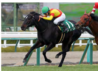
Aguri, winner of 2023 Hankyu Hai

This year's Takamatsunomiya Kinen field will also feature six-time graded victor Meikei Yell (JPN, M5, by Mikki Isle) , 2021 Sprinters Stakes champion Pixie Knight (JPN, H5, by Maurice) , and last year's Sprinters Stakes runner-up Win Marvel (JPN, C4, by I'll Have Another) . Others will include Lotus Land (USA, M6, by Point of Entry) and Kir Lord (JPN, G8, by Lord Kanaloa) , who finished second and third respectively in last year's edition of the race.