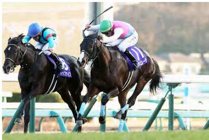
Dura Erede, winner of 2022 Hopeful Stakes

Another Japanese runner scheduled to start in Dubai include Win Carnelian (JPN, H6, by Screen Hero) , who is a two-time G3 winner over turf at a mile for the Godolphin Mile. Joining Derma Sotogake and Continuar in the UAE Derby will be Dura Erede (JPN, C3, by Duramente) , Goraiko (JPN, C3, by Hokko Tarumae) and Perriere (JPN, C3, by Henny Hughes) , respective winners of the Hopeful Stakes (G1, 2,000m), the JBC Nisai Yushun (Listed, dirt, 1,800m) and the Hyacinth Stakes (Listed, dirt, 1,600m).