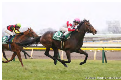
Danon Beluga, winner of 2022 Kyodo News Hai

Red le Zele (JPN, H7, by Lord Kanaloa) , second in both the 2021 and 2022 Dubai Golden Shaheen, will join Remake and Justin for his third challenge this year. He was second in the February Stakes after closing on the winner with the fastest late speed from second to last. February Stakes winner