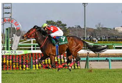
Vento Voce, winner of 2023 Ocean Stakes