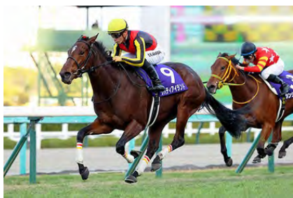
Liberty Island, winner of 2022 Hanshin Juvenile Fillies

Liberty Island (JPN, F3, by Duramente) , the Best Two-Year-Old Filly who won the championship race for two-year-old fillies—the 2022 Hanshin Juvenile Fillies (G1, 1,600m)—will head directly to the Oka Sho where she will likely be sent off well-backed as race favorite along with runner-up Shinryokuka (JPN, F3, by Satono Diamond) , who will also launch her three-year-old season in the first leg of the fillies' Triple Crown. Ravel (JPN, F3, by Kitan Black) , who had claimed the Artemis Stakes (G3, 1,600m) in October but finished a disappointing 11th behind these two in the two-year-old-filly championship, will also make her three-year-old season debut in the Oka Sho. Meanwhile, Hanshin Juvenile Fillies' third-place finisher Doe Eyes (JPN, F3, by Rulership) kicked off his current season with a neck second behind Harper (JPN, F3, by Heart's Cry) in the Queen Cup (G3, 1,600m) on February 11.