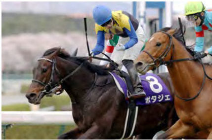
Potager, winner of 2022 Osaka Hai