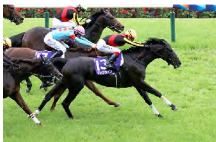
Songline, winner of 2022 Yasuda Kinen

In addition to defending champion Songline , this year's Yasuda Kinen on June 4 will probably include strong milers like Serifos , Danon the Kid , Sodashi and two NHK Mile Cup (G1, 1,600m) winners— Schnell Meister (GER, H5, by Kingman; 2021) and Danon Scorpion (JPN, C4, by Lord Kanaloa). Schnell Meister commenced the current season in the Nakayama Kinen, where he showed good effort despite meeting traffic at the top of the stretch for fourth, while two-time G3 winner Elusive Panther (JPN, H5, by Heart's Cry) finished eighth. Danon Scorpion will begin his four-year-old campaign with the Keio Hai Spring Cup (G2, 1,400m) on May 13, one of the prep races towards the Yasuda Kinen, while contenders from the Milers Cup (G2, 1,600m) on April 23, another Yasuda Kinen prep, will probably be among the Yasuda Kinen lineup.