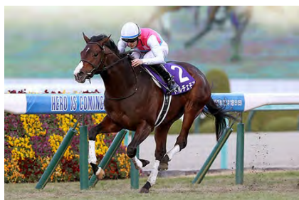
Dolce More, winner of 2022 Asahi Hai Futurity Stakes

Those who earned Satsuki Sho berths in other trial races included Shonan Bashitto (JPN, C3, by Silver State) and Ras Hammel (JPN, C3, by Silver State) , who were first and second respectively in the Wakaba Stakes (Listed, 2,000m) on March 18, and Bellagio Opera (JPN, C3, by Lord Kanaloa) , Ho O Biscuits (JPN, C3, by Mind Your Biscuits) and Metal Speed (JPN, C3, by Silver State) , the top three finishers in that order in the Spring Stakes (G2, 1,800m) the following day.