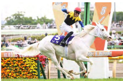
Sodashi, winner of 2022 Victoria Mile