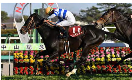
Hishi Iguazu, winner of 2023 Nakayama Kinen

The Osaka Hai will also include some of the Nakayama Kinen runners—winner Hishi Iguazu (JPN, H7, by Heart's Cry) who came off an eight-month break to capture his third graded victory, and runner-up Lagulf (JPN, C4, by Maurice) . Fifth in the Nakayama Kinen was Shuka Sho victor Stunning Rose (JPN, F4, by King Kamehameha) , who will pass up the Osaka Hai due to a minor health issue and head to the Victoria Mile (G1, 1,600m) on May 14. Prognosis (JPN, H5, by Deep Impact) , who captured his first graded title in the Kinko Sho (G2, 2,000m) on March 12, will also withdraw from the Osaka Hai and possibly head to Hong Kong's Queen Elizabeth II Cup (G1, 2,000m) on April 30. Last year's Osaka Hai champion Potager (JPN, H6, by Deep Impact) , who finished sixth in the Kinko Sho, is scheduled to run in the race again this year.