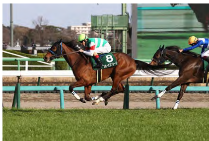
Through Seven Seas, winner of 2023 Nakayama Himba