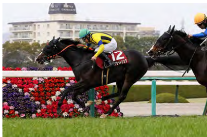
Sing That Song, winner of 2023 Fillies' Revue

Danon Ballade ), winner of last year's Niigata Nisai Stakes (G3, 1,600m) and the Fairy Stakes (G3, 1,600m) in January and seventh in the Tulip Sho. Dura (JPN, F3, by Duramente) , who won the Sapporo Nisai Stakes (G3, 1,800m) and was sixth in the Hanshin Juvenile Stakes, failed to deliver in the Tulip Sho, where she was a disappointing 15th.