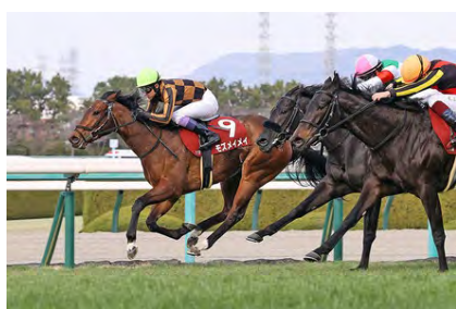
Mozu Meimei, winner of 2023 Tulip Sho

The first leg of the fillies' Triple Crown will also feature runners who performed well in one of three trials: Mozu Meimei (JPN, F3, by Real Impact) , Kona Coast (JPN, F3, by Kitan Black) and Perifania (JPN, F3, by Maurice) , the top three finishers in that order in the Tulip Sho (G2, 1,600m) on March 4; Tosen Laurier (JPN, F3, by Satono Crown) and Conch Shell (JPN, F3, by Kizuna) in the Anemone Stakes (Listed, 1,600m) on March 12; and Sing That Song (JPN, F3, by Duramente) , Moon Probe (JPN, F3, by Maurice) and June Orange (JPN, F3, by Just a Way) , who were the top three in the Fillies' Revue (G2, 1,400m) on the same day as the Anemone Stakes.