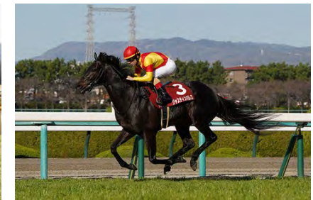
Justin Palace, winner of 2023 Hanshin Daishoten

The first flat-turf G1 event of the year, the Takamatsunomiya Kinen (1,200m), will be held at Chukyo Racecourse on March 26. Defending champion Naran Huleg (JPN, H7, by Gold Allure) kicked off this season in the Ocean Stakes (G3, 1,200m) on March 4 but finished a disappointing ninth, while Vento Voce (JPN, H6, by Turtle Bowl) won the race to claim his second graded title. Key runners from other prep races will include, from the Silk Road Stakes (G3, 1,200m) on January 29, winner Namura Clair (JPN, F4, by Mikki Isle) , who scored her third graded victory, and last year's Keihan Hai (G3, 1,200m) victor Toshin Macau (JPN, C4, by Big Arthur) , who finished three lengths behind in fourth, and from the Hankyu Hai (G3, 1,400m) on February 26, victor Aguri (JPN, C4, by