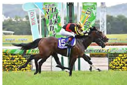
Schnell Meister, winner of 2021 NHK Mile Cup