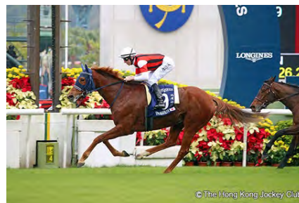
Win Marilyn, winner of 2022 Hong Kong Vase