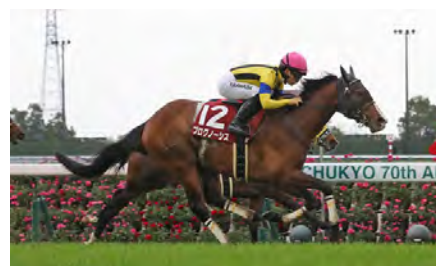
Prognosis, winner of 2023 Kinko Sho

The lineup additionally will include the aforementioned Danon the Kid , as well as Weltreisende (JPN, H6, by Dream Journey) and North Bridge (JPN, H5, by Maurice) , respective winners of the Nikkei Shinshun Hai (G2, 2,200m) and the American Jockey Club Cup (G2, 2,200m) in January. Others will include two-time G2 winner Jack d'Or (JPN, H5, by Maurice) and 2021 Hopeful Stakes champion Killer Ability (JPN, C4, by Deep Impact) .