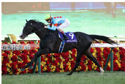
Equinox, winner of 2022 Arima Kinen