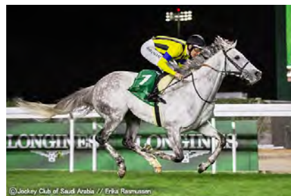
Silver Sonic, winner of 2023 Red Sea Turf Handicap

Derma Sotogake (JPN, C3, by Mind Your Biscuits) , winner of the 2022 Zen-Nippon Nisai Yushun (Listed, dirt, 1,600m), finished third, which was best among four Japanese runners in the Saudi Derby (G3, dirt, 1,600m). The other three, Continuar (JPN, C3, by Drefong) , From Dusk (USA, C3, by Bolt d'Oro) and Ecoro Ares (USA, C3, by Unified) , finished fifth, ninth and twelfth, respectively.