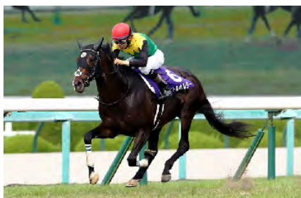
Titleholder, winner of 2022 Takarazuka Kinen

Mare Geraldina (JPN, M5, by Maurice) and Best Three-Year-Old Filly Stars on Earth (JPN, F4, by Duramente) . The former, whose dam Gentildonna is a two-time Horse of the Year winner, claimed her first G1 title in the Queen Elizabeth II Cup in November last year and then made a good stretch run despite a poor break for third in the following Arima Kinen. Stars on Earth collected two of the fillies' Triple Crown—the Oka Sho (Japanese 1000 Guineas, G1, 1,600m) and the Yushun Himba—but then was sidelined due to chip fractures in both forelegs. The Duramente filly returned to racing in the Shuka Sho (G1, 2,000m) but failed to sweep the Triple Tiara, finishing third after a poor break. She was then given the rest of the season off due to suspensory desmitis in her left foreleg.