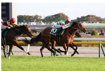
Ravel, winner of 2022 Artemis Stakes