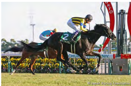
Light Quantum, winner of 2023 Shinzan Kinen