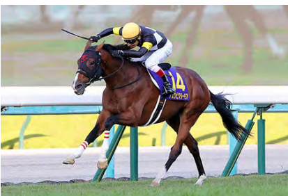
Ask Victor More, winner of 2022 Kikuka Sho

Boldog Hos (JPN, C4, by Screen Hero) , following a runner-up performance in the Kikuka Sho, scored another second in the Arima Kinen before kicking off his four-year-old season in the Hanshin Daishoten (G2, 3,000m) on March 19, where the son of Screen Hero finished second, 1-3/4 lengths behind the Kikuka Sho third-place finisher Justin Palace (JPN, C4, by Deep Impact) . Deep Bond (JPN, H6, by Kizuna) , who registered runner-up efforts in both the 2021 and 2022 Tenno Sho (Spring), was fifth.