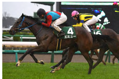
Emu, winner of 2023 Flower Cup

Meanwhile, the Satsuki Sho will see two prominent candidates absent. The 2022 Asahi Hai Futurity Stakes (G1, 1,600m) winner and Best Two-Year-Old Colt Dolce More (JPN, C3, by Rulership) will head for the NHK Mile Cup on May 7, while the year-end Hopeful Stakes champion Dura Erede will set out to challenge the UAE Derby, as mentioned above.