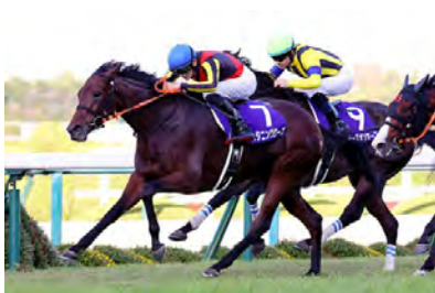
Stunning Rose, winner of 2022 Shuka Sho