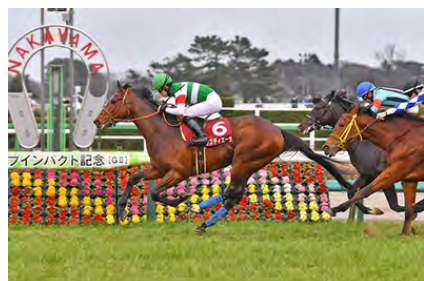
Tastiera, winner of 2023 Yayoi Sho Deep Impact Kinen