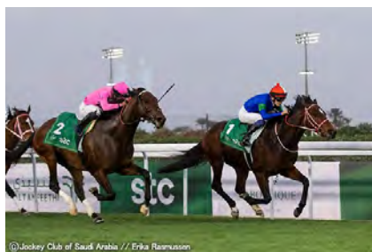
Bathrat Leon, winner of 2023 1351 Turf Sprint