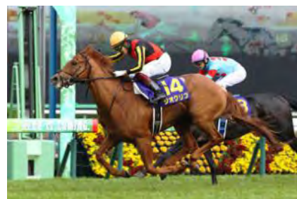
Geoglyph, winner of 2022 Satsuki Sho