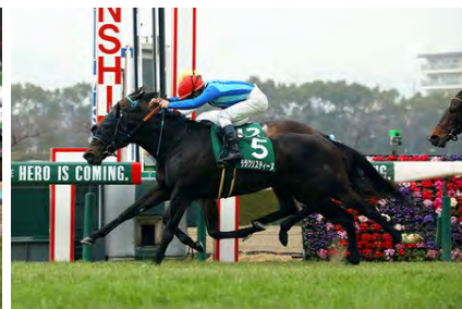
La La Christine, winner of 2023 Kyoto Himba Stakes

In addition to defending champion Songline , this year's Yasuda Kinen on June 4 will probably include strong milers like Serifos , Danon the Kid , Sodashi and two NHK Mile Cup (G1, 1,600m) winners— Schnell Meister (GER, H5, by Kingman; 2021) and Danon Scorpion (JPN, C4, by Lord Kanaloa). Schnell Meister commenced the current season in the Nakayama Kinen, where he showed good effort despite meeting traffic at the top of the stretch for fourth, while two-time G3 winner Elusive Panther (JPN, H5, by Heart's Cry) finished eighth. Danon Scorpion will begin his four-year-old campaign with the Keio Hai Spring Cup (G2, 1,400m) on May 13, one of the prep races towards the Yasuda Kinen, while contenders from the Milers Cup (G2, 1,600m) on April 23, another Yasuda Kinen prep, will probably be among the Yasuda Kinen lineup.