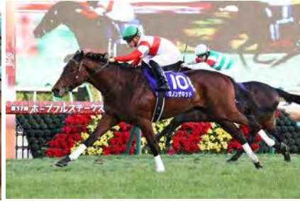
Danon the Kid, winner of 2020 Hopeful Stakes