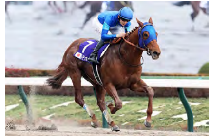
Lemon Pop, winner of 2023 February Stakes

Lemon Pop (USA, H5, by Lemon Drop Kid) , who has a record of 7-3-0 out of 10 starts at distances between 1,300 and 1,600 meters on dirt, had a choice of running in either the Godolphin Mile or the Dubai Golden Shaheen, but his connections decided to test his ability at 1,200 meters in the latter.