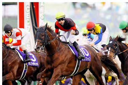
Serifos, winner of 2022 Mile Championship