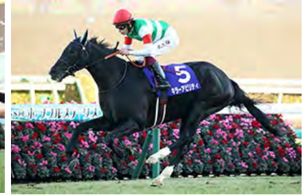
Killer Ability, winner of 2021 Hopeful Stakes

In the Tenno Sho (Spring) on April 30, defending champion Titleholder probably will be challenged mainly by four-year-old colts. Last year's Kikuka Sho (Japanese St. Leger, G1, 3,000m) champion Ask Victor More (JPN, C4, by Deep Impact) , who was given the rest of the season off instead of racing in the year-end Arima Kinen, will commence the current season in the Nikkei Sho, like Titleholder as mentioned. Mixology (JPN, C4, by Orfevre) , though unable to run in the Triple Crown races, extended his winning streak to four when claiming the Diamond Stakes (G3, 3,400m) in record time on February 18, and will make his first G1 challenge in the Tenno Sho (Spring).