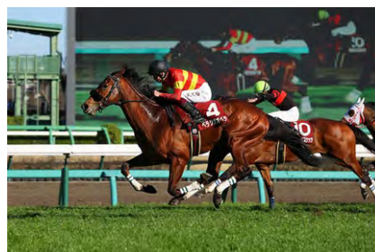
Bellagio Opera, winner of 2023 Spring Stakes

Along with these trial-race finishers, the field in the first leg of the Triple Crown is likely to include Danon Touchdown (JPN, C3, by Lord Kanaloa) , runner-up in the Asahi Hai Futurity Stakes, and Sol Oriens (JPN, C3, by Kitan Black) , Hrimfaxi (JPN, C3, by Rulership) and Phantom Thief