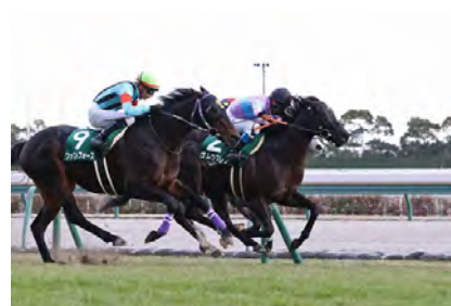
Namura Clair, winner of 2023 Silk Road Stakes

This year's Takamatsunomiya Kinen field will also feature six-time graded victor Meikei Yell (JPN, M5, by Mikki Isle) , 2021 Sprinters Stakes champion Pixie Knight (JPN, H5, by Maurice) , and last year's Sprinters Stakes runner-up Win Marvel (JPN, C4, by I'll Have Another) . Others will include Lotus Land (USA, M6, by Point of Entry) and Kir Lord (JPN, G8, by Lord Kanaloa) , who finished second and third respectively in last year's edition of the race.