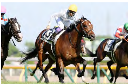
Do Deuce, winner of 2022 Tokyo Yushun