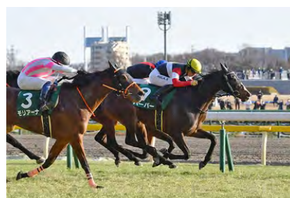
Harper, winner of 2023 Queen Cup