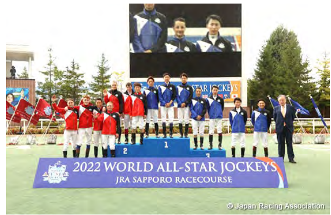
2022 World All-Star Jockeys (closing ceremony)