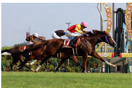
Toshin Macau, winner of 2024 Centaur Stakes