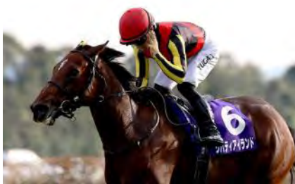
Liberty Island, winner of 2023 Shuka Sho