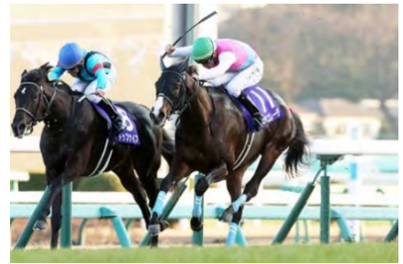
Dura Erede, winner of 2022 Hopeful Stakes