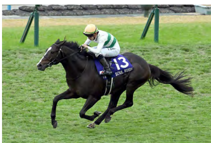
Soul Rush, winner of 2024 NHK Mile Cup