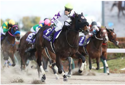
Peptide Nile, winner of 2024 February Stakes