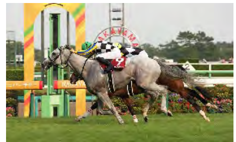
Gaia Force, winner of 2022 St. Lite Kinen

The Champions Cup field also includes Crown Pride (JPN, H5, by Reach the Crown) , who defended his Korea Cup (G3, dirt, 1,800m) title on September 8, Gaia Force (JPN, H5, by Kitan Black) , runner-up in the February Stakes, Hagino Alegrias (JPN, H7, by Kizuna) , who defended his Sirius Stakes (G3, dirt, 1,900m) title on September 28, and Gloria Mundi (JPN, H6, by King Kamehameha) and Seraphic Call (JPN, C4, by Henny Hughes) , winners of the Diolite Kinen (Listed, dirt, 2,400m) in 2023 and 2024, respectively.