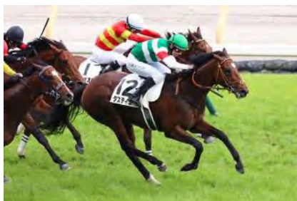
Tastiera, winner of 2023 Tokyo Yushun