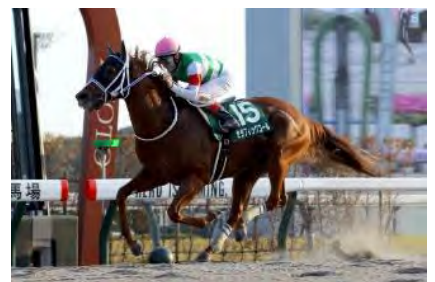
Seraphic Call, winner of 2023 Miyako Stakes