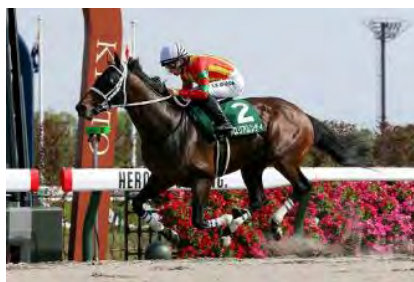
Gloria Mundi, winner of 2023 Heian Stakes