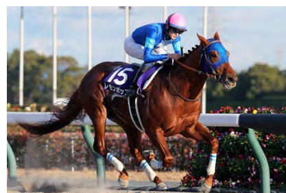
Lemon Pop, winner of 2023 Champions Cup

Last year's winner Lemon Pop (USA, H6, by Lemon Drop Kid) landed another major title in the Sakitama Hai (Listed, dirt, 1,400m) in June this year and then successfully defended his title in the Mile Championship Nambu Hai (Listed, dirt, 1,600m) in October. The son of Lemon Drop Kid is aiming to become the first horse to win the Champions Cup two years in a row since Transcend in 2010 and 2011, back when the race was known as the Japan Cup Dirt.