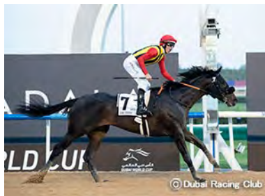
Crown Pride, winner of 2022 UAE Derby