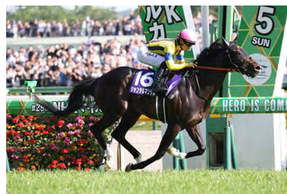
Jantar Mantar, winner of 2024 NHK Mile Cup

Scheduled to race in the Hong Kong Mile (G1, 1,600m) and hoping to follow in the footsteps of Admire Mars, the last (2019) of four Japanese winners, will be: