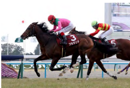
Pradaria, winner of 2024 Kyoto Kinen