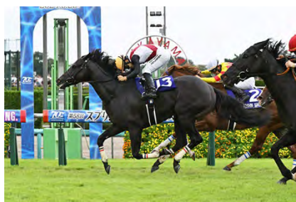
Lugal, winner of 2024 Sprinters Stakes