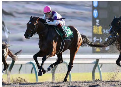
Sunrise Zipangu, winner of 2024 Miyako Stakes