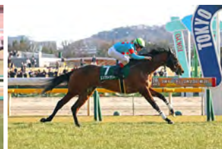
Embroidery, winner of 2025 Queen Cup

In the Satsuki Sho, Croix du Nord (JPN, C3, by Kitasan Black) is sure to be the center of attention after winning all three of his starts, including the Tokyo Sports Hai Nisai Stakes (G2, 1,800m) and the Hopeful Stakes (G1, 2,000m), emulating the flawless debut season of 2020 Triple Crown victor Contrail. Croix du Nord , the 2024 Best Two-Year-Old Colt, will launch his three-year-old campaign in the first leg of the Triple Crown.