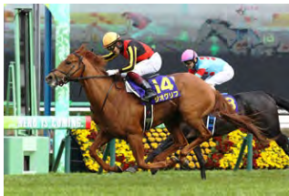
Geoglyph, winner of 2022 Satsuki Sho

Asia Express ), Admire Daytona (JPN, C3, by Drefong) and Dragon (JPN, C3, by Mind Your Biscuits) , third, fourth and fifth respectively in the Hyacinth Stakes (Listed, dirt, 1,600m) on February 23.