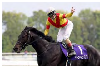
Justin Palace, winner of 2023 Tenno Sho (Spring)

H6, by Drefong ) and two-time graded winner Struve (JPN, G6, by King Kamehameha) , who together were fourth and fifth respectively in the Diamond Stakes; and Chevalier Rose (JPN, H7, by Deep Impact) , winner of last year's Kyoto Daishoten (G2, 2,400m) and Stayers Stakes (G2, 3,600m), who will start this season in the Nikkei Sho.