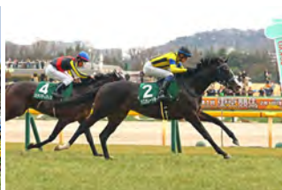
Masquerade Ball, winner of 2025 Kyodo News