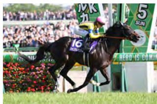
Jantar Mantar, winner of 2024 NHK Mile Cup

Other notable candidates for the Victoria Mile include Shirankedo (JPN, M5, by Declaration of War) and Wide Latour (JPN, F4, by California Chrome) , who respectively won the Nakayama Himba Stakes (G3, 1,800m) on March 8 and the Aichi Hai (G3, 1,400m) on March 23, and the aforementioned Ascoli Piceno .