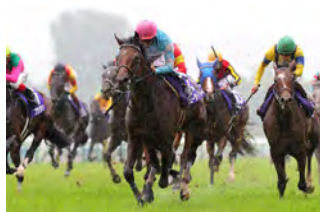
Blow the Horn, winner of 2024 Takarazuka Kinen