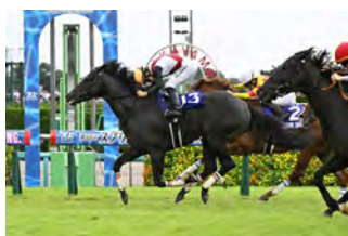
Lugal, winner of 2024 Sprinters Stakes

This year's Takamatsunomiya Kinen will also include two-time grade-race winner Satono Reve (JPN, H6, by Lord Kanaloa) and last year's Sprinters Stakes runner-up Toshin Macau (JPN, H6, by Big Arthur) , who were third and ninth respectively in the Hong Kong Sprint (G1, 1,200m, Dec.8); Namura Clair (JPN, M6, by Mikki Isle) , who is coming off her fifth graded title in the Hanshin Cup (G2, 1,400m, Dec.21) and will aim for a much-awaited G1 title in her ninth challenge at this level; and winners Big Caesar (JPN, H5, by Big Arthur) in the Keihan Hai (G3, 1,200m, Nov. 24), A Shin Fencer (JPN, M5, by Fine Needle) in the Silk Road Stakes (G3, 1,200m, Feb. 2) and Kangchenjunga (JPN, H5, by Big Arthur) in the Hankyu Hai (G3, 1,400m, Feb. 22).