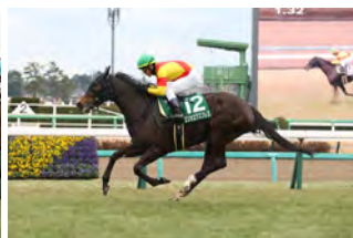
Erika Express, winner of 2025 Fairy Stakes