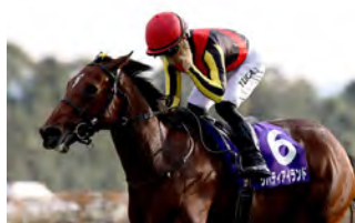
Liberty Island, winner of 2023 Shuka Sho

Four Japanese runners nominated for the Dubai Turf include Liberty Island (JPN, M5, by Duramente) , who became JRA's seventh winner of the Triple Crown for fillies in 2023 and then proved her strength in that year's Japan Cup against a mixed field of G1 runners, finishing second by four lengths to Equinox. The 2023 Best Three-Year-Old Filly commenced her 2024 season with the Dubai Sheema Classic, finishing a three-length third, and then was heavily beaten in the Tenno Sho (Autumn) (G1, 2,000m) but bounced back in the 2024 Hong Kong Cup (G1, 2,000m) to score a 1-1/2-length second behind Romantic Warrior. After the Dubai Turf, the Duramente mare may fly to Hong Kong for the Queen Elizabeth II Cup (G1, 2,000m) on April 27.