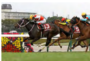
Shonan Xanadu, winner of 2025 Fillies' Revue