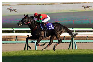
Meiner Grand, winner of 2023 Nakayama Daishogai

Meiner Grand (JPN, H7, by Gold Ship) , the 2023 Nakayama Daishogai champion and Best Steeplechase Horse, who attempted to defend his title in last year's Nakayama Daishogai but failed to finish when he unseated his rider at the last jump, also will kick off his seven-year-old season with the Nakayama Grand Jump. The Hanshin Spring Jump (J-G2, 3,900m) on March 15, the main prep towards the spring J-G1 event, was won by Veil Nebula (JPN, G7, by Lord Kanaloa) , who concluded the previous season with a fifth in the Nakayama Daishogai. Other runners in last year's Nakayama Daishogai—fourth-place June Velocity (JPN, H7, by Lord Kanaloa) , third-place Neviim (JPN, H7, by Kizuna) and runner-up Ecoro Duel (JPN, H6, by Kitasan Black) —were second, third and fourth respectively in the Hanshin Spring Jump. Impress (JPN, H6, by Kizuna) , who won the Pegasus Jump Stakes (Open Class, 3,350m) on March 22, will also be among the Nakayama Grand Jump field.