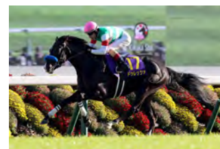
Durezza, winner of 2023 Kikuka Sho

by claiming the Kikuka Sho (Japanese St. Leger, G1, 3,000m), but has been winless since. Last year he finished fifth in the International Stakes (G1, 2,050m), his first overseas challenge, but was impressive in his last start, the 2024 Japan Cup, where he accelerated from mid-pack to take the lead in the backstretch, and despite being caught by winner Do Deuce, held on to share second place with the fast-closing Shin Emperor .