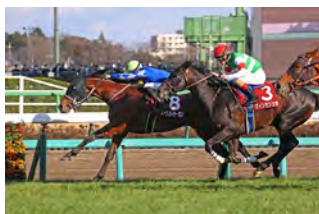
Faust Rasen, winner of 2025 Yayoi Sho Deep Impact Kinen