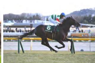
Redentor, winner of 2025 Diamond Stakes

Last year's Victoria Mile for four-year-old and up females was won by Ten Happy Rose , who commenced the 2025 season in the Middle East, as mentioned above, and retired thereafter. Last year's Shuka Sho runner-up Bond Girl (JPN, F4, by Daiwa Major) , who recorded her fifth runner-up effort in the Tokyo Shimbun Hai and is targeting the Victoria Mile on May 18, is scheduled to run in the Hanshin Himba Stakes (G2, 1,600m)