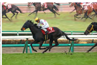
Piko Chan Black, winner of 2025 Spring Stakes