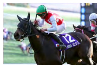
Arma Veloce, winner of 2024 Hanshin Juvenile Fillies

Arma Veloce (JPN, F3, by Harbinger) , last year's Best Two-Year-Old Filly after winning the two-year-old fillies' championship—the 2024 Hanshin Juvenile Fillies (G1, 1,600m)—will head straight to the Oka Sho along with Brown Ratchet (JPN, F3, by Kizuna) , winner of the 2024 Artemis Stakes (G3, 1,600m) but a disappointing 16th in the Hanshin Juvenile Fillies.