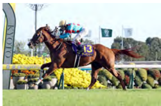
Urban Chic, winner of 2024 Kikuka Sho