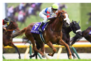
Ten Happy Rose, winner of 2024 Victoria Mile

Last year's Victoria Mile for four-year-old and up females was won by Ten Happy Rose , who commenced the 2025 season in the Middle East, as mentioned above, and retired thereafter. Last year's Shuka Sho runner-up Bond Girl (JPN, F4, by Daiwa Major) , who recorded her fifth runner-up effort in the Tokyo Shimbun Hai and is targeting the Victoria Mile on May 18, is scheduled to run in the Hanshin Himba Stakes (G2, 1,600m)