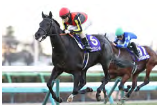
Croix du Nord, winner of 2024 Hopeful Stakes

Among those who earned Satsuki Sho berths in other trial races was the Hopeful Stakes third-place finisher Faust Rasen (JPN, C3, by Mozu Ascot) , along with Vincentio (JPN, C3, by Real Steel) and Alohi Alii (JPN, C3, by Duramente) , who together were the top finishers (in that order) in the Yayoi Sho Deep Impact Kinen (G2, 2,000m) on March 9. Others include Piko Chan Black (JPN, C3, by Kitasan Black) , Fukuno Blue Lake (JPN, C3, by Win Bright) and King Squall (JPN, C3, by Duramente) , the top three finishers (in that order) in the Spring Stakes (G2, 1,800m) on March 16, and the Hopeful Stakes runner-up Giovanni (JPN, C3, by Epiphaneia) as well as Roland Barows (JPN, C3, by Henry Barows) , who were first and second respectively in the Wakaba Stakes (Listed, 2,000m) on March 22.