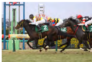
Nishino Agent, winner of 2025 Keisei Hai

February and G T Adamant (JPN, C3, by Rulership) in the Sumire Stakes (Listed, 2,200m) in March. Museum Mile (JPN, C3, by Leontes) , the Asahi Hai Futurity Stakes runner-up who was fourth in the Deep Impact Kinen, will also head to the Satsuki Sho.