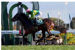
Satono Shining, winner of 2025 Kisaragi Sho