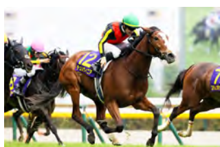
Cervinia, winner of 2024 Yushun Himba

The second G1 winner to run in the Dubai Sheema Classic is Cervinia (JPN, F4, by Harbinger) , who won last year's Yushun Himba (Japanese Oaks, G1, 2,400m) and the Shuka Sho (G1, 2,000m) before finishing fourth in the Japan Cup, her first challenge against a mixed field of older foes, finishing 2-1/2 lengths behind Durezza and Shin Emperor . The 2024 Best Three-Year-Old Filly commenced the 2025 season with the Kyoto Kinen (G2, 2,200m) but failed at the stretch and disappointed to ninth.