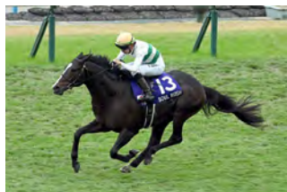
Soul Rush, winner of 2024 Mile Championship

races at a mile—the Mile Championship (G1) in November and the Tokyo Shimbun Hai (G3) in February—finishing fourth in both. The Dubai Turf’s extra 200 meters might allow her to display her trademark late kick.