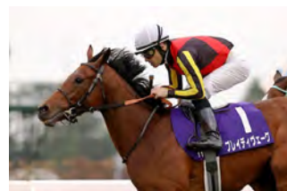
Brede Weg, winner of 2023 Queen Elizabeth II Cup

The second Dubai Turf nominee is Brede Weg (JPN, M5, by Lord Kanaloa) , who landed her first G1 victory in the 2023 Queen Elizabeth II Cup (G1, 2,200m) and then was entered in last year's Dubai Turf but had to cancel due to a problem in her right hind leg. The bay won her comeback start in the Fuchu Himba Stakes (G2, 1,800m) in October, then ran two