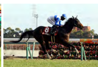
Lord del Rey, winner of 2025 Nikkei Shinshun Hai

While this year's Tenno Sho (Spring) will miss defending champion T O Royal (JPN, H7, by Leontes) due to a leg problem, Justin Palace (JPN, H6, by Deep Impact) , winner of the 2023 edition, will be back to reclaim his title in this G1 event for stayers after his prep in the Osaka Hai. Though winless since his victory in the Tenno Sho (Spring), the six-year-old brown has shown competence, finishing within fifth in all but one of eight starts at G1 level. Urban Chic (JPN, C4, by Suave Richard) , who won both the St. Lite Kinen and the Kikuka Sho and then concluded his three-year-old season with a sixth in the Arima Kinen, will begin this season with the Nikkei Sho (G2, 2,500m) on March 29. Blow the Horn (JPN, H6, by Epiphaneia) , last year's Tenno Sho (Spring) runner-up and Takarazuka Kinen victor, commenced the season with the Hanshin Daishoten (G2, 3,000m) on March 23, where he settled in mid-division and closed on the leaders in the stretch but crossed the wire in third, 7-1/2 lengths behind the winner.