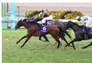
Mama Cocha, winner of 2023 Sprinters Stakes