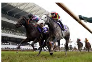
Mad Cool, winner of 2024 Takamatsunomiya Kinen