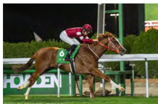
Shin Emperor, winner of 2025 Neom Turf Cup

Remake (JPN, H6, by Lani ) failed to defend his title in the Riyadh Dirt Sprint (G2, dirt, 1,200m), finishing seventh. Gabby's Sister (JPN, F4, by Apollo Kingdom ), winner of the 2024 Capella Stakes (G3, dirt, 1,200m), was third; Jasper Krone (USA, H6, by Frosted ), two-time graded turf sprint victor, was ninth; Chikappa (JPN, C4, by Real Steel ), winner of two graded sprint titles on dirt, was tenth; and Igniter (JPN, H7, by Espoir City ), two-time NAR Horse of the Year, was 11th.