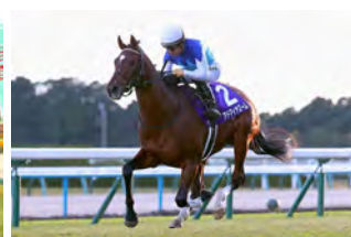
Admire Zoom, winner of 2024 Asahi Hai Futurity Stakes

Admire Zoom (JPN, C3, by Maurice) , winner of the 2024 Asahi Hai Futurity Stakes, will focus on the mile distance instead of the Triple Crown classics and kick off the current season in the New Zealand Trophy (G2, 1,600m) on April 12, one of the trial races for the NHK Mile Cup (G1, 1,600m) on May 11. Asahi Hai Futurity Stakes third-place finisher Lance of Chaos (JPN, C3, by Silver State) , who was third in his first start of the season in the Kisaragi Sho, will also step down in distance and aim for his first G1 title.