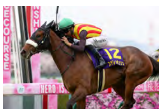
Stellenbosch, winner of 2024 Oka Sho