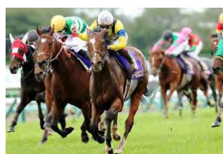
Sol Oriens, winner of 2023 Satsuki Sho