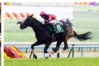
Eri King, winner of 2024 Kyoto Nisai Stakes

The Satsuki Sho field will likely include five winners: Eri King (JPN, C3, by Kizuna) in the Kyoto Nisai Stakes (G3, 2,000m) in November, Nishino Agent (JPN, C3, by Isla Bonita) in the Keisei Hai (G3, 2,000m) in January, Satono Shining (JPN, C3, by Kizuna) in the Kisaragi Sho (G3, 1,800m) in February, Masquerade Ball (JPN, C3, by Duramente) in the Kyodo News Hai (G3, 1,800m) in