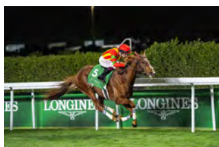
Byzantine Dream, winner of 2025 Red Sea Turf Handicap

Byzantine Dream (JPN, C4, by Epiphaneia ), the 2024 Kisaragi Sho (G3, 1,800m) victor, registered his second graded title in the Red Sea Turf Handicap (G2, 3,000m), becoming the next Japanese horse to win the race after Stay Foolish in 2022 and Silver Sonic in 2023. The son of Epiphaneia will head to the Tenno Sho (Spring) (G1, 3,200m) on May 4, which will also include Satono Glanz (JPN, H5, by Satono Diamond ), a two-time grade-race winner who ran in the H.H The Amir Trophy (G3, 2,300m) in Qatar on February 16 to finish third.