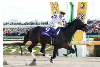
Peptide Nile, winner of 2024 February Stakes

The Al Quoz Sprint (G1, 1,200m) field will include three Japanese runners— Danon McKinley (JPN, C4, by Maurice) , a two-time grade-race victor at 1,400 meters, Puro Magic (JPN, F4, by Asia Express) whose four wins were all at 1,200 meters including two G3 events, and Win Carnelian (JPN, H8, by Screen Hero) , last year’s Takamatsunomiya Kinen fourth-place finisher.