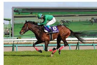
Irogotoshi, winner of 2024 Nakayama Grand Jump

The highlight of this spring's steeplechase calendar undoubtedly will be the Nakayama Grand Jump (J-G1, 4,260m) on April 19. With 2024 Nakayama Daishogai (J-G1, 4,100m) winner and Best Steeplechase Horse Nishino Daisy retiring at the end of last season, this year's edition will feature Irogotoshi (JPN, H8, by Vincennes) , who was diagnosed with a tendon injury after defending his title in last year's Nakayama Grand Jump, but has already resumed training to aim for his third consecutive title this year.