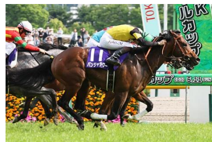
Panja Tower, winner of 2025 NHK Mile Cup

Panja Tower (JPN, C3, by Tower of London) , who scored an upset victory as the ninth pick in the NHK Mile Cup (G1, 1,600m) in May, will take on tougher competition in his first overseas challenge, the AUS$10-million Golden Eagle (1,500m) at Rosehill Gardens on November 1. But prior to that, the son of Tower of London will begin the latter half of his season with the Keeneland Cup (G3, 1,200m) in Sapporo on August 24.