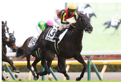
Croix du Nord, winner of 2025 Tokyo Yushun

Croix du Nord (JPN, C3, by Kitasan Black) won all three of his starts in 2024, including the Hopeful Stakes (G1, 2,000m), to earn the title of Best Two-Year-Old Colt. In his kick-off start this season in the Satsuki Sho, his bid for a Triple Crown was denied by Museum Mile, but Croix du Nord lived up to expectations with a convincing victory in his next race, the Tokyo Yushun. Along with Byzantine Dream , he will fly to France to prep in the Prix du Prince d'Orange (G3, 2,000m) on September 14 before aiming for