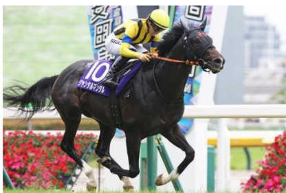
Jantar Mantar, winner of 2025 Yasuda Kinen