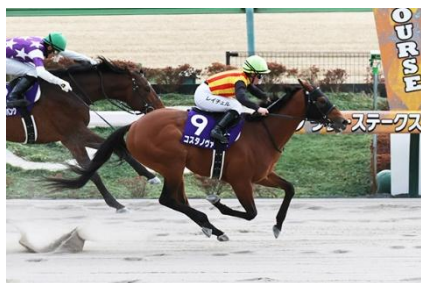
Costa Nova, winner of 2025 February Stakes