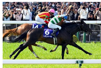
Redentor, winner of 2025 Tenno Sho (Spring)

Redentor (JPN, C4, by Rulership) missed the spring classics last year but won two allowance races during the summer. He concluded his three-year-old season with a runner-up effort in his first G1 challenge, the Kikuka Sho. This year, Redentor has demonstrated his strength at long distances with back-to-back victories in the Diamond Stakes (G3, 3,400m) in February and the Tenno Sho (Spring) in May. The dark bay colt was withdrawn from the Arc and instead scheduled to run in the International Stakes in the UK, prior to targeting the Japan Cup but the UK trip was also cancelled due to a femur fracture in his right hind leg.