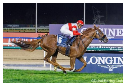
Danon Decile, winner of 2025 Dubai Sheema Classic

Danon Decile (JPN, C4, by Epiphaneia) , the 2024 Tokyo Yushun (Japanese Derby, G1, 2,400m) victor, claimed his second G1 title this year in the Dubai Sheema Classic (G1, 2,410m). After returning to Japan, the Epiphaneia colt has been given ample rest. He will fly to Great Britain for the International Stakes (G1, 2,050m) on August 20—the same race in which Japan-bred Durezza finished fifth last year. After that, Danon Decile will