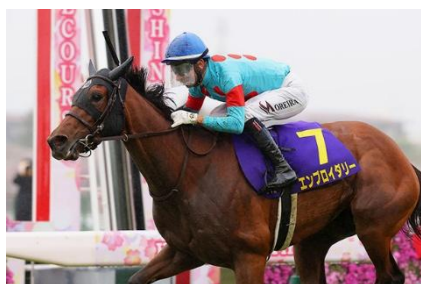
Embroidery, winner of 2025 Oka Sho