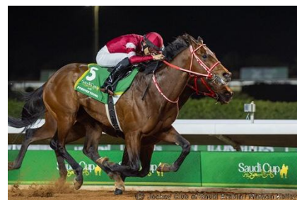
Forever Young, winner of 2025 Saudi Cup

Earlier this season, Japanese-bred contenders turned in some outstanding performances overseas. In February, Forever Young (JPN, C4, by Real Steel) outdueled Romantic Warrior to claim the Saudi Cup (G1, dirt, 1,800m) title, the first overseas G1 title for a Japanese horse since Ushba Tesoro won the Dubai World Cup in 2023. Although beaten to third in the following Dubai World Cup (G1, dirt, 2,000m), Forever Young's connections plan to race the Real Steel colt for a second time in the Breeders' Cup Classic (G1, dirt, 2,000m) on November 1, following his third-place effort last year. The four-year-old has had plenty of rest since returning to Japan and will kick off his autumn campaign with the Nippon TV Hai (Listed, dirt, 1,800m) on October 1, prior to flying to the USA.