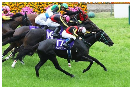
Ascoli Piceno, winner of 2025 Victoria Mile

Ascoli Piceno (JPN, F4, by Daiwa Major) , the 2023 Best Two-Year-Old Filly, won her second G1 title in the Victoria Mile (G1, 1,600m) this past May. Three weeks later, the Daiwa Major filly had to withdraw from the Yasuda Kinen due to health issues, but on August 17 she is expected to run in the Prix Jacques Le Marois (G1, 1,600m), previously won by Japanese-trained Taiki Shuttle in 1998. Ascoli Piceno will be joined in the Prix Jacques Le Marois