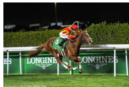
Byzantine Dream, winner of 2025 Red Sea Turf Handicap

Yushun. However, that autumn the Epiphaneia colt improved to fifth place in the Kikuka Sho (Japanese St. Leger, G1, 3,000m). This year, he proved his ability at longer distances by winning the Red Sea Turf Handicap (G2, 3,000m) in February and finishing second in the Tenno Sho (Spring) (G1, 3,200m) in May. The chestnut colt will fly to France for the Prix Foy (G2, 2,400m) on September 7 prior to his Arc challenge.