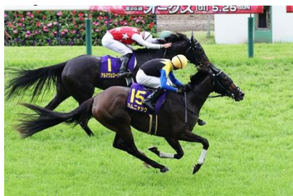
Kamunyak, winner of 2025 Yushun Himba