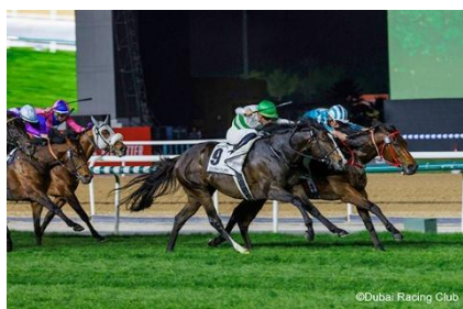
Soul Rush (front), winner of 2025 Dubai Turf

In the Dubai Turf (G1, 1,800m) during the Dubai World Cup day in April, Soul Rush (JPN, H7, by Rulership) crossed the wire a nose in front of multiple G1 winner Romantic Warrior for his second G1 victory. Back home in the Yasuda Kinen (G1, 1,600m) on June 8, the 2024 Mile Championship (G1, 1,600m) victor was third by a neck and another 1-1/2 lengths behind the winner.