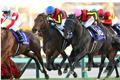
Regaleira, winner of 2024 Arima Kinen

Regaleira (JPN, F4, by Suave Richard) won the 2023 Hopeful Stakes against male rivals as a two-year-old. But in the following season, when she challenged males again, she was winless in the first two legs of the Triple Crown as well as in two subsequent starts against fillies and mares. However, the Suave Richard filly bounced back in the 2024 Arima Kinen (G1, 2,500m) to grab a major G1 title. But then she sustained a chip fracture in her right