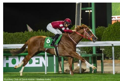
Shin Emperor, winner of 2025 Neom Turf Cup

Shin Emperor (FR, C4, by Siyouni) , a full brother to 2020 Prix de l'Arc de Triomphe victor Sottsass, won his first two career starts as a two-year-old, including a graded victory in the 2023 Kyoto Nisai Stakes (G3, 2,000m). Although winless in his next seven starts, he was runner-up three times, including in two G1 events—the Hopeful Stakes and the Japan Cup. He notched his second graded victory this past February in the Neom Turf Cup (G2, 2,100m), but after placing seventh in his next race, the Dubai Sheema Classic, Shin Emperor was given a rest. If his recovery goes well, he will resume training towards his second challenge in the Irish Champion Stakes (G1, 2,000m) at Leopardstown, where he placed third last year, and then the Arc, where he was 12th last year. He will finish the year by pursuing his main target, the Japan Cup.