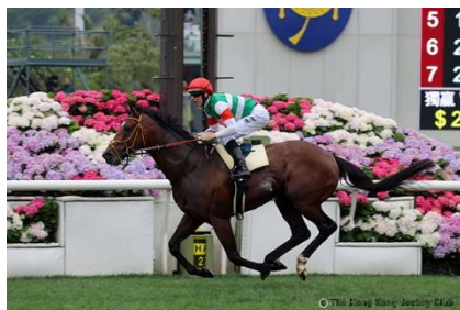
Tastiera, winner of 2025 Queen Elizabeth II Cup

likely aim for the Japan Cup (G1, 2,400m).