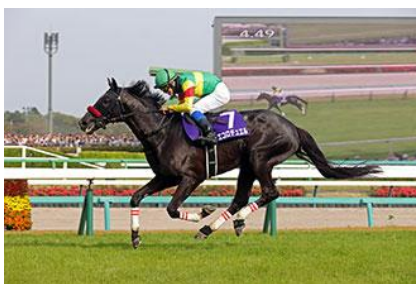
Ecoro Duel, winner of 2025 Nakayama Grand Jump