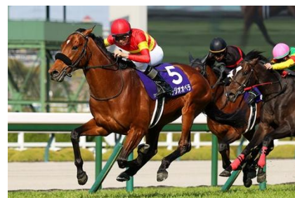
Bellagio Opera, winner of 2025 Osaka Hai