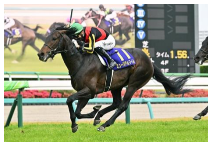
Museum Mile, winner of 2025 Satsuki Sho