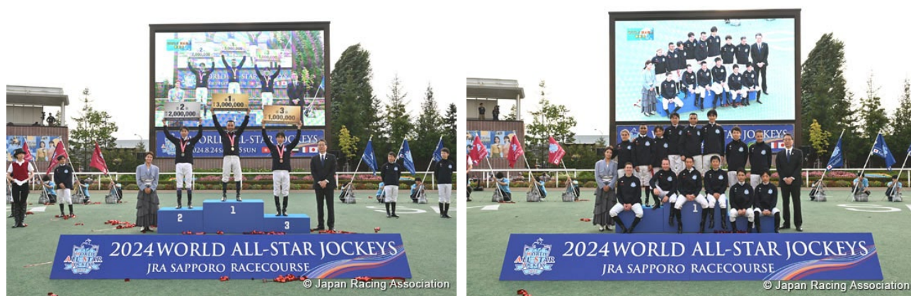
2024 World All-Star Jockeys (closing ceremony)

The first two of the four-race series will be conducted on August 23rd (Sat.), while the remaining two will be held the following day.