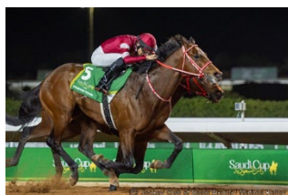
Forever Young, winner of 2025 Saudi Cup