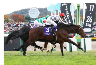
Do Deuce, winner of 2024 Japan Cup

The 2024 Japan Cup was won by five-year-old Do Deuce (JPN, by Heart's Cry), who was coming off another G1 victory four weeks earlier in the Tenno Sho (Autumn) (2,000m). Durezza and Shin Emperor tied for second place. Do Deuce, who dominated the race with a strong finish, covering the last 600 meters in 32.7 seconds for his fourth career G1 victory, was due to make his final start in the Arima Kinen (G1, 2,500m), but he was withdrawn at the last minute and retired to stud. Two other Japanese runners in the Japan Cup—Stars on Earth (JPN, by Duramente; 7th) and Karate (JPN, by To the Glory; 13th)—also retired, but the remaining eight continued training into the 2025 season.