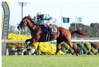
Urban Chic, winner of 2024 Kikuka Sho

leader in his final strides for a second grade-race title. Hopes are high for the three-year-old colt in the coming Tenno Sho (Autumn)