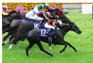
Ascoli Piceno, winner of 2025 Victoria Mile