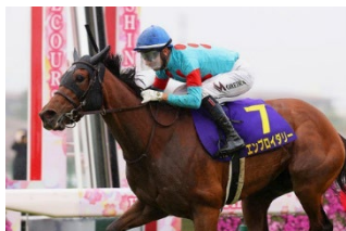
Embroidery, winner of 2025 Oka Sho

Style (JPN, F3, by Sottsass) in third. Yushun Himba third-place finisher Tagano Abby (JPN, F3, by Animal Kingdom) had to be pulled at the last minute due to a lame right foreleg and will not be able to race this year.