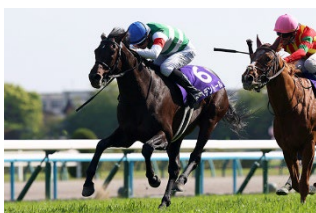
Redentor, winner of 2025 Tenno Sho (Spring)