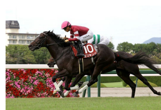
Eri King, winner of 2025 Kobe Shimbun Hai

Japanese Derby third-place finisher Shohei (JPN, C3, by Saturnalia) kicked off his autumn campaign with the Kobe Shimbun Hai (G2, 2,400m) on September 21, where he traveled wide in third and briefly took command passing the 200-meter pole but crossed the wire a neck behind in second, unable to hold off the fast-closing Kyoto Nisai Stakes (G3, 2,000m) winner Eri King (JPN, C3, by Kizuna) , who delivered the fastest late kick. Hopeful Stakes runner-up Giovanni (JPN, C3, by Epiphaneia) traveled inside Shohei by the rails in fourth, found a narrow space between horses at the top of the stretch and chased the top two horses to secure third place.