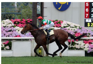
Tastiera, winner of 2025 Queen Elizabeth II Cup

Other older contenders likely to be seen in the Tenno Sho (Autumn) and/or the Japan Cup are Tastiera (JPN, H5, by Satono Crown ), Urban Chic (JPN, C4, by Suave Richard ) and Regaleira (JPN, F4, by Suave Richard ). In April, Tastiera claimed his second G1 victory—including the 2023 Japanese Derby—in the Queen Elizabeth II Cup (G1, 2,000m) in Hong Kong. The five-year-old will next run in the Tenno Sho (Autumn) and then fly back to Hong Kong for the Hong Kong Cup (G1, 2,000m) on December 14.