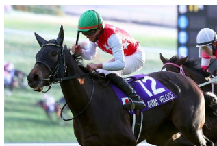
Arma Veloce, winner of 2024 Hanshin Juvenile Fillies