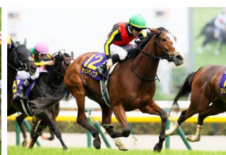
Cervinia, winner of 2024 Yushun Himba