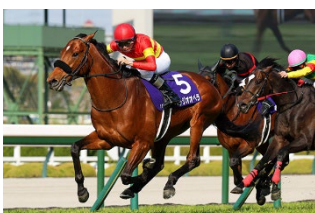
Bellagio Opera, winner of 2025 Osaka Hai

Danon Decile (JPN, C4, by Epiphaneia) won this year's Dubai Sheema Classic for his second G1 title, following the 2024 Tokyo Yushun (Japanese Derby, G1, 2,400m). Although winless in the latter half of 2024, his three-year-old campaign, he was sixth in the Kikuka Sho and third in the Arima Kinen. The colt kicked off his four-year-old season by winning the American Jockey Club Cup (G2, 2,200m) in January, his first victory in eight months, and then turned in an impressive finish to take the Dubai Sheema Classic. After finishing fifth in the International Stakes (G1, 2,050m) in August, Danon Decile is expected to return to Japan for the Japan Cup.