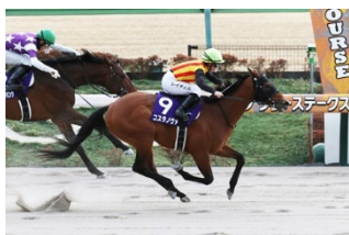
Costa Nova, winner of 2025 February Stakes

Other older horses expected to target the Champions Cup are 2024 Tokyo Derby (Listed, dirt, 2,000m) champion Ramjet (JPN, C4, by Majestic Warrior) and last year's third-place finisher Dura Erede (JPN, H5, by Duramente) , who respectively were third and fifth in the Korea Cup on September 7. Joining them will be King's Sword (JPN, H6, by Sinister Minister) , winner of both the 2023 JBC Classic and the 2024 Teio Sho.