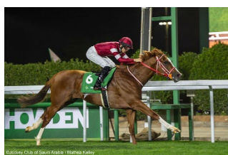
Shin Emperor, winner of 2025 Neom Turf Cup