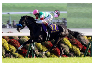
Durezza, winner of 2023 Kikuka Sho

Fifth-place Justin Palace (JPN, H6, by Deep Impact) ran in four G1 events after the 2024 Japan Cup. He capped off his 2024 campaign with a fifth-place finish in the Arima Kinen and then was sixth in his first two starts in 2025, the Osaka Hai (2,000m) and the Tenno Sho (Spring). In the Takarazuka Kinen in June, the six-year-old was in the money for the first time in 20 months—since a runner-up effort in the 2023 Tenno Sho (Autumn)—charging powerfully from behind to finish third. His fall plans have not been announced but he is expected to continue racing in middle-to-long-distance G1 races.