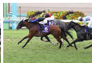
Mama Cocha, winner of 2023 Sprinters Stakes

This year's Queen Elizabeth II Cup for three-year-olds-and-up fillies and mares will be held at Kyoto Racecourse on November 16. Defending champion Stunning Rose (JPN, by King Kamehameha) retired at the end of last season, so this year's contenders will include G1 winners such as 2023 victor Brede Weg (JPN, M5, by Lord Kanaloa) , the aforementioned Cervinia and Regaleira , and last year's Oka Sho (Japanese 1000 Guineas, G1, 1,600m) winner Stellenbosch (JPN, F4, by Epiphaneia) .