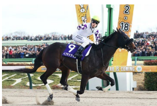
Peptide Nile, winner of 2024 February Stakes