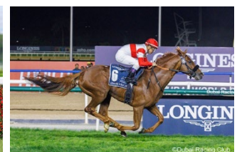
Danon Decile, winner of 2025 Dubai Sheema Classic