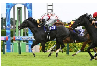
Lugal, winner of 2024 Sprinters Stakes