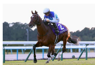
Admire Zoom, winner of 2024 Asahi Hai Futurity Stakes