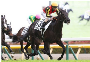
Croix du Nord, winner of 2025 Tokyo Yushun