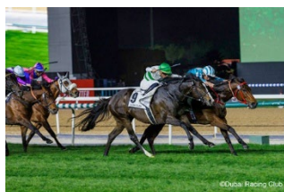
Soul Rush (front), winner of 2025 Dubai Turf

This year's Yasuda Kinen runner-up Gaia Force (JPN, H6, by Kitasan Black) will begin his autumn campaign with the Fuji Stakes. The field will include 2023 NHK Mile Cup victor Champagne Color (JPN, H5, by Duramente) ; Water Licht (JPN, C4, by Drefong) , winner of the Tokyo Shimbun Hai (G3, 1,600m) this February; Magic Sands (JPN, C3, by Kizuna) , runner-up in this year's NHK Mile Cup; and defending champion Jun Blossom (JPN, H6, by World Ace) . This year's Mile Championship field may also feature Elton Barows (JPN, H5, by Deep Brillante) , Win Marvel (JPN, H6, by I'll Have Another) and Brede Weg , respectively second, third and fourth last year. Other possibles are Queen's Walk (JPN, F4, by Kizuna) , a three-time graded winner who was second in the Victoria Mile, Bond Girl (JPN, F4, by Daiwa Major) , who has finished second in six graded events including last year's Shuka Sho, and Admire Zoom (JPN, C3, by Maurice) , winner of last year's Asahi Hai Futurity Stakes.