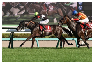
Kelly Fled Ask, winner of 2025 Shion Stakes