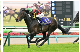
Museum Mile, winner of 2025 Satsuki Sho

Masquerade Ball (JPN, C3, by Duramente) scored three wins in four career starts, including a graded victory in the Kyodo News Hai (G3, 1,800m), then was third in the Japanese 2000 Guineas and followed up with a second in the Japanese Derby, where he made up ground impressively from an outside draw. One of the last of Duramente's crop, Masquerade Ball is expected to use his skill going left-handed—where he has three wins and a second in four starts—when performing on the big stage against older foes in the Tenno Sho (Autumn) and possibly the Japan Cup.