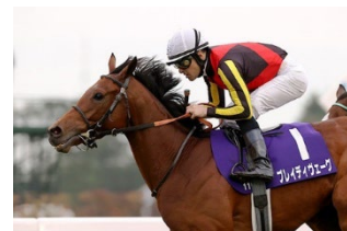
Brede Weg, winner of 2023 Queen Elizabeth II Cup

This year's Queen Elizabeth II Cup for three-year-olds-and-up fillies and mares will be held at Kyoto Racecourse on November 16. Defending champion Stunning Rose (JPN, by King Kamehameha) retired at the end of last season, so this year's contenders will include G1 winners such as 2023 victor Brede Weg (JPN, M5, by Lord Kanaloa) , the aforementioned Cervinia and Regaleira , and last year's Oka Sho (Japanese 1000 Guineas, G1, 1,600m) winner Stellenbosch (JPN, F4, by Epiphaneia) .