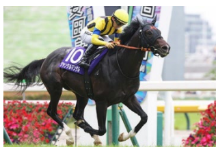
Jantar Mantar, winner of 2025 Yasuda Kinen