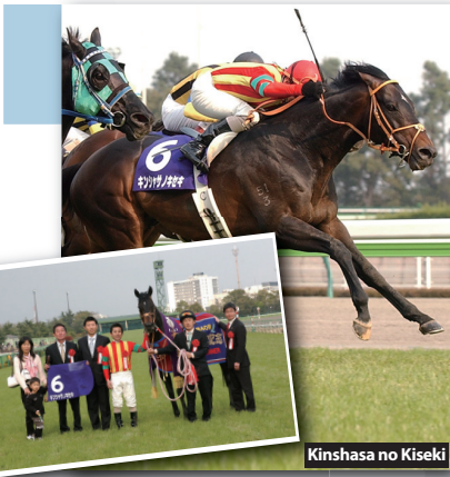
Kinshasa no Kiseki

Sunday, 27 March 2011 Hanshin Racecourse 1,200m (Right Handed) (6f) turf·4yo+