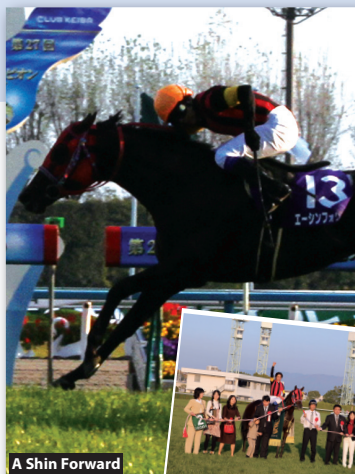
A Shin Forward

(Prize of equivalent value will be offered)