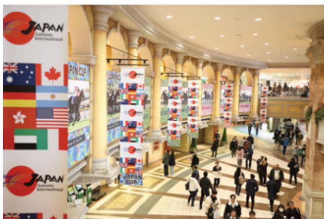
"The Avenue" in Fuji View Stand at Tokyo Racecourse

The JRA has been permitted to organize pari-mutuel wagering on the races conducted in Japan only. In 2015, Racing Law was reformed to allow JRA to offer pari-mutuel betting on the designated overseas races, and JRA commenced its first overseas simulcasting with the Prix de l'Arc de Triomphe in 2016.