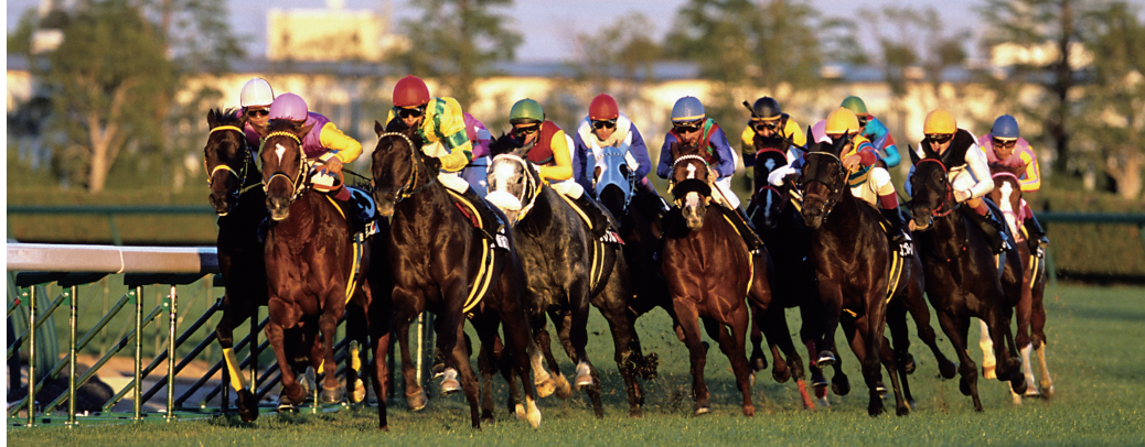
Horses squeeze into the 4th corner in the Golden Boots Trophy race.

Edgar Prado, representing the North American area and making his fifth appearance in the series, stated that the track surface is very impressive, provides a good cushion with a nice “bounce” for the horse,