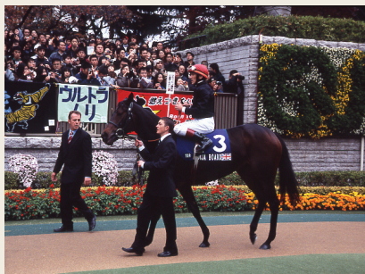
Ouija Board (GB)