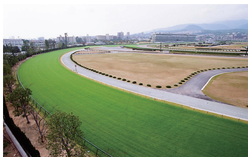
New turf course from the far corner of the grand stand.

Essentially, the dirt course has remained the same, although there was a slight renovation to the fourth corner to allow it to match the corning of the curve of the inner turf course. The dirt course was also completely resurfaced to provide continuity for better racing and also for better course safety.