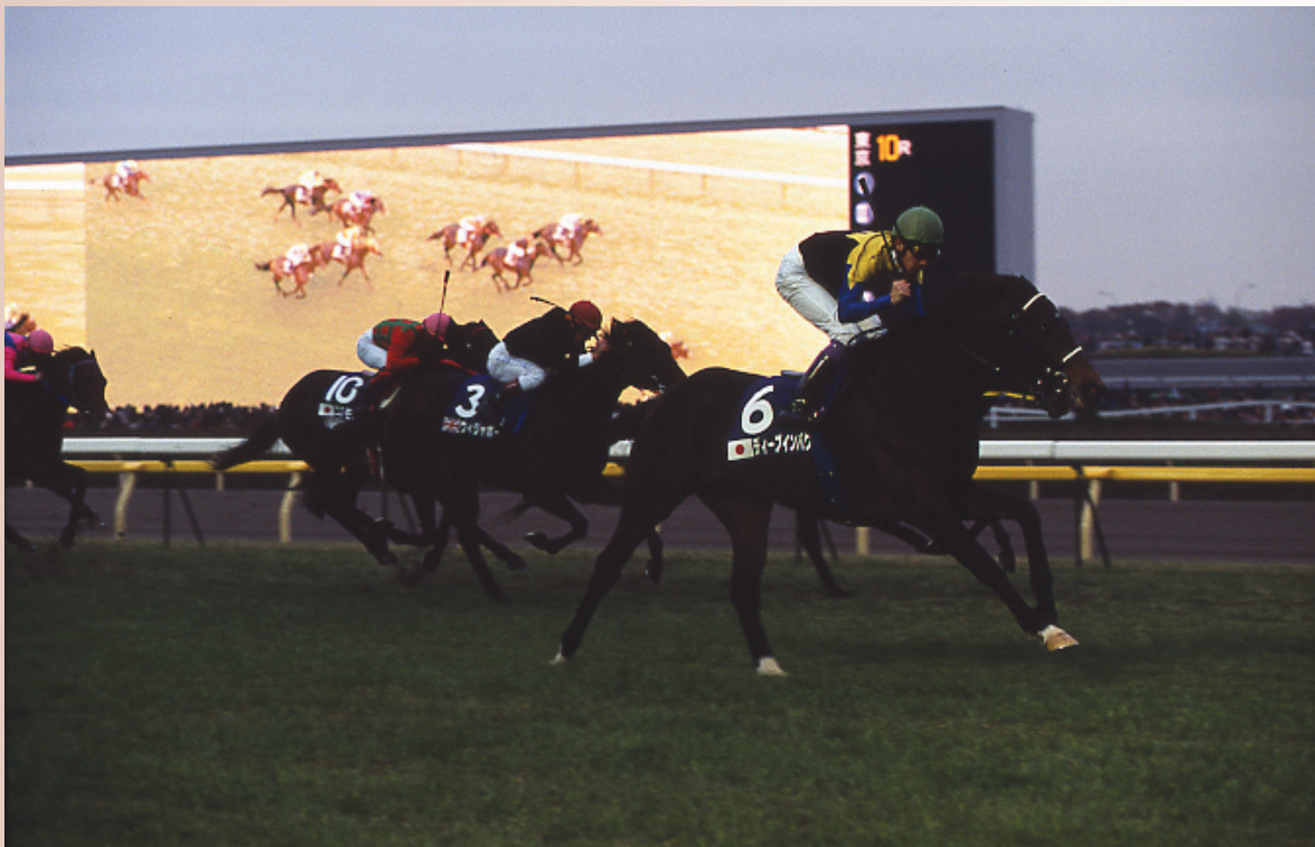
Deep Impact won the Japan Cup.

Japan Cup weekend 2006 – it could have been, with the smallest showing from abroad yet in the combined Japan Cup Dirt/Japan Cup lineup, a rather