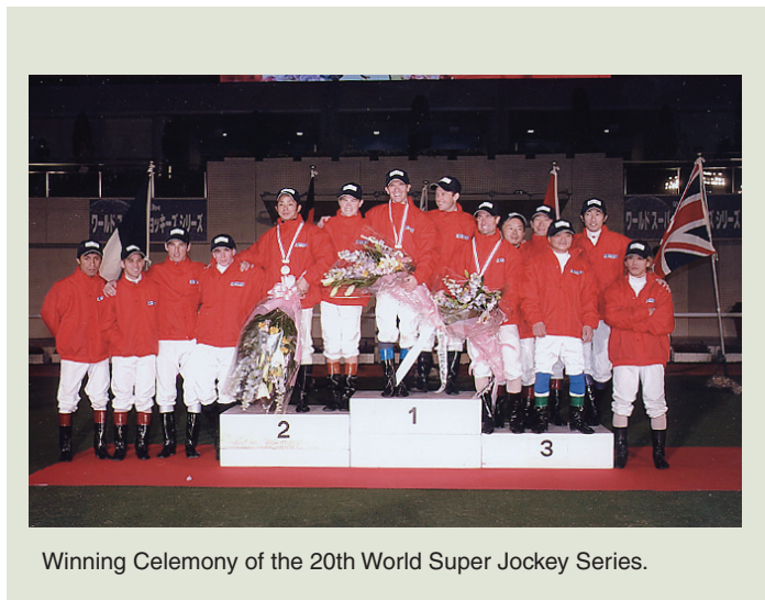
Winning Ceremony of the 20th World Super Jockey Series.