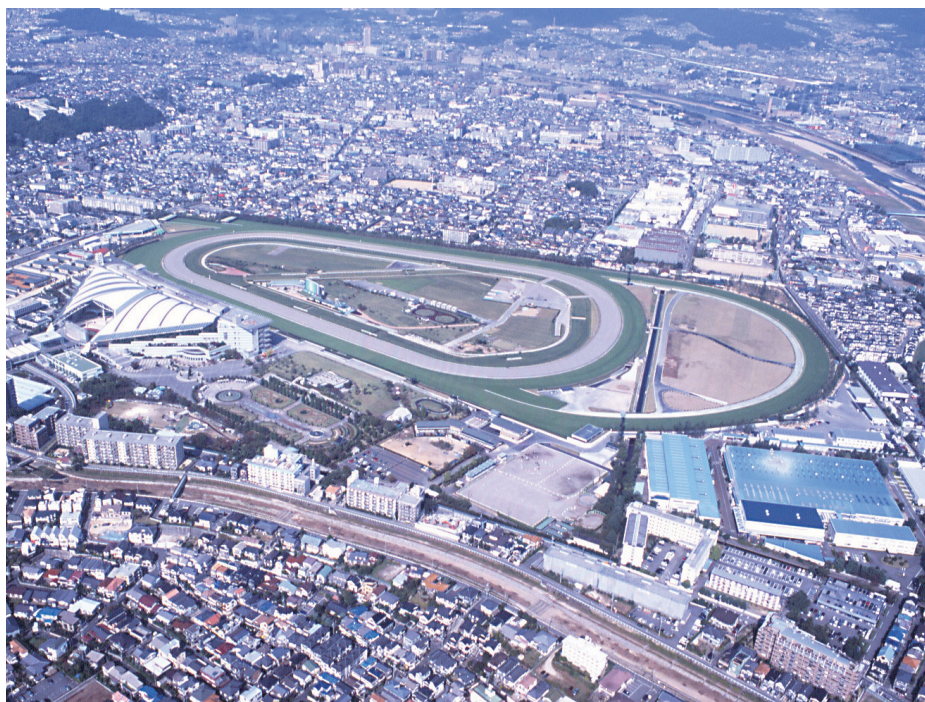
The turf course has been newly extended to the right of the canal.

The tracks of JRA’s Hanshin Racecourse had been under renovation since the close of the 2006 April race meeting. All courses were newly reopened on Saturday Dec. 2nd, 2006. The new eight-day Hanshin meeting began on the new tracks with the World Super Jockeys Series and the Hanshin Juvenile Fillies Stakes (GI).