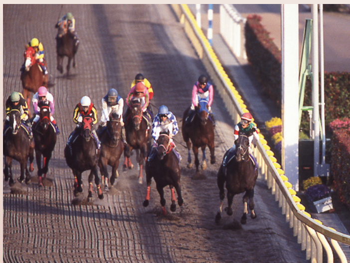
Alondite won the Japan Cup Dirt.