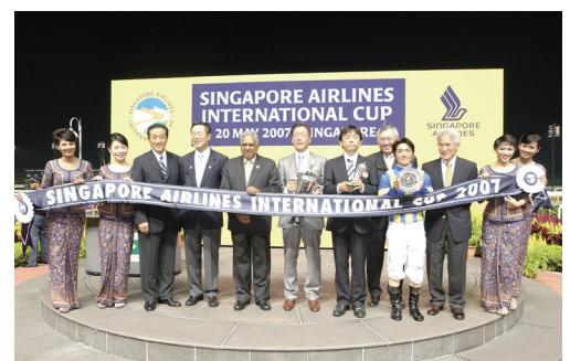
Shadow Gate and connections smiling at the award ceremony.

It looked for a moment as if Cosmo Bulk would drop out when the pressure was applied in the straight, but he did not let any others pass him and in the final stages he actually began to make ground again on the leader. In the final 50m or so both Cosmo Bulk and Doctor Dino were catching the tiring Shadow