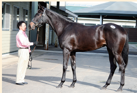
Filly offered at the top price (by Manhattan Cafe, out of Chokai Marine).