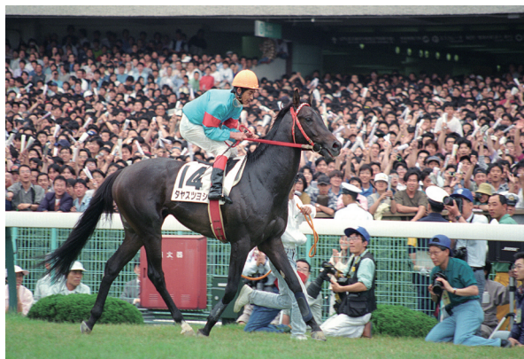
Tayasu Tsuyoshi won the Japanese Derby in 1995.

His sire was Tayasu Tsuyoshi and his dam Playtoss, sired by Protos. Incidentally, Tayasu Tsuyoshi's had sire Sunday Silence and dam Magaro, sired by Caro, in his lineage and a lifetime record of four wins and three second place finishes in 13 races, with ¥297,436,000 in career winnings.