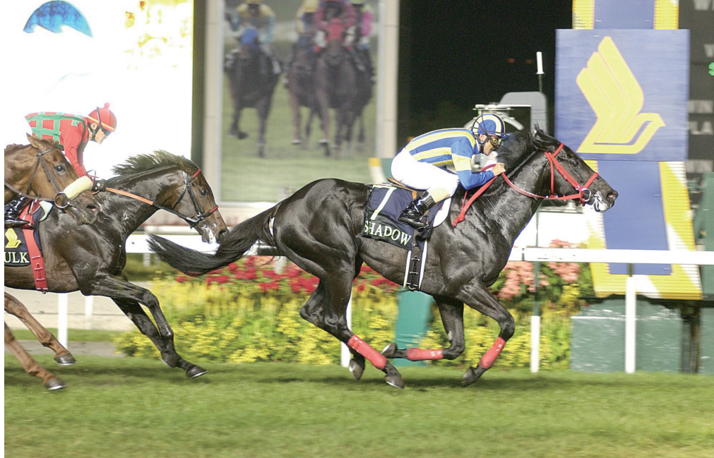
Shadow Gate vigorously running through the finish line.