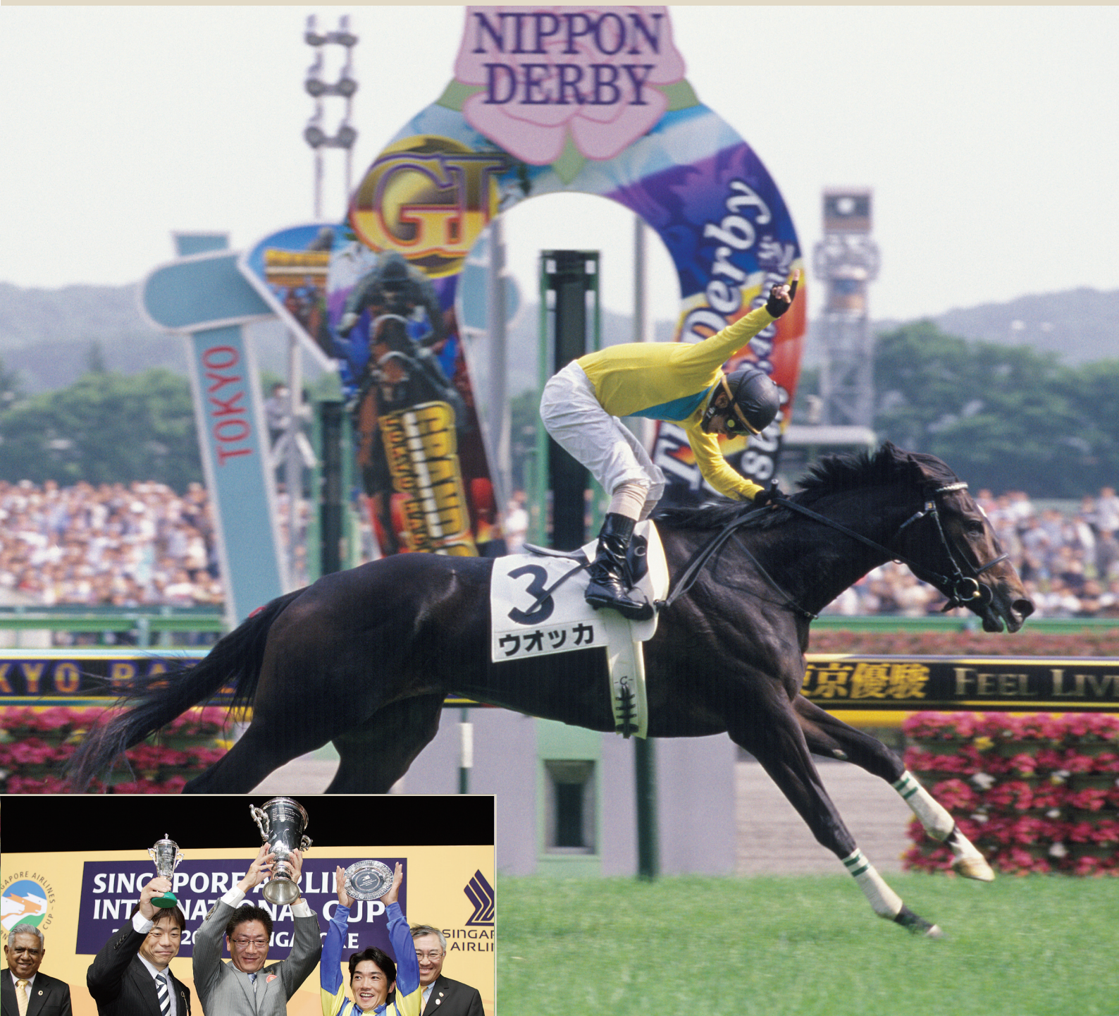
Another win at the Singapore Airlines International Cup!