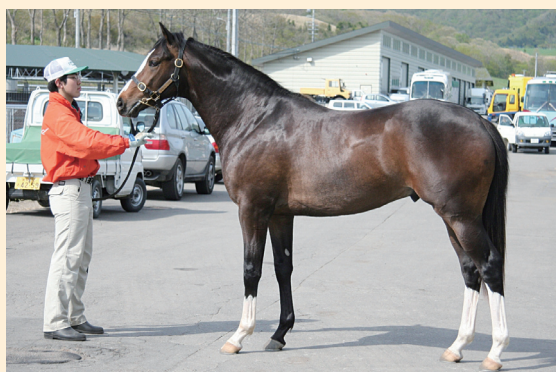
Colt offered at the top price (by Manhattan Cafe, out of Ibuki Pink Lady).

This sale produced a string of fine horses last year and because the number of foals on offer rose substantially from last year's 111, there were high expectations for the sale over a two-day period, but also partly affected by racing events held at the same time, the sales total unfortunately lagged the previous year.