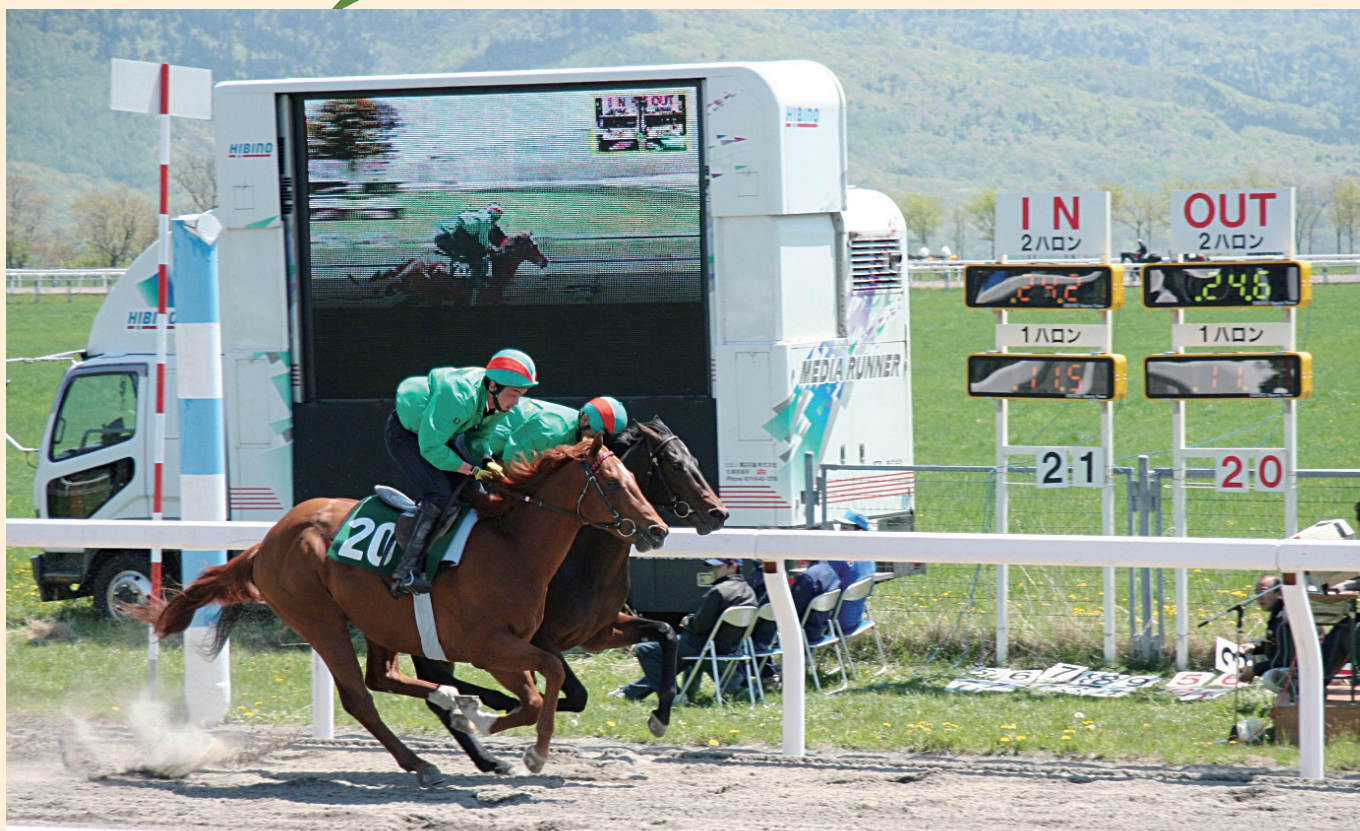
Horses offered at auction running in the morning track workout.