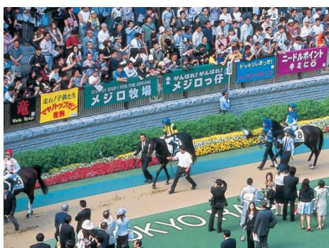
ne Parade Ring fence is lined with homemade banners put up by racing fans