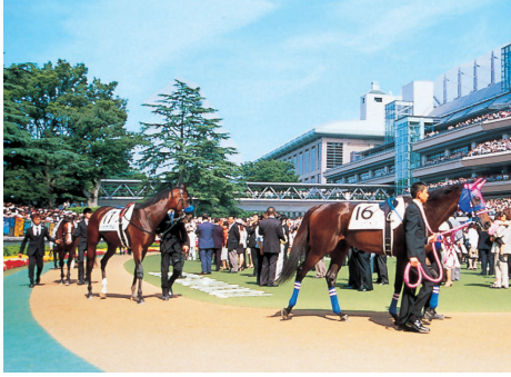
This is where you can check the condition of horses running in a race.