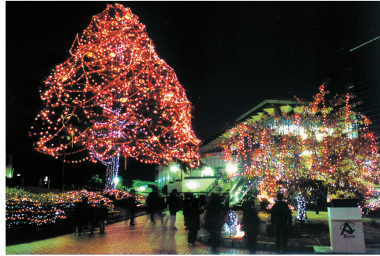
Christmas illuminations at Nakayama Racecourse