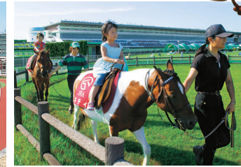
Horse carriages, pony rides