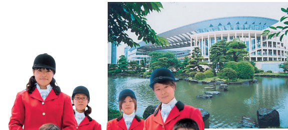
Japanese Garden at Kokura Racecourse