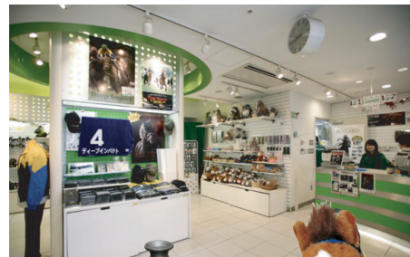
Plenty of souvenirs!