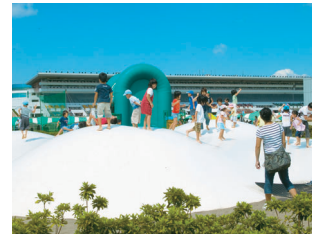
Play area and rides