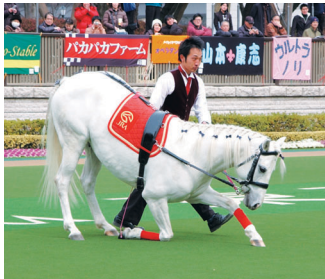
A huge selection of "Turfy" character gifts!