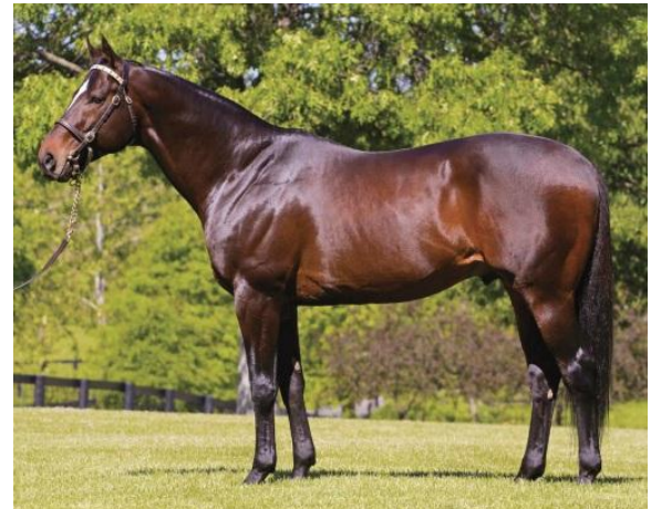
Empire Maker