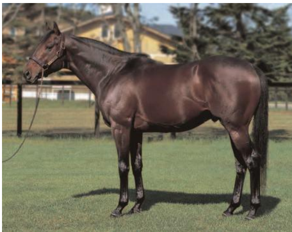
King Kamehameha