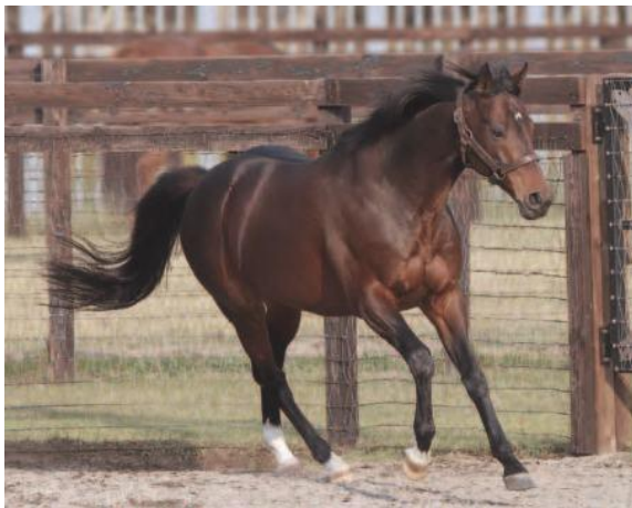
Deep Impact

An annual level in the upper 8,000s for foal crop had been maintained since 1997, but a declining trend began in 2003 and, as a result, 6,828 thoroughbred foals were registered in 2013. This is approximately the same number of foals as that of the late 1970s. This is a result of shifting from quantity to quality, as well as the steep decline in the demand for thoroughbreds caused by the closure of a number of Racing by Local Governments racecourses.